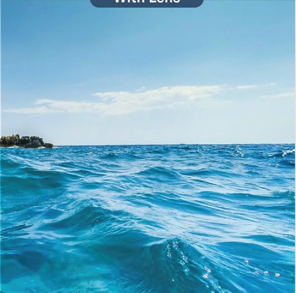
Image: Revo branding highlighting key features: 100% polarized lenses, 100% UV protection, and technology developed by a NASA scientist.