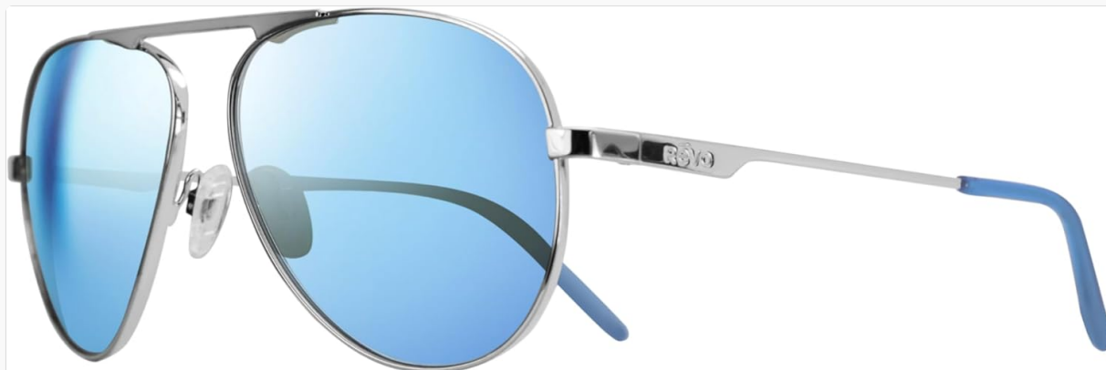
Image: Revo Metro Polarized Aviator Sunglasses with chrome frame and blue water lenses, shown from a front-side angle.

Thank you for choosing Revo Metro Polarized Aviator Sunglasses. These sunglasses are designed for both style and performance, featuring advanced lens technology and a durable frame. This manual provides essential information for the proper setup, operation, maintenance, and care of your new sunglasses.