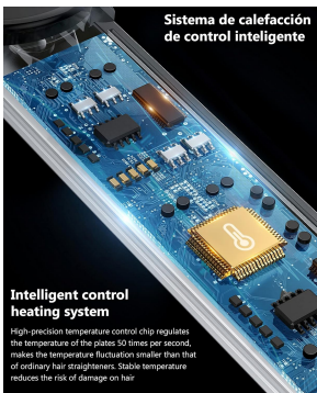
Internal view highlighting the intelligent temperature control system.