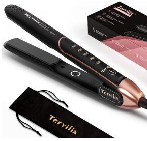
The Terviiix Golden Standard Styler, shown with its carrying bag and packaging.