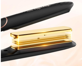
Plates infused with argan oil, keratin, and tourmaline for 3X less damage.

aceite de argán / queratina / turmalina infundidos en placas