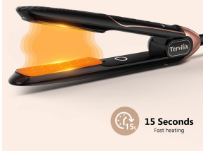
Illustrates the ultra-fast 15-second heating capability.

El mejor calentador PTC de su clase reduce el tiempo calentamiento a 15s