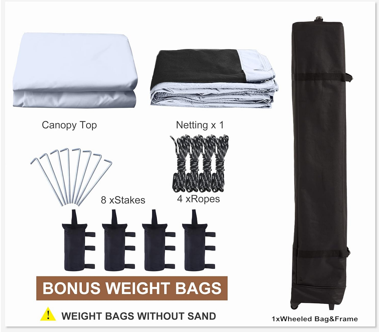
Figure 1: All components included in the package.