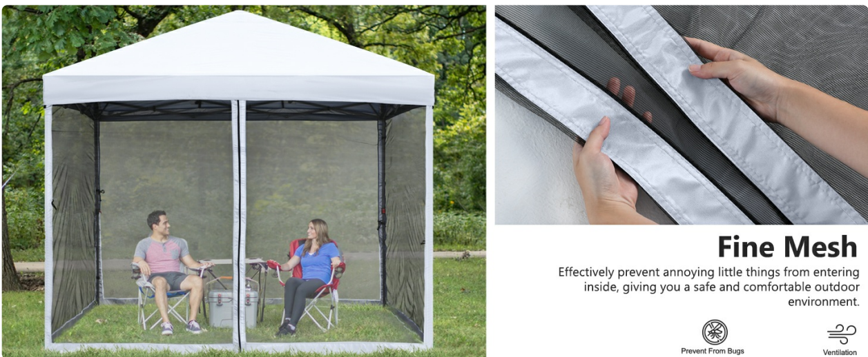
Figure 5: UV and Water-Resistant Materials.