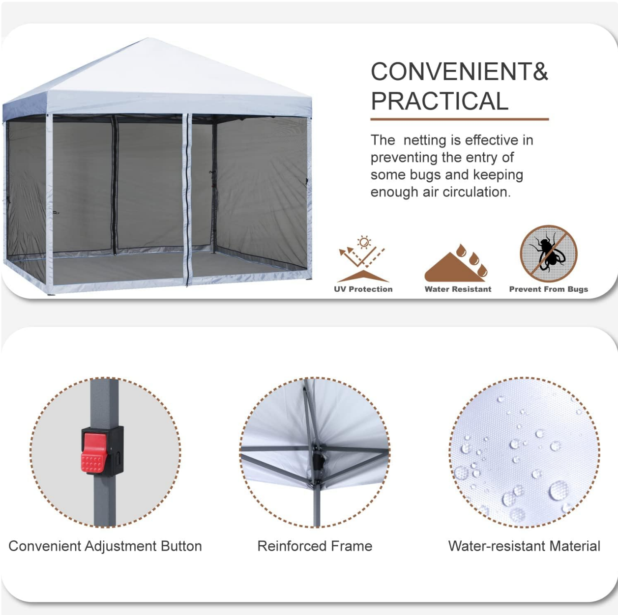
Figure 4: Convenient and practical features of the canopy.