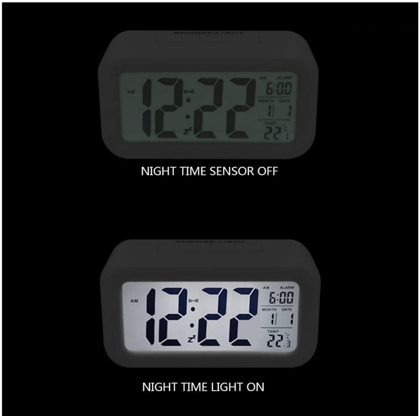
Image 4.6: Comparison showing the display with the night light off and with the night light activated.