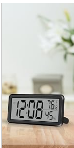
Image 4.5: The temperature display on the clock, with an indicator for the °C/°F button.