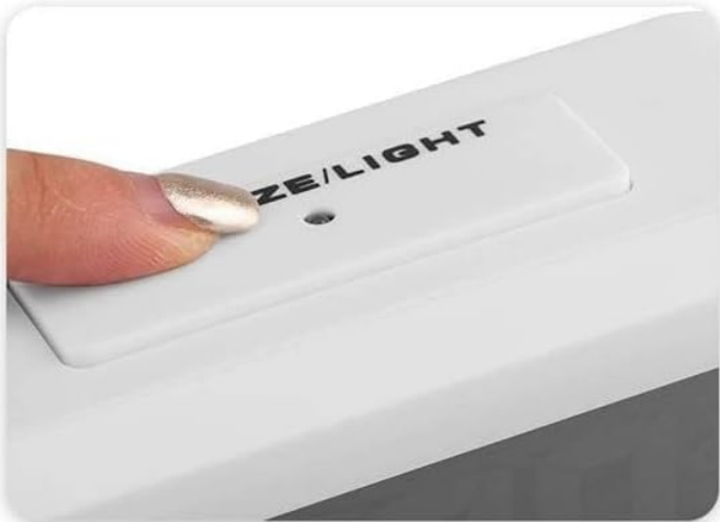
Backlight snooze button