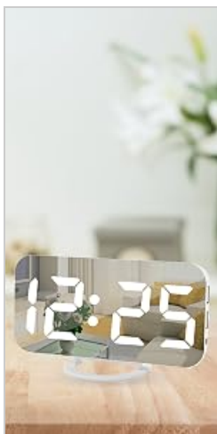
Image 4.1: The 12/24H button allows switching between time formats.