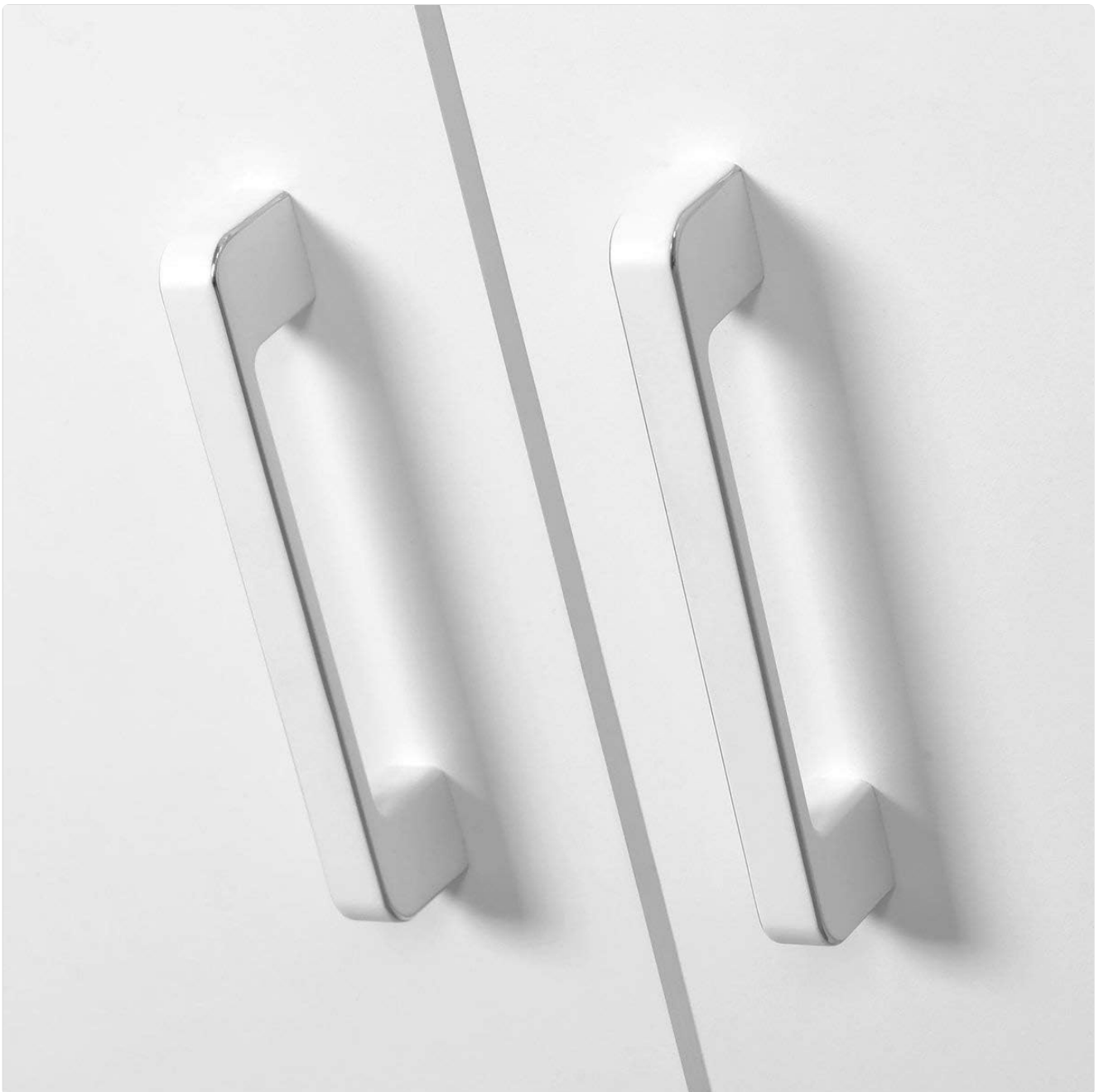
Image 4.2: A detailed shot of the cabinet handles, showing their design and how they are attached to the doors, providing a clear visual for assembly.