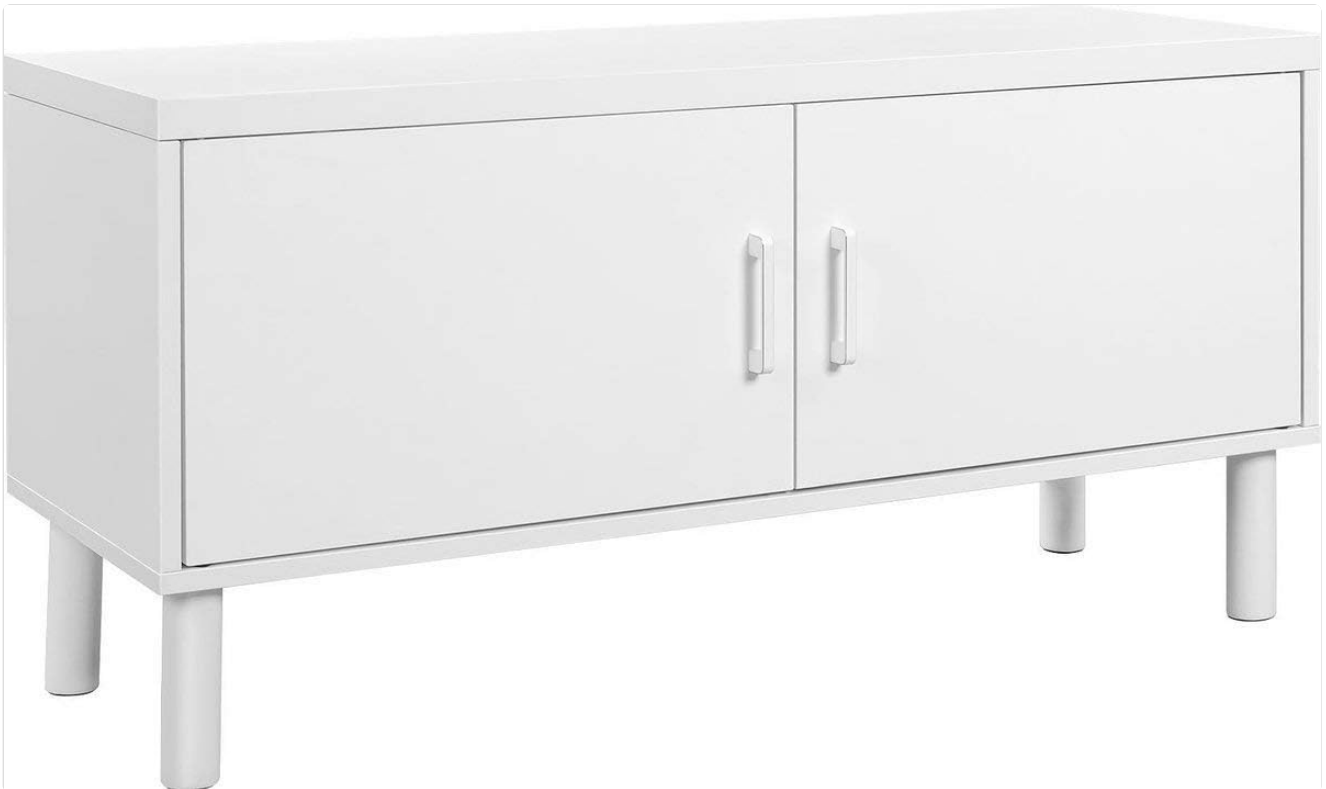
Image 1.1: Front view of the IN-HOMEXL Flat Shoe Cabinet in white, showcasing its sleek, minimalist design with two doors and four sturdy legs.

Thank you for choosing the IN-HOMEXL Flat Shoe Cabinet. This cabinet is designed to provide a practical and stylish storage solution for your footwear, helping you organize your entryway or living space efficiently. Its flat design and height-adjustable shelves make it versatile for various shoe types, from sneakers to high boots. This manual provides essential information for assembly, operation, maintenance, and troubleshooting to ensure you get the most out of your product.