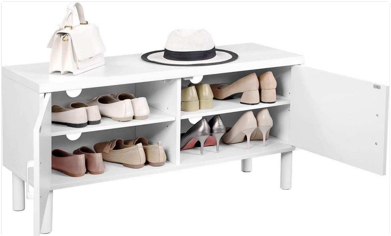
Image 5.1: The shoe cabinet with its doors open, revealing the interior shelves filled with various types of shoes. This image demonstrates the practical storage capacity and the adjustable nature of the shelves.