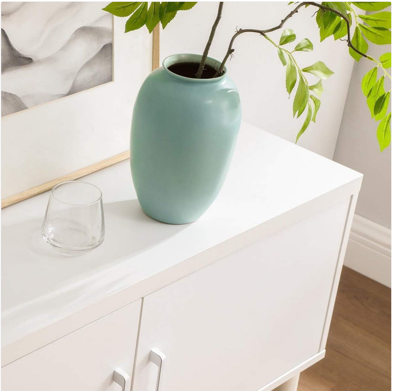
Image 6.1: A view of the top surface of the shoe cabinet, adorned with a decorative vase and glass. This highlights the cabinet's potential as a display surface and emphasizes the importance of keeping it clean.