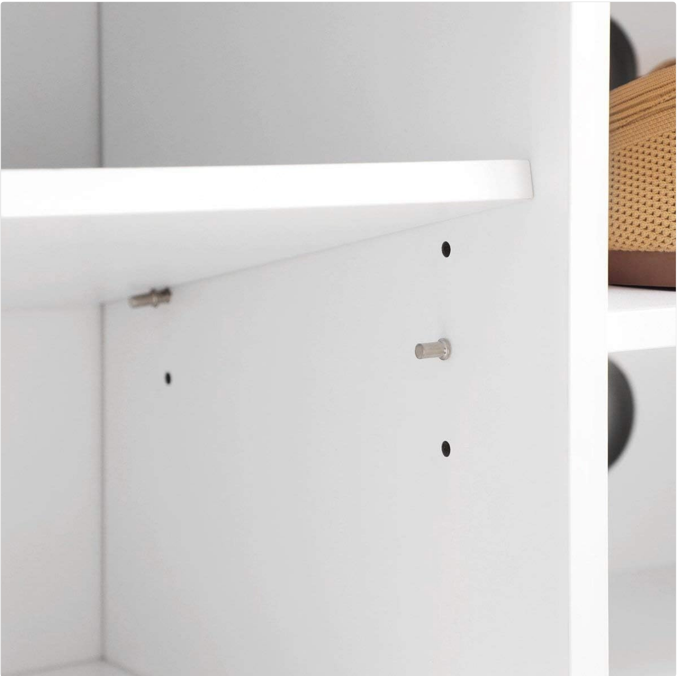
Image 4.1: A close-up view of the pre-drilled holes for the adjustable shelf pins inside the cabinet, illustrating the flexibility in shelf placement to accommodate different shoe heights.