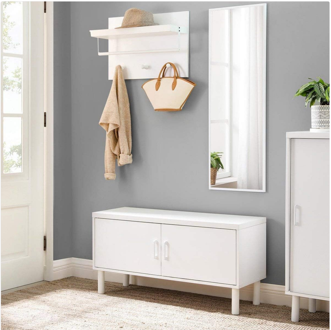
Image 1.2: The shoe cabinet positioned in a hallway, demonstrating its compact size and how it complements other furniture, providing a functional and aesthetic addition to an entryway.