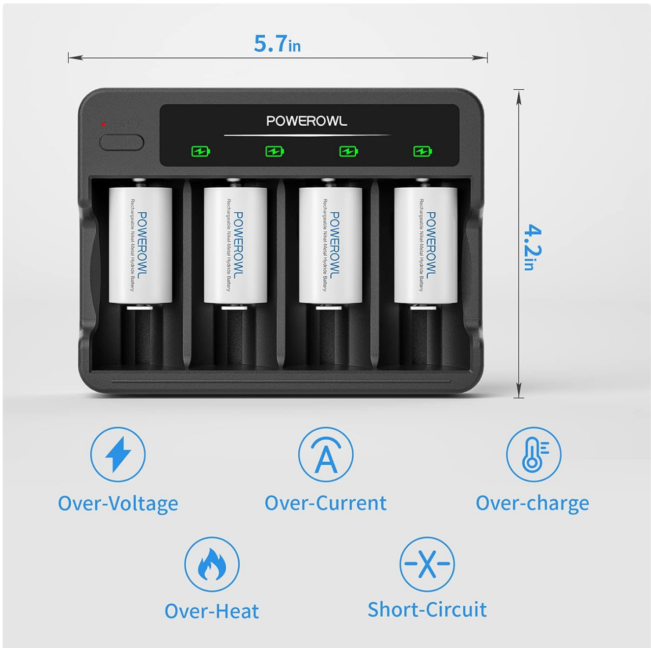
Image: Visual representation of the charger's dimensions and its integrated safety features, including protection against over-voltage, over-current, over-charge, over-heat, and short-circuits.