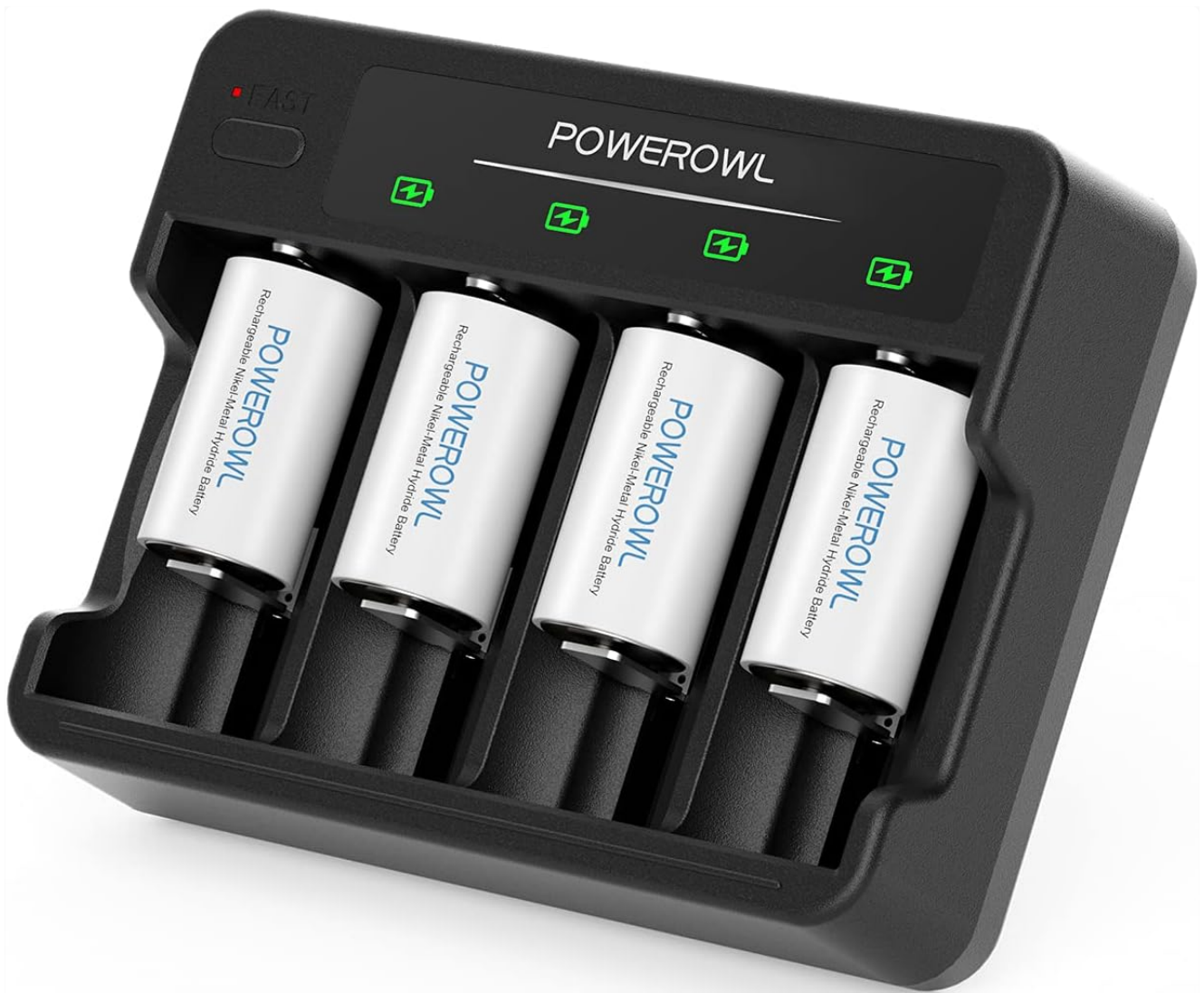
Image: The POWEROWL 4-Bay charger with four C-size rechargeable batteries correctly inserted into their respective charging slots.