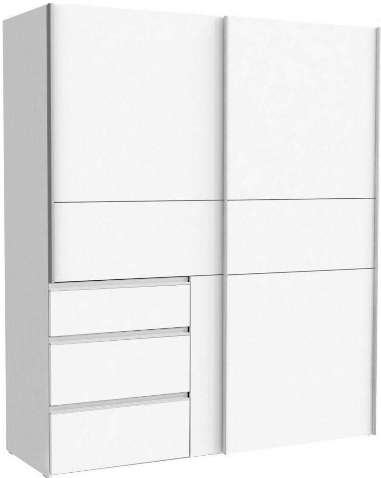
Image: The fully assembled DEINE TANTE EMMA Winn White Sliding Door Wardrobe, showcasing its clean white finish and integrated drawers.