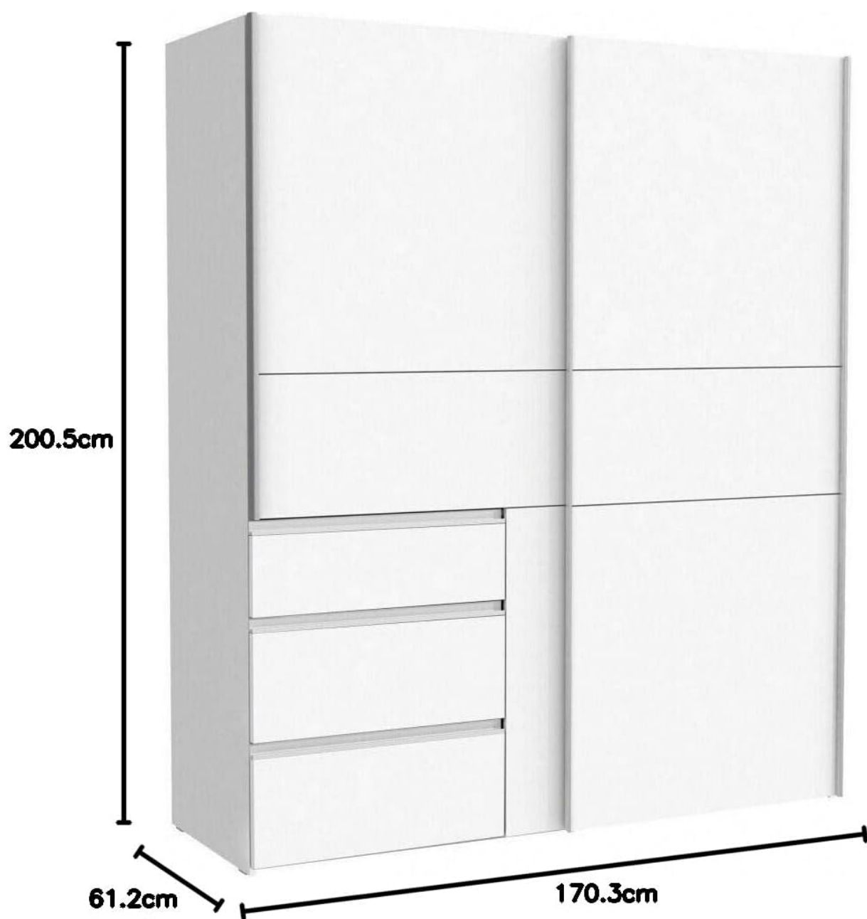
Image: A diagram illustrating the approximate dimensions of the wardrobe: 170.3 cm (width), 200.5 cm (height), and 61.2 cm (depth).