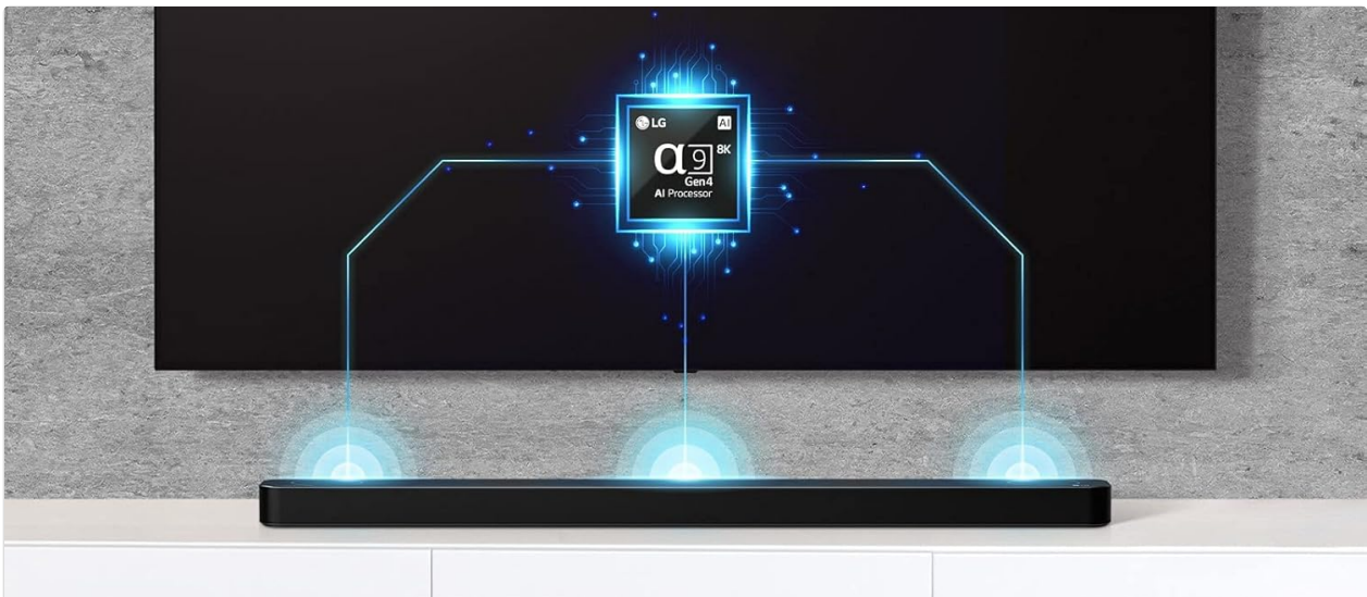
Figure 2: Sound Bar Placement with Television