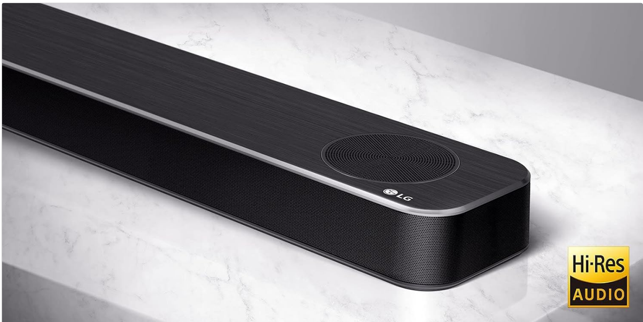
Figure 4: Hi-Res Audio Support