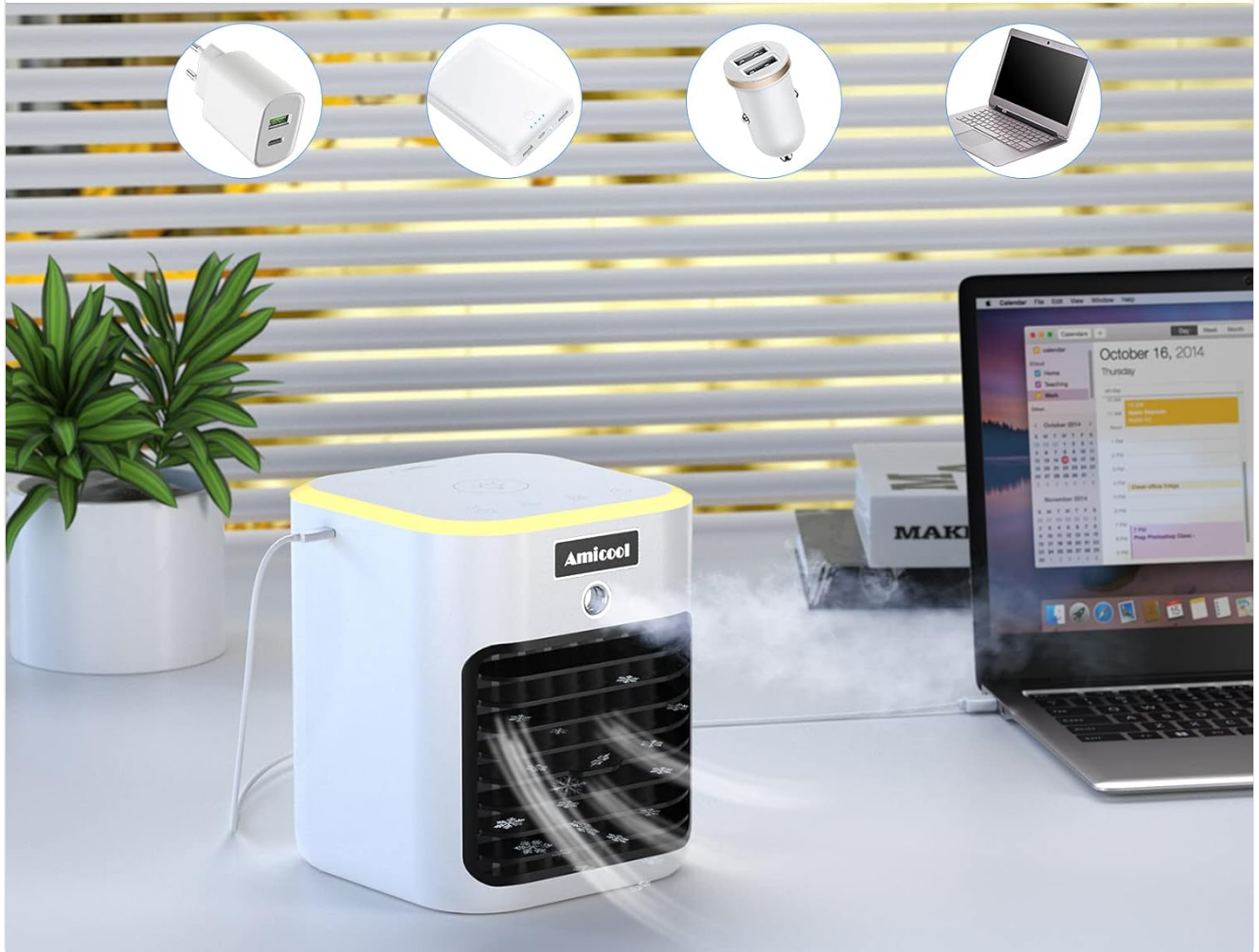
Figure 2.3: The USB power design allows for flexible power options.

Equipped with a USB cable, any electrical energy with a USB interface can be used.