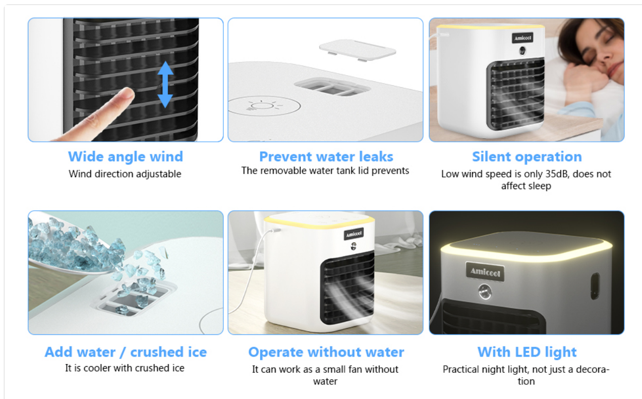
Figure 4.1: Illustration of adding water or crushed ice to the unit.