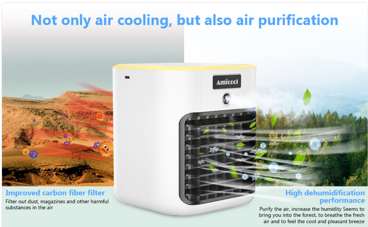
Figure 6.1: The unit's air purification capability with an improved carbon fiber filter.