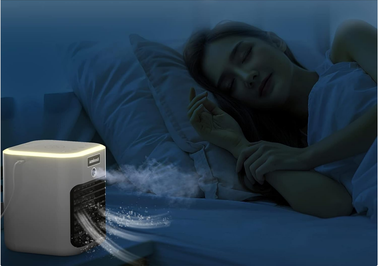
Figure 2.4: The unit features an LED light and a timer function for convenience.

Mini mobile air conditioner has 1h, 2h and 3h timer function. You can control the running time of the portable air conditioner at will.