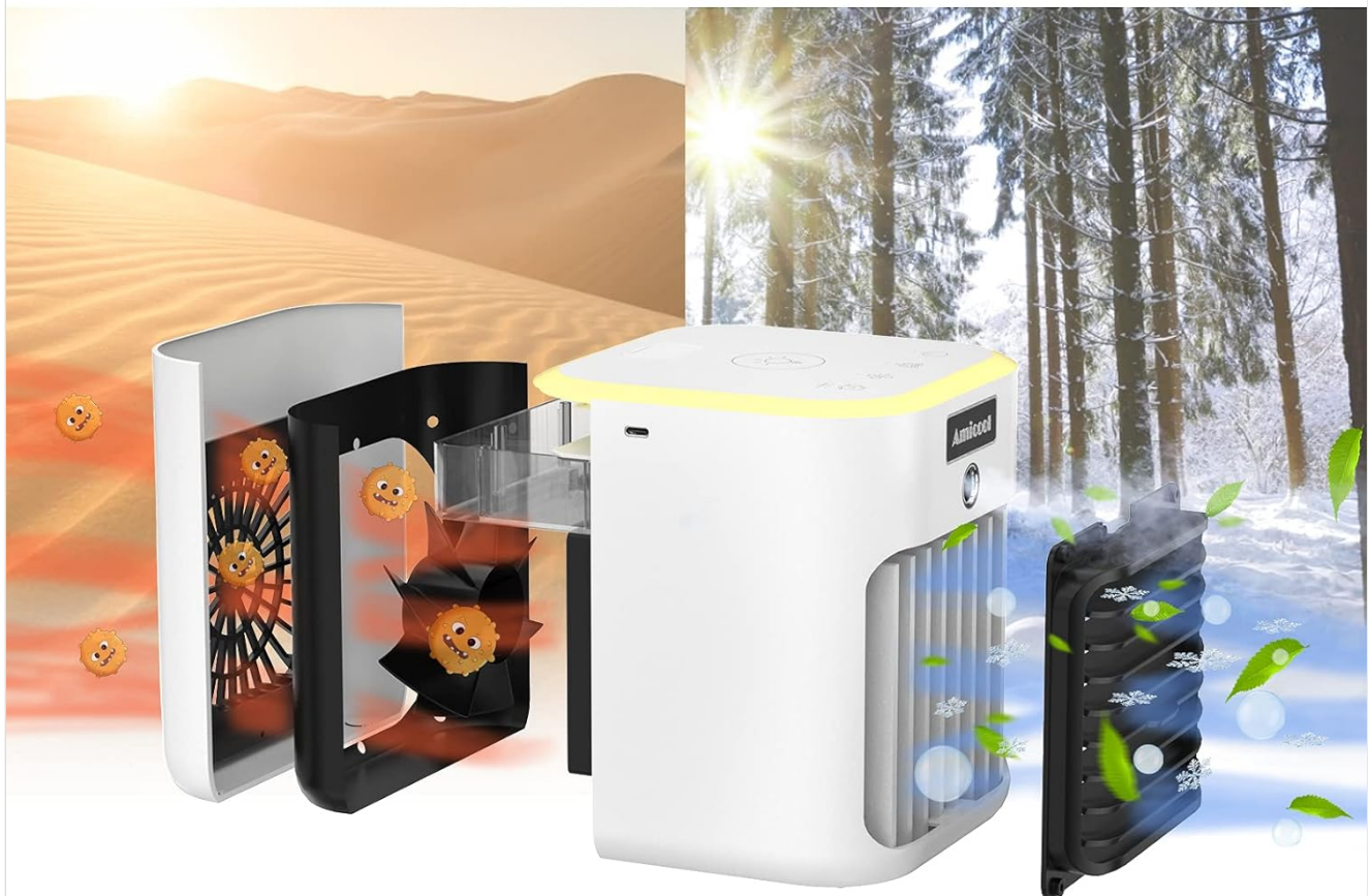
Figure 2.1: The 4-in-1 design of the Amicool YB88, illustrating temperature reduction with different water types.