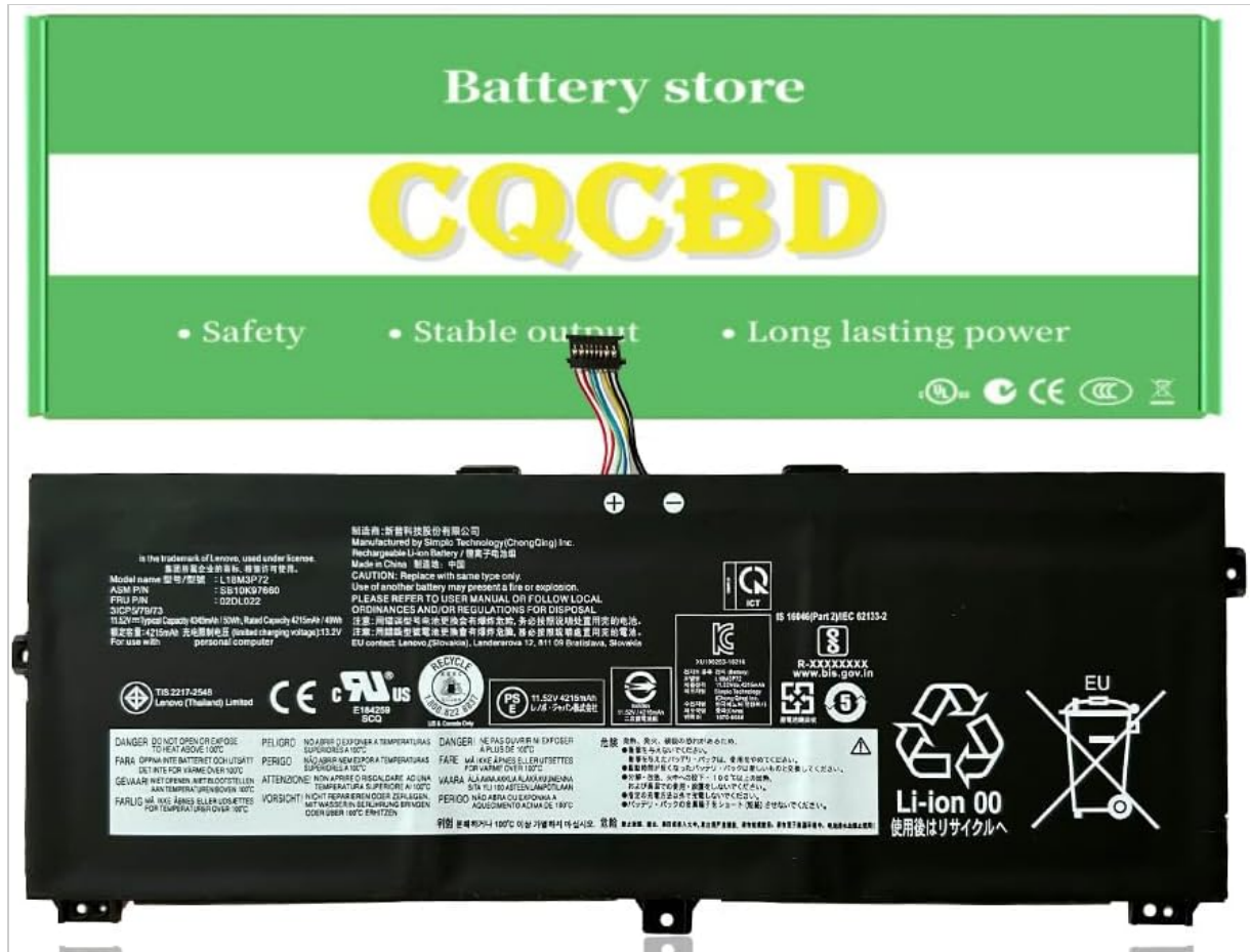
Image: Front view of the CQCQ L18L3P72 laptop battery, showing connectors and regulatory markings.