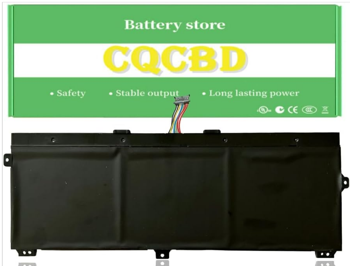
Image: Back view of the CQCQ L18L3P72 laptop battery, showing the smooth casing.