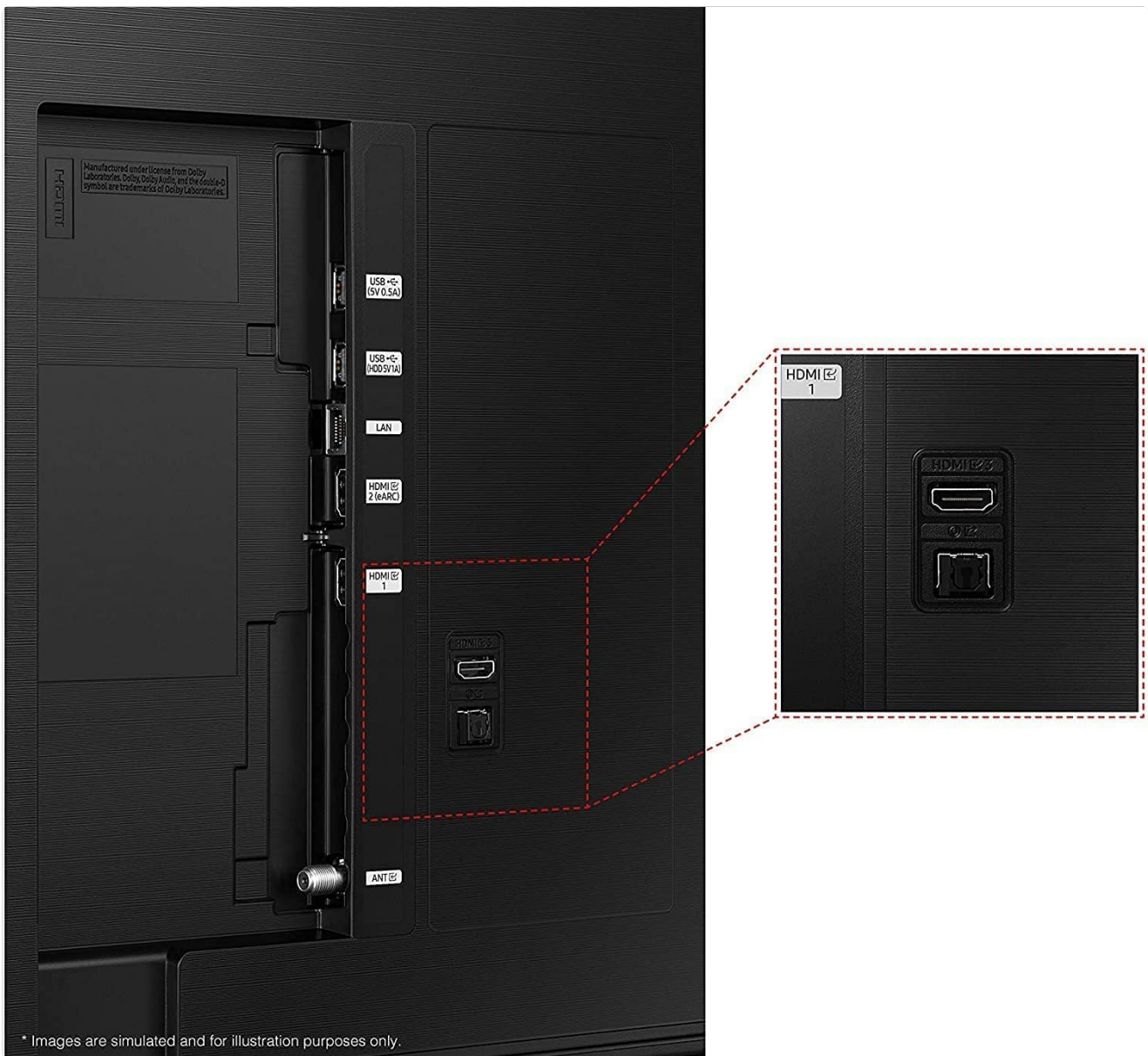
Figure 3.2: Rear view of the TV showing connectivity ports.