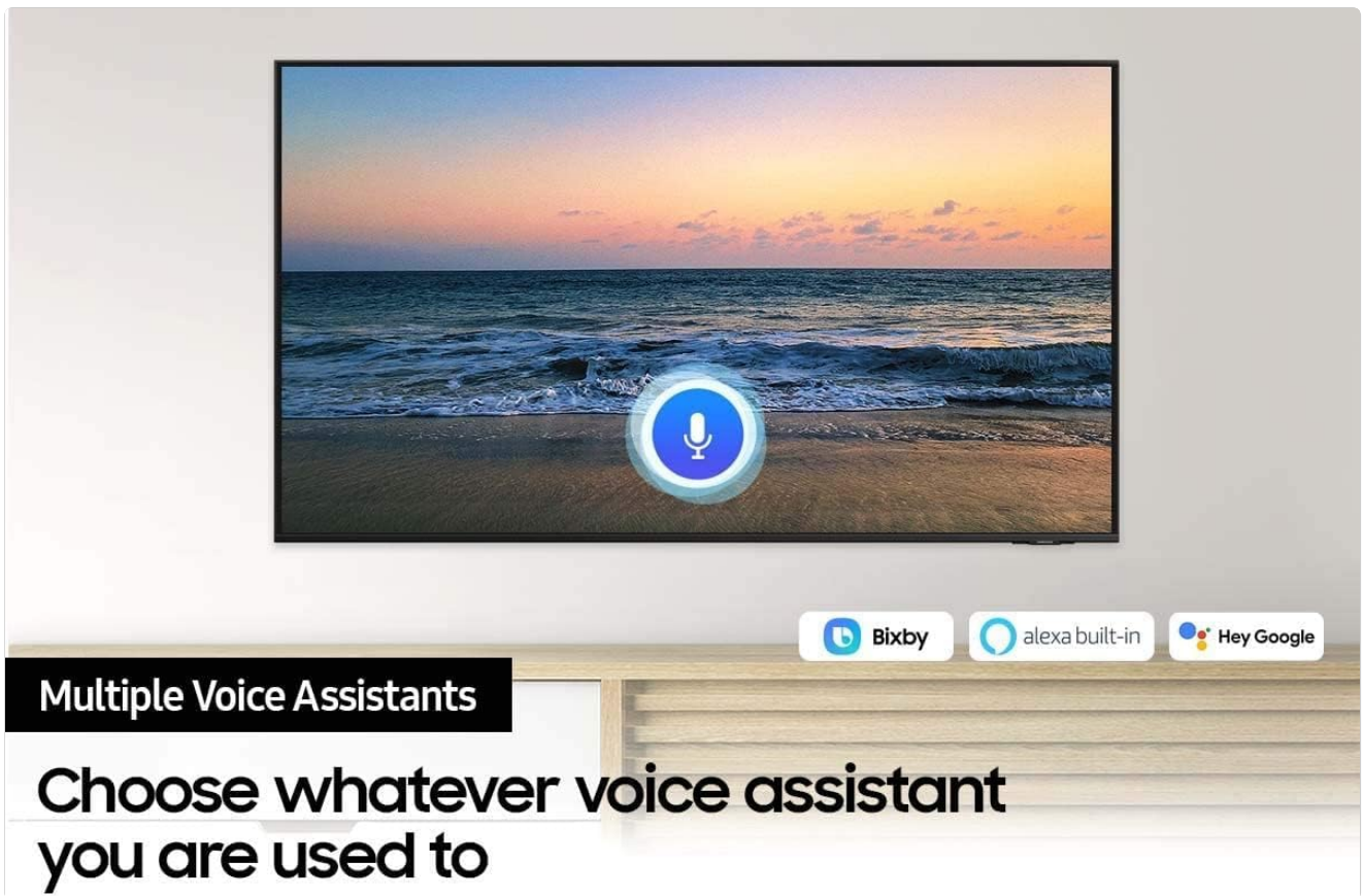
Figure 3.1: Front view of the Samsung 75-Inch Crystal UHD AU8000 Series TV.