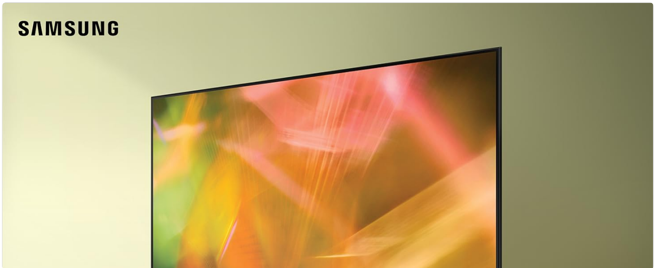
Figure 4.1: The TV supports multiple voice assistants for easy control.