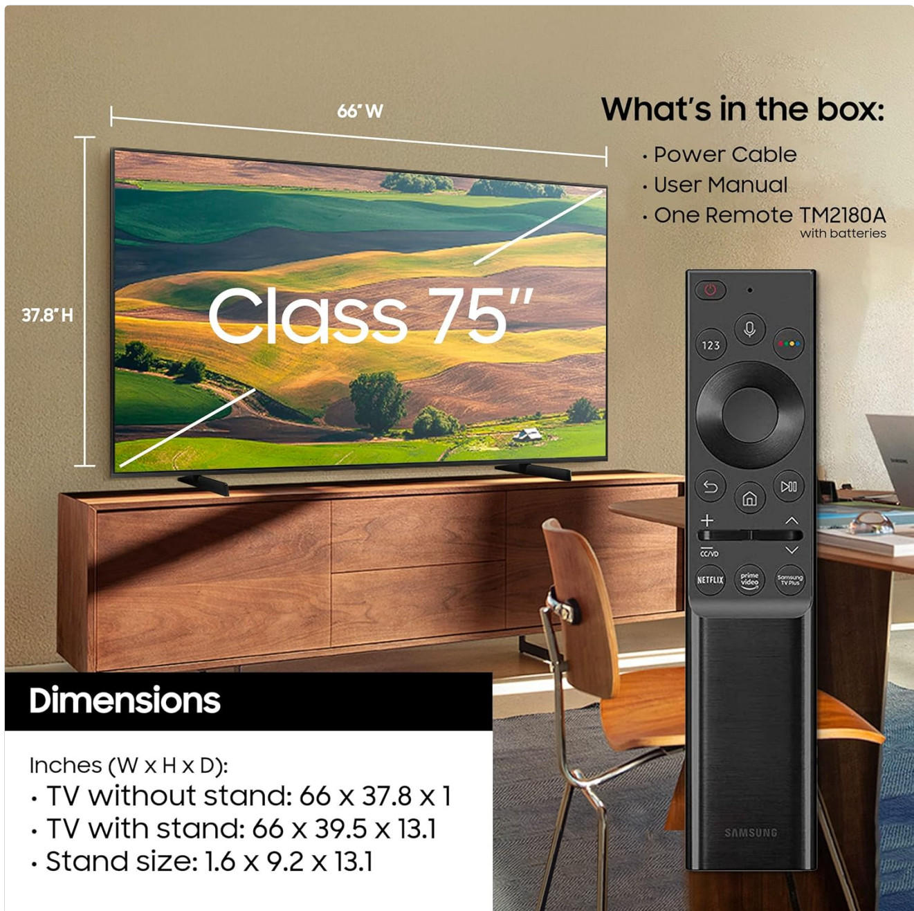
Figure 2.1: Samsung 75-Inch TV with included accessories and dimensions.