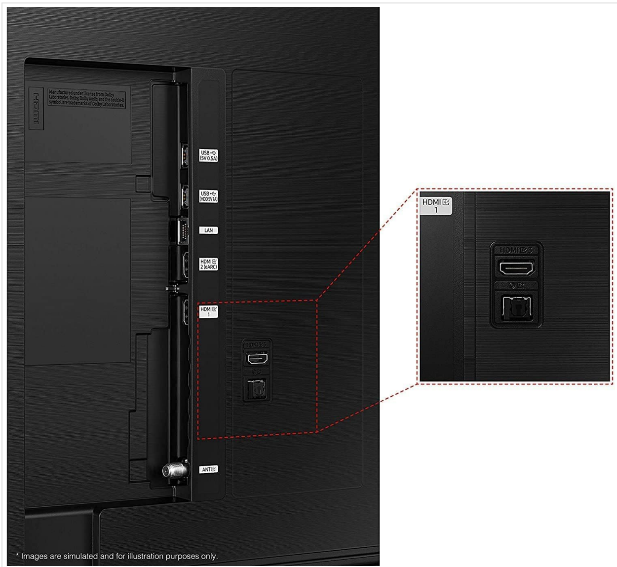
Image: Close-up of the rear panel of the TV, highlighting the HDMI, USB, LAN, and antenna input ports.