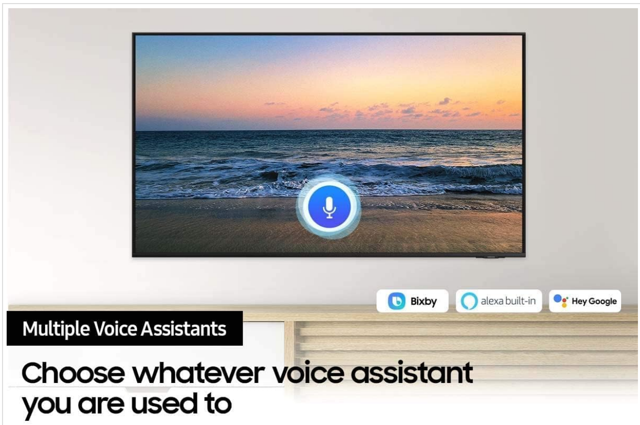
Image: A SAMSUNG TV screen displaying a voice assistant icon, with logos for Bixby, Alexa Built-in, and Hey Google below, indicating multiple voice assistant support.

The TV includes built-in voice assistants (Alexa, Bixby, Google Assistant). Use the microphone button on your OneRemote to activate and control your TV with voice commands. You can change channels, adjust volume, search for content, and control compatible smart home devices.