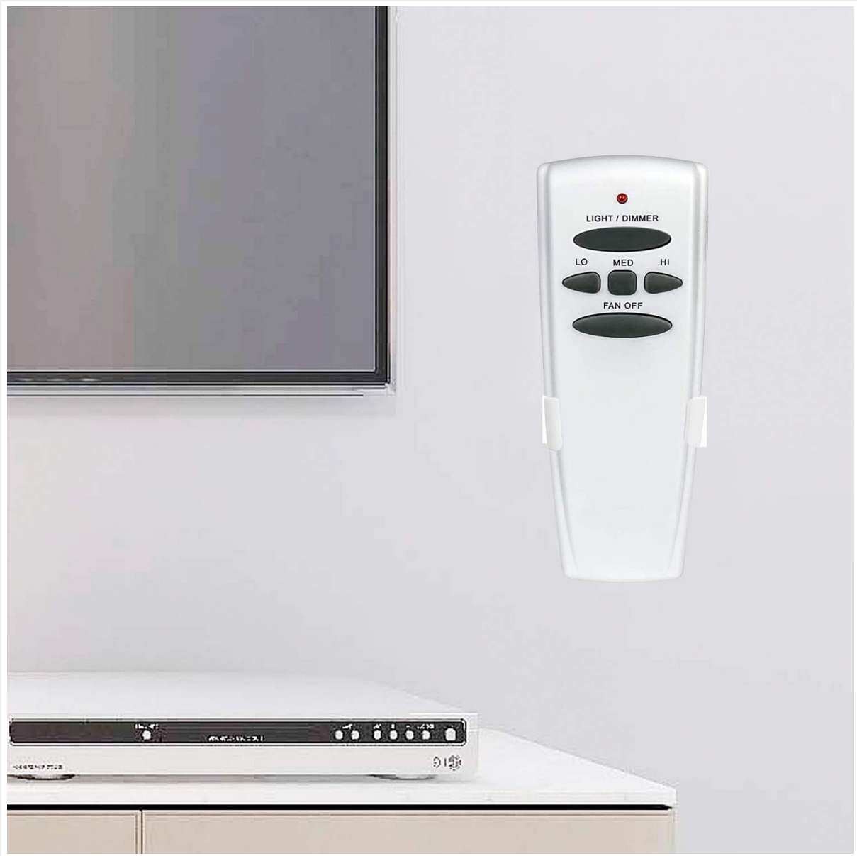
Image: The Motiexic UC7078T remote control securely placed in its wall-mounted holder, demonstrating a convenient storage solution.