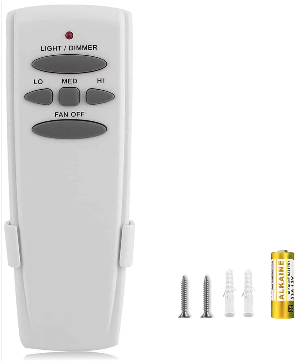
Image: Contents of the Motiexic UC7078T remote control package, including the remote, wall mount, screws, anchors, and an example 12V battery (battery not included).