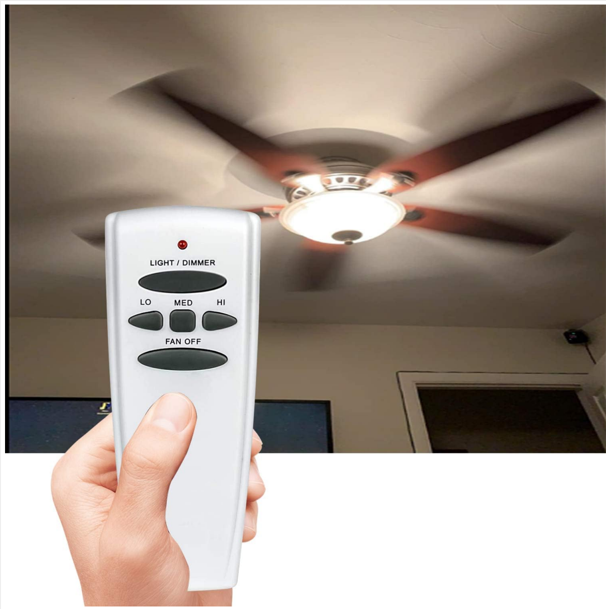
Image: A hand holding the Motiexic UC7078T remote control, with a ceiling fan operating in the background, illustrating typical use.