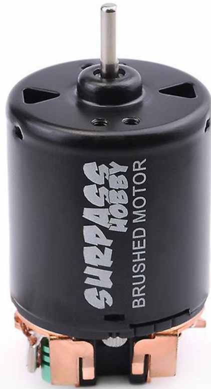
Figure 4.1: Front view of the DollaTek 540 21T Brushed Motor, showing the 'SURPASS HOBBY BRUSHED MOTOR' label.

The DollaTek 540 21T Brushed Motor features high purity copper windings for maximum efficiency and a precision-balanced rotor for reliability and high RPM. The 60A Brushed ESC provides excellent configuration, acceleration, and linearity characteristics, along with strong resistant current capacity and good heat dissipation. It is also 100% waterproof.