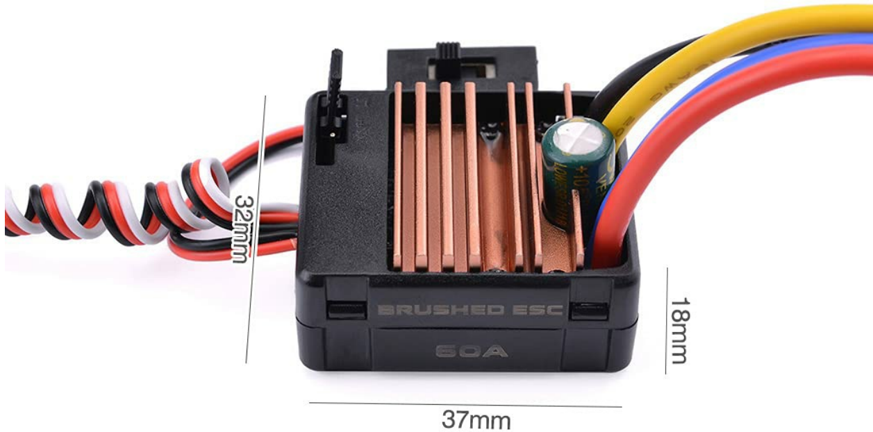
Figure 4.5: Side view of the DollaTek 60A Brushed ESC with key dimensions (37mm, 32mm, 18mm) indicated.

This image presents the ESC from the side, with overlaid measurements indicating its length (37mm), width (32mm), and height (18mm), useful for installation planning.