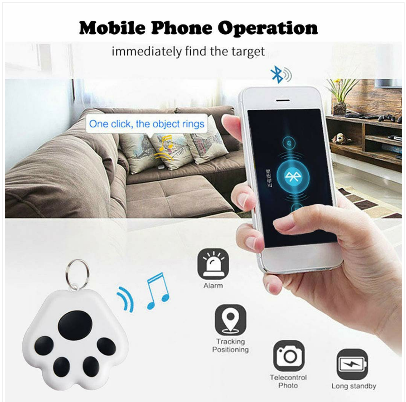
Figure 3: Mobile Phone Operation Interface

This image illustrates the mobile phone operation with the tracker. It shows a smartphone displaying the app interface, with a Bluetooth connection symbol. Below, icons represent key functions: Alarm, Tracking Positioning, Telecontrol Photo (remote selfie), and Long Standby, indicating the device's capabilities.