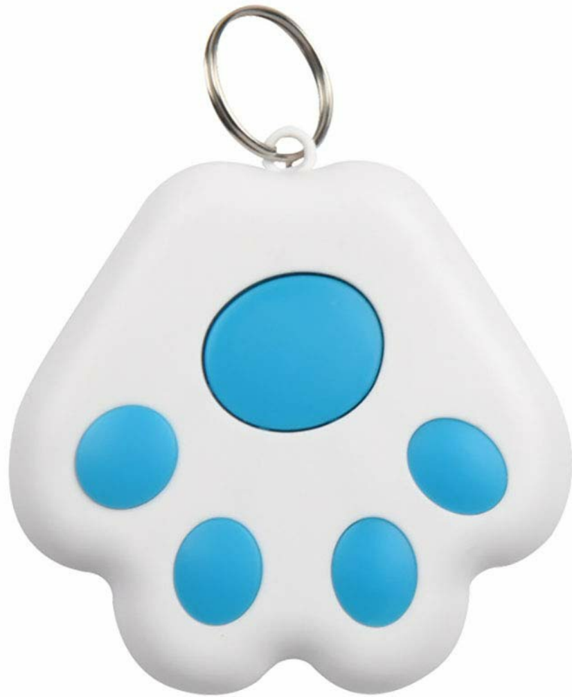
Figure 1: YUYOU Pet Smart GPS Tracker (Blue)

This image displays the blue YUYOU Pet Smart GPS Tracker. It is shaped like a paw print, predominantly white with blue accents for the main button and four smaller 'toe' buttons. A metal keyring is attached at the top.