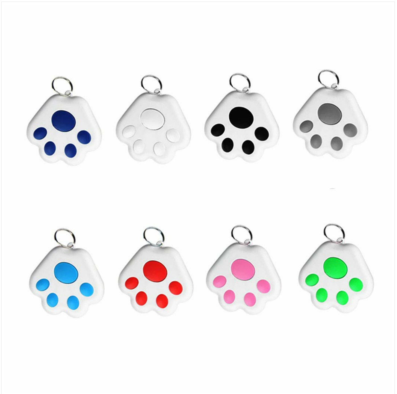
Figure 2: Available Color Options

This image shows eight YUYOU Pet Smart GPS Trackers, each with a white paw-print body and different colored buttons: blue, white, black, grey, red, pink, and green. This illustrates the range of color choices available for the device.