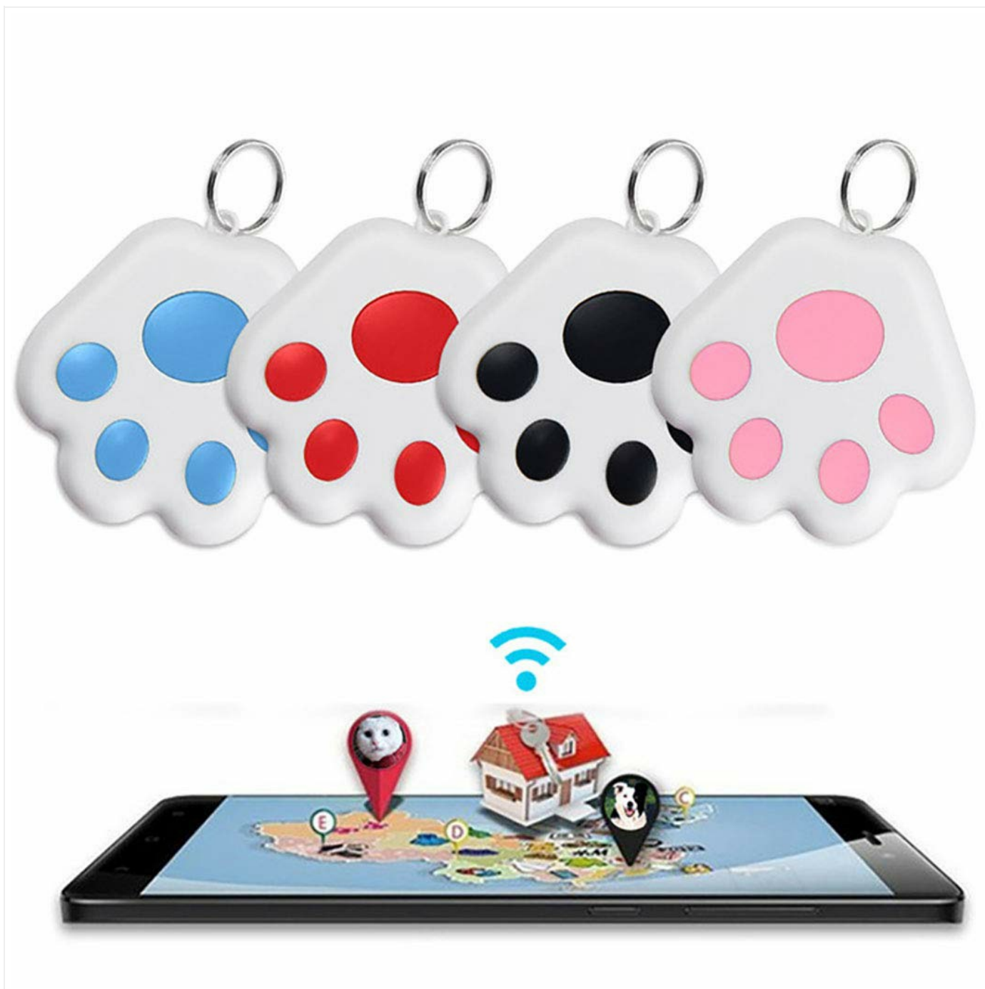
Figure 5: Last Seen Location Tracking

This image depicts a smartphone screen displaying a map with multiple location pins. These pins represent the last known locations of various YUYOU trackers, demonstrating the app's ability to track and display the whereabouts of multiple paired devices.