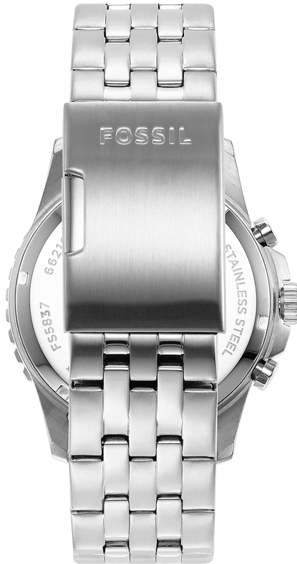
Figure 7.2: Back view of the watch, displaying model number FS5837 and 'STAINLESS STEEL'.