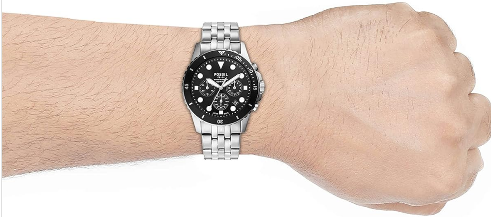
Figure 2.2: The Fossil FB-01 FS5837 Analog Watch worn on a wrist.