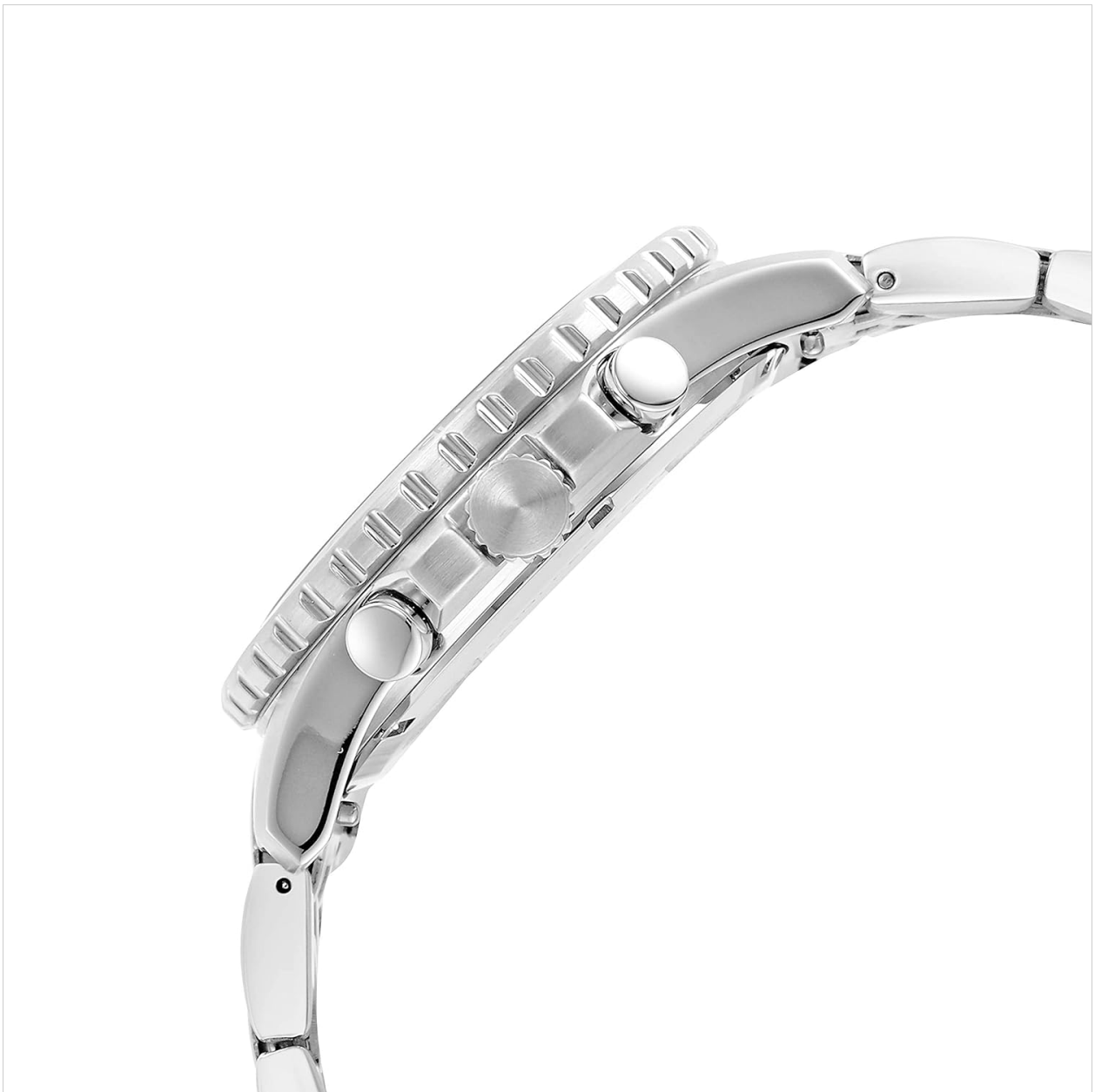
Figure 3.1: Side view illustrating the crown and pushers for time and chronograph adjustments.