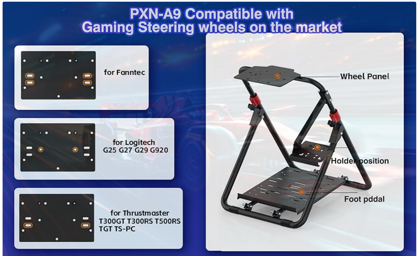
Image 5.1: Compatibility overview with specific mounting patterns for various racing wheel brands.

Note: Steering wheel, pedals, and shifter are not included with the stand.