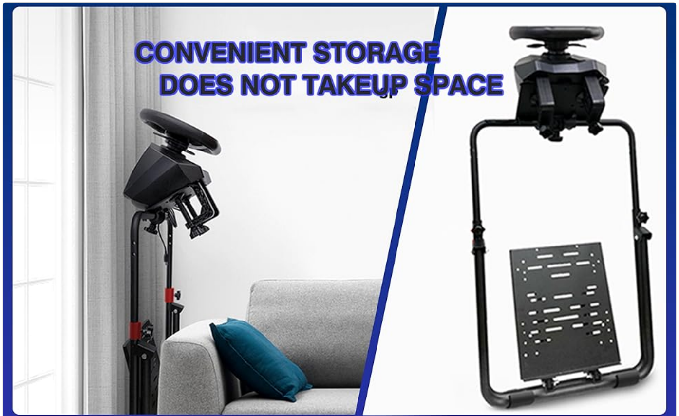
Image 7.1: The stand before and after folding, demonstrating its space-saving design.