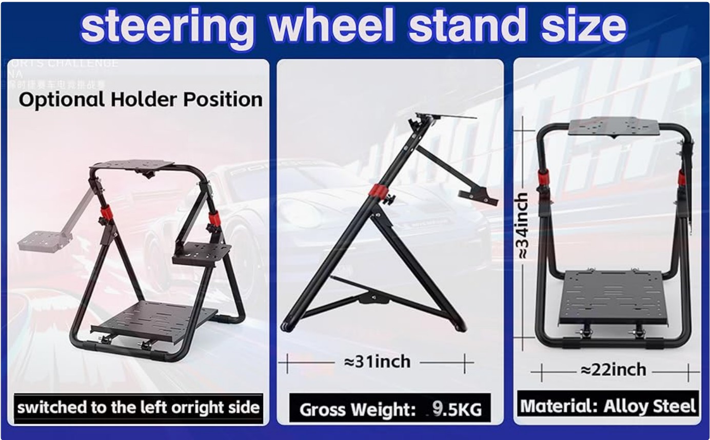
Image 8.1: Detailed dimensions of the PXN-A9 Steering Wheel Stand.