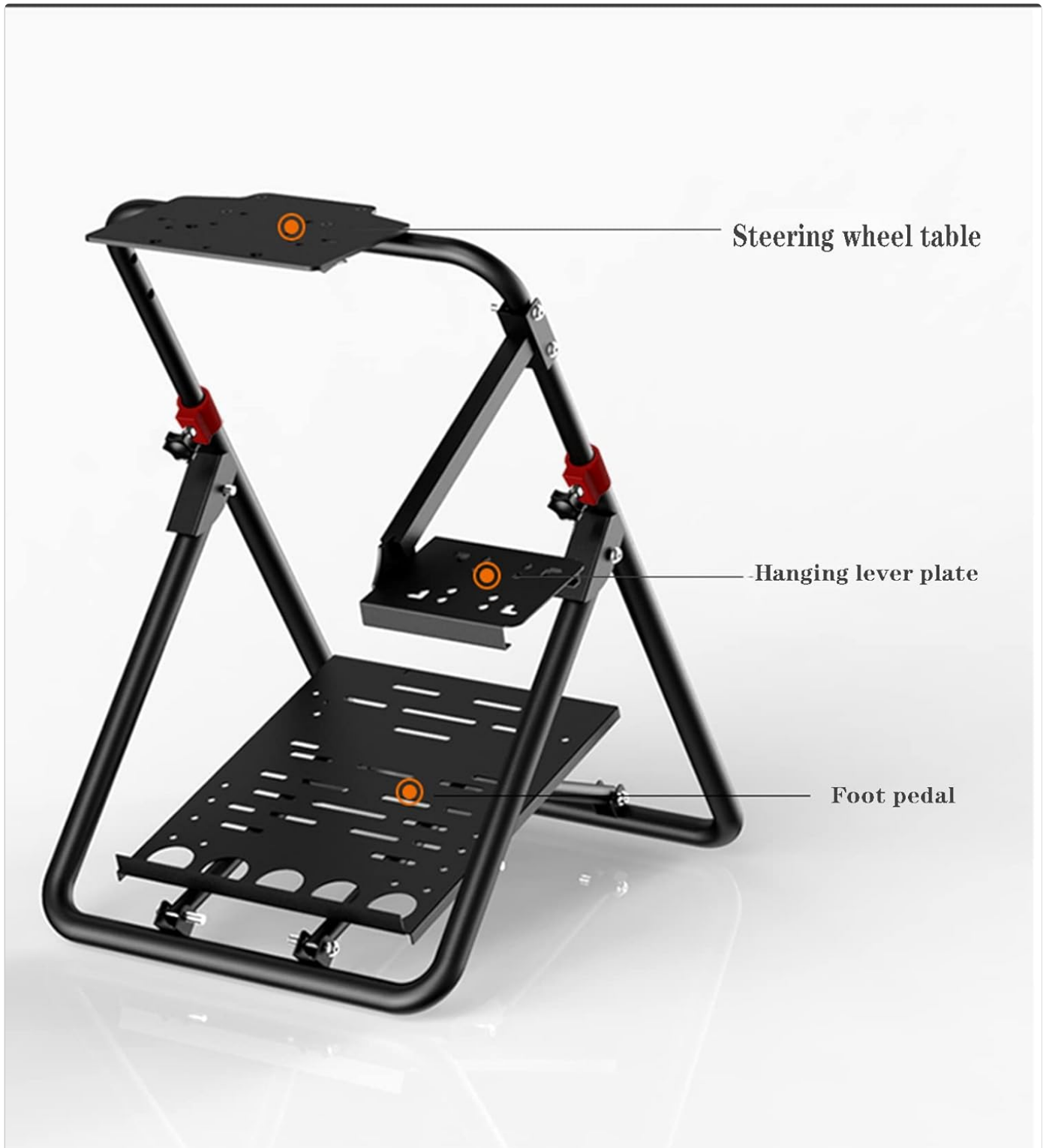
Image 4.1: Identification of key components: Steering wheel table, hanging lever plate (shifter mount), and foot pedal plate.

6. Final Adjustments: Once all components are mounted, proceed to the "Adjustments" section to customize the stand to your preferred height and angle.