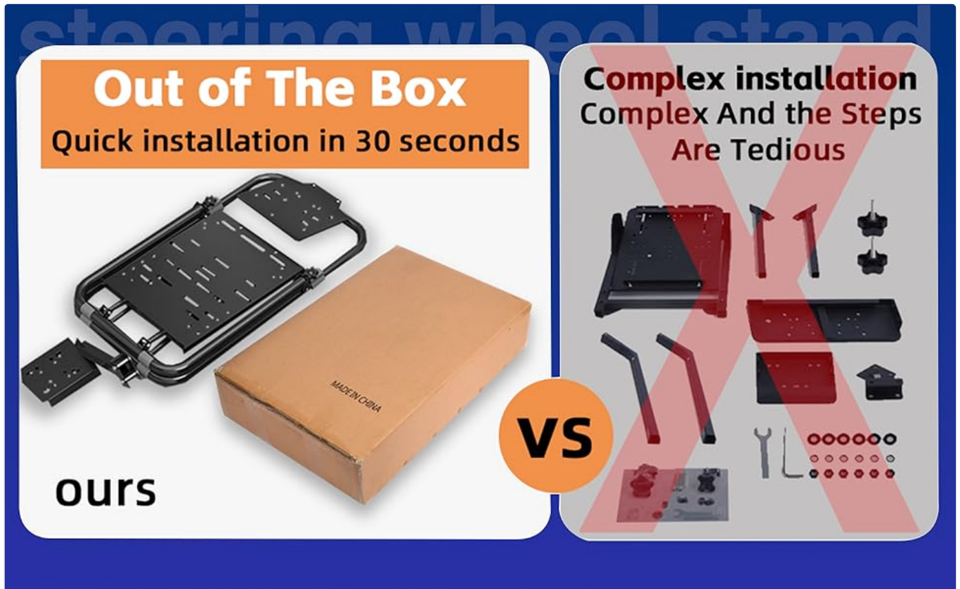
Image 3.1: The PXN-A9 stand components as they appear out of the box, highlighting its quick installation design.