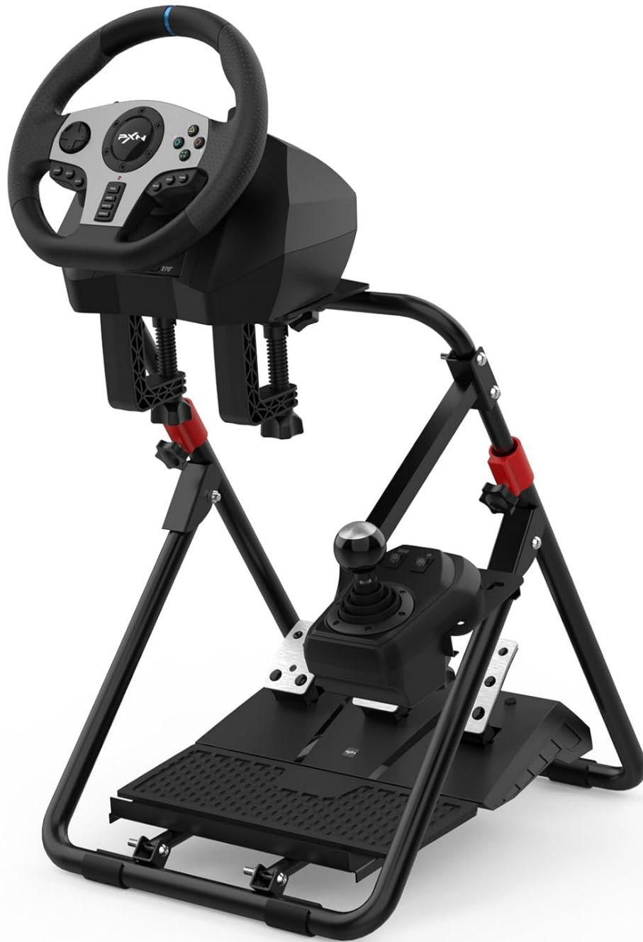
Image 1.1: The PXN-A9 Steering Wheel Stand fully assembled with a steering wheel, pedals, and shifter.