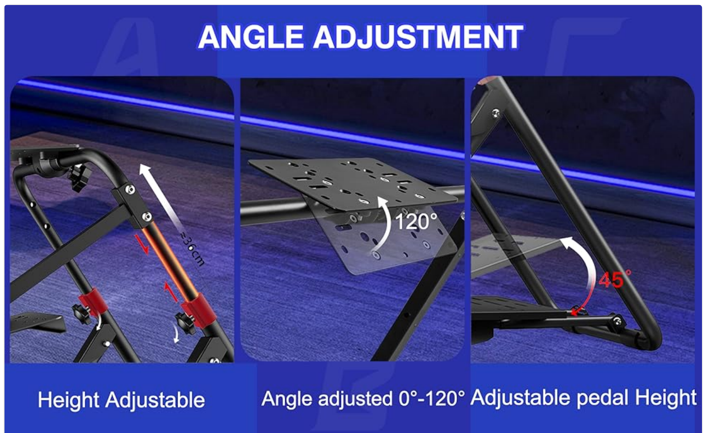
Image 6.1: Demonstration of the telescopic height adjustment feature.