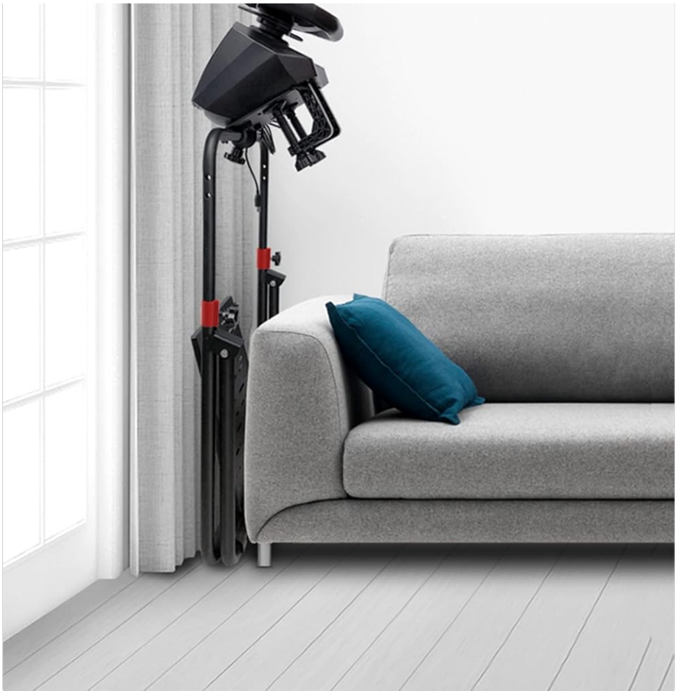
Image 7.2: The folded stand stored compactly, not occupying significant space.