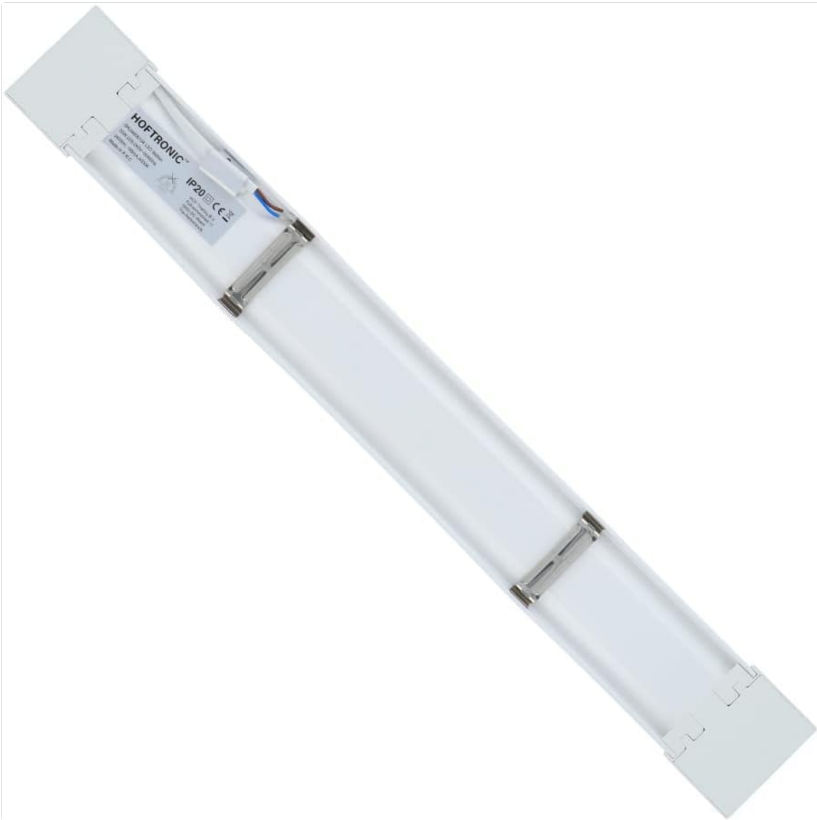
Image: The underside of the HOFTRONIC LED Batten, revealing the internal wiring and connection points. This view is relevant for understanding the electrical hookup.