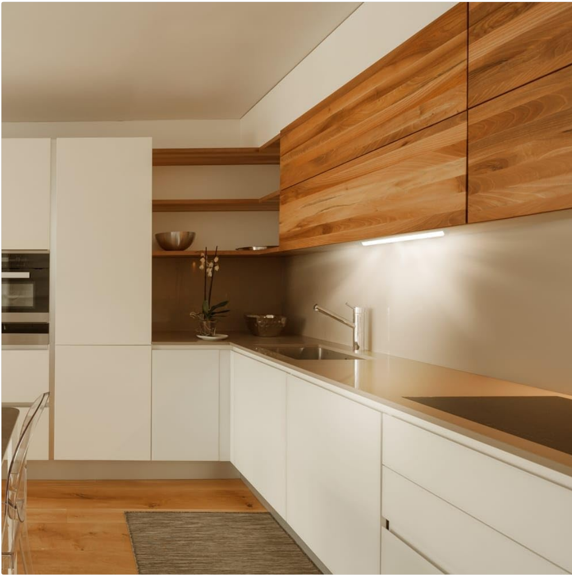
Image: HOFTRONIC LED Batten installed as under-cabinet lighting in a modern kitchen. This illustrates a typical application for the product.