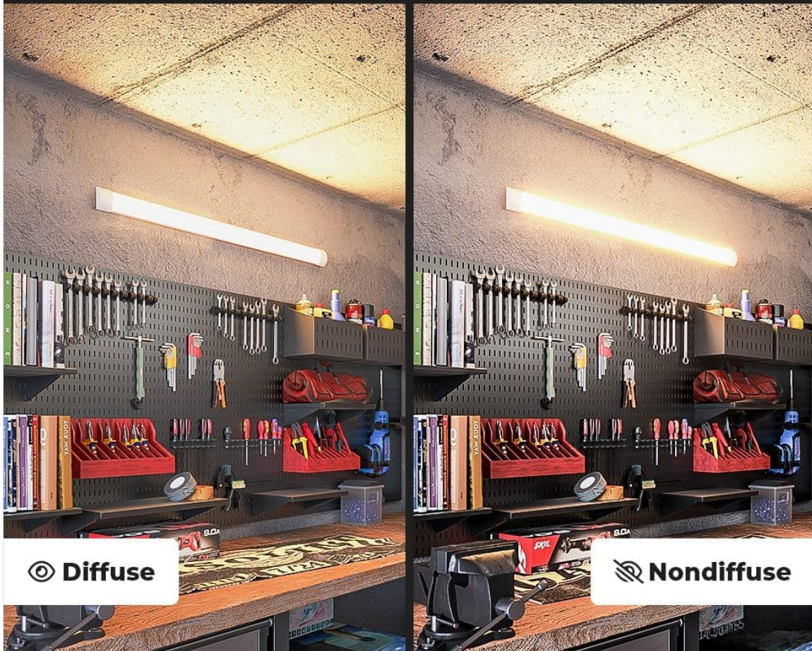
Image: A side-by-side comparison demonstrating the benefit of diffuse light. The left side shows diffuse lighting, which greatly reduces eye strain, while the right side shows non-diffuse lighting, highlighting the difference in visual comfort.