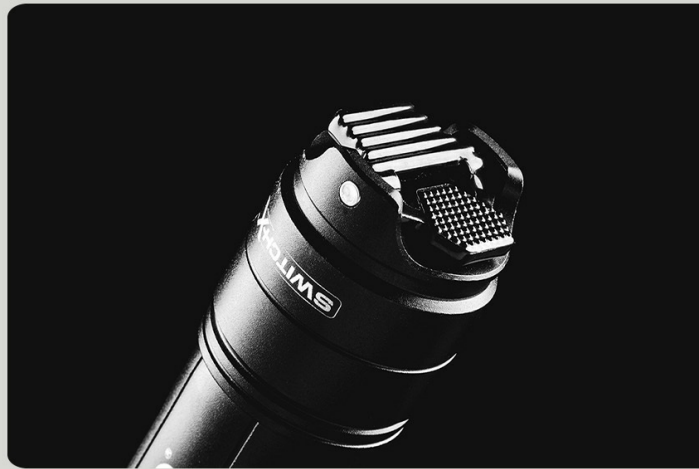
Image 3.1: Detail of the Switch-X paddle mechanism for intuitive control.

Uses patented paddle switching mechanism to operate the power.