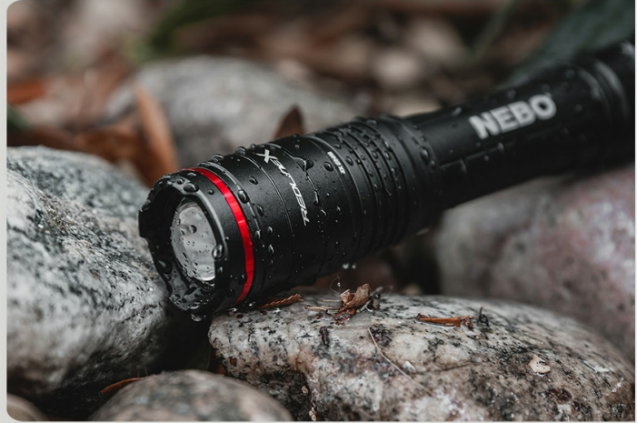
Image 3.3: The 4X zoom capability allows adjustment from a wide floodlight to a focused spotlight.

Protected from immersion in 1 meter of water for up to 30 minutes.