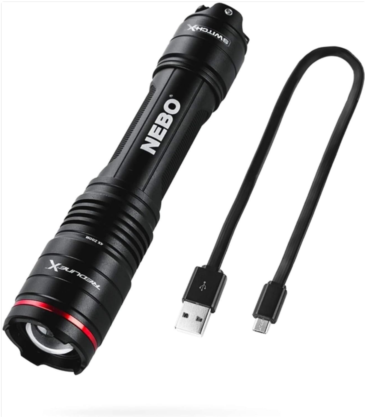
Image 1.1: The NEBO REDLINE X flashlight shown with its included Micro-USB charging cable.