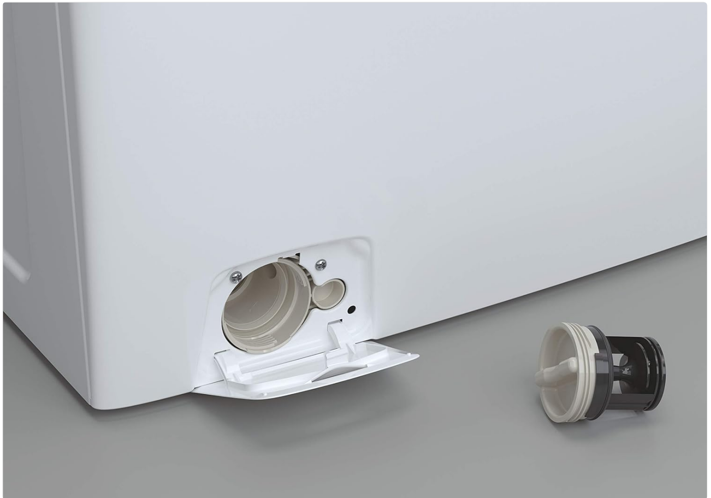
Figure 3: The drain filter compartment, located at the bottom front of the appliance, with the filter removed for cleaning.

The appliance has a filter located at the bottom front. It is recommended to clean this filter regularly to remove lint and small objects, especially after drying cycles. Lint can accumulate in the rubber seal of the door during drying, which should also be cleaned manually.