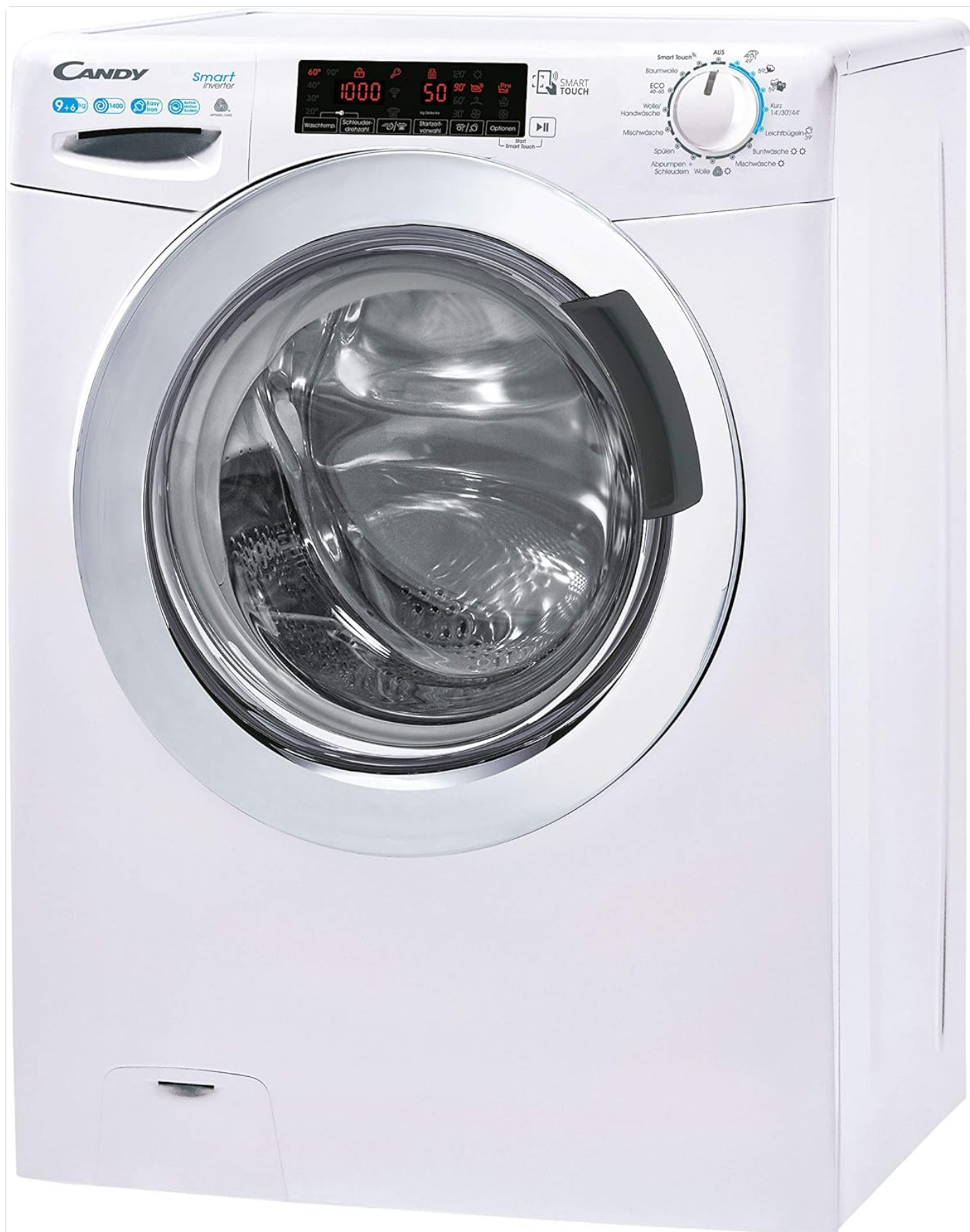
Figure 2: Angled view of the washer dryer, highlighting its compact design and front-loading door.