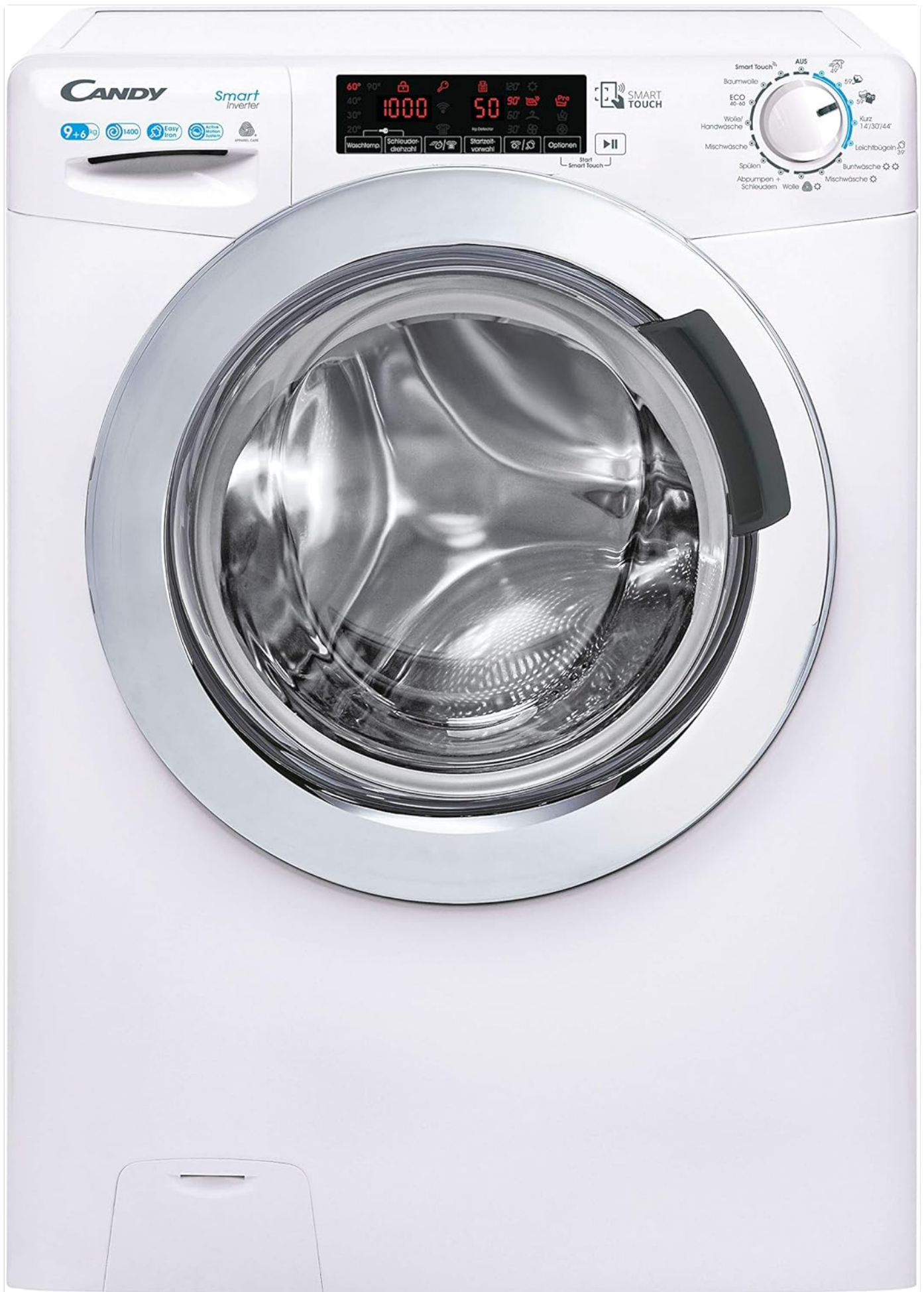
Figure 1: Front view of the Candy Smart CSWSQ496TWMCE-84 Washer Dryer, showing the control panel, detergent drawer, and large chrome-finished door.