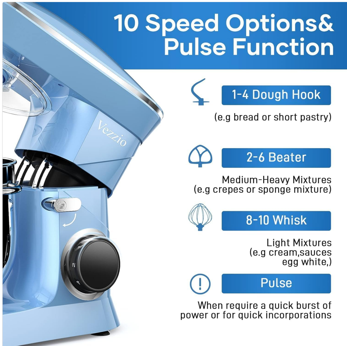
Figure 4: Detailed guide for 10 speed options and pulse function with corresponding attachments and uses.