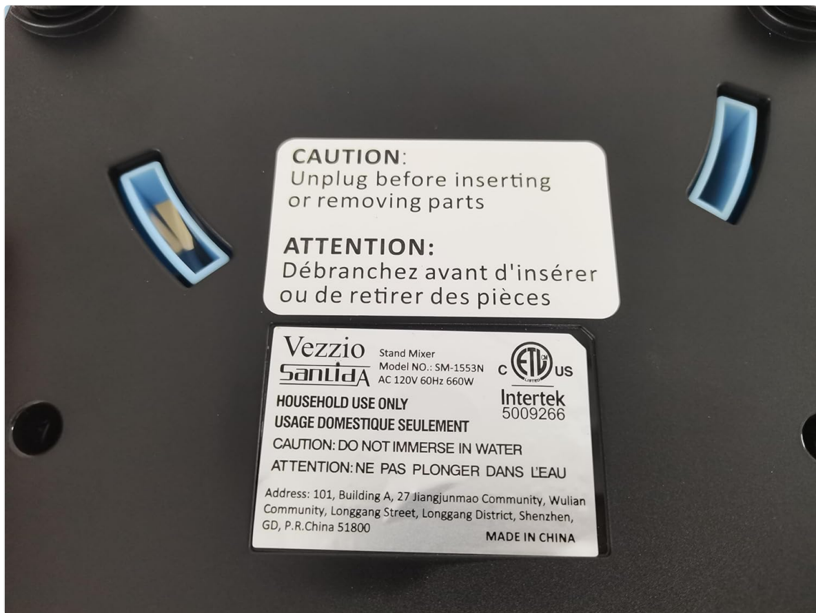
Figure 6: Bottom label of the mixer showing model number, electrical specifications, and caution notices.