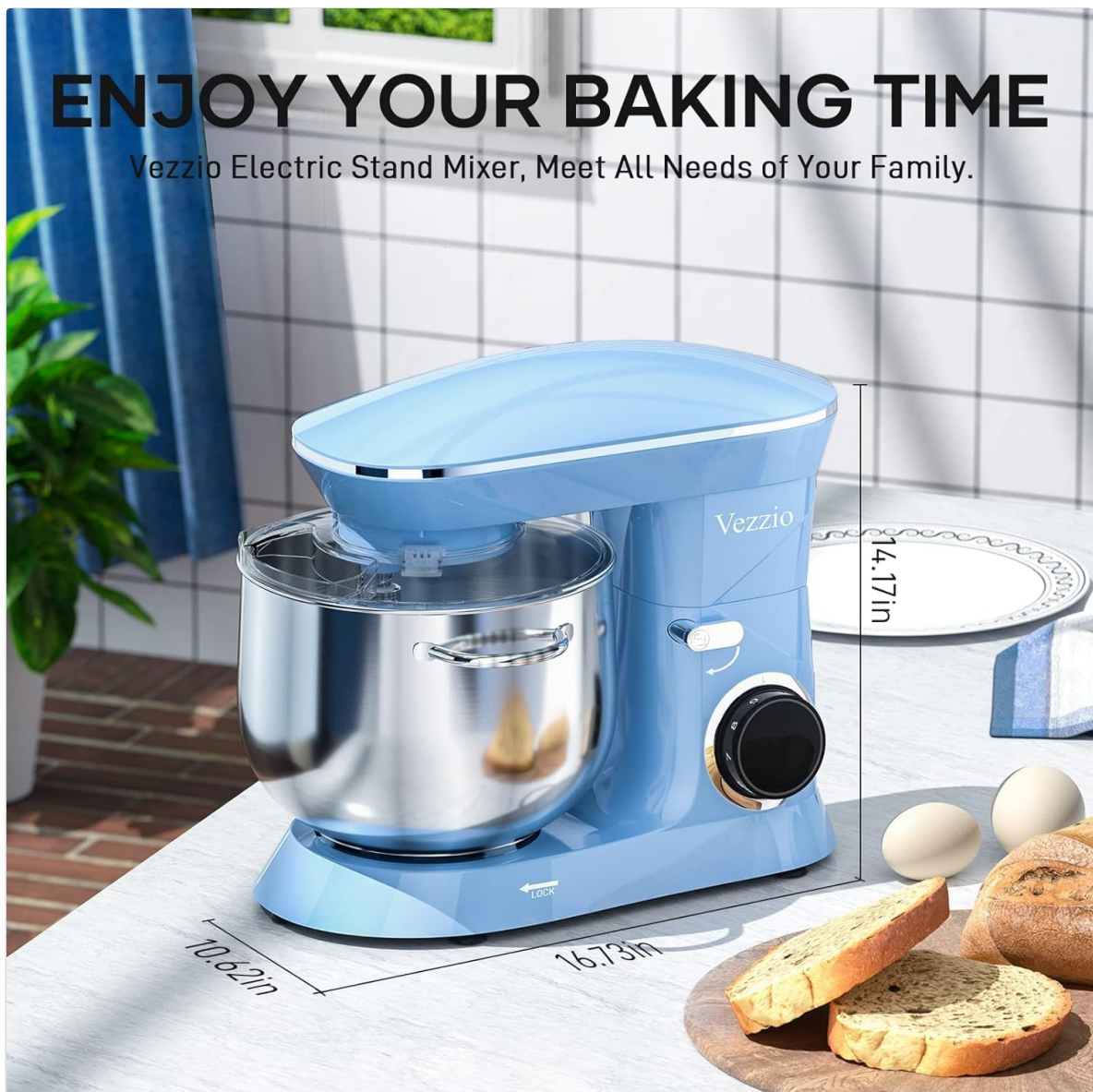
Figure 5: Product dimensions of the Vezzio Electric Stand Mixer.