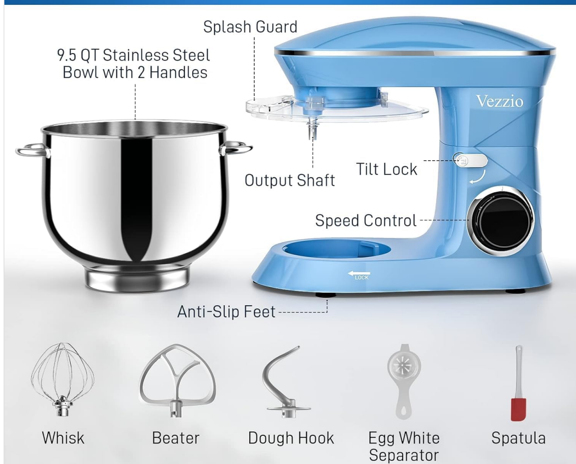
Figure 1: Overview of Vezzio Stand Mixer Components including the 9.5 QT Stainless Steel Bowl, Splash Guard, Output Shaft, Tilt Lock, Speed Control, Anti-Slip Feet, Whisk, Beater, Dough Hook, Egg White Separator, and Spatula.