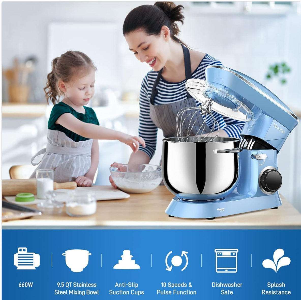
Figure 2: Visual summary of key features including 660W motor, 9.5 QT Stainless Steel Bowl, Anti-Slip Suction Cups, 10 Speeds & Pulse Function, Dishwasher-Safe, and Splash Resistance.