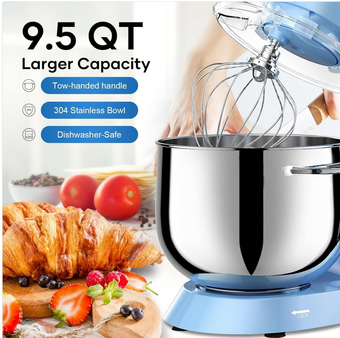
Figure 3: The 9.5 Quart Stainless Steel Bowl with two handles, ready for attachment.