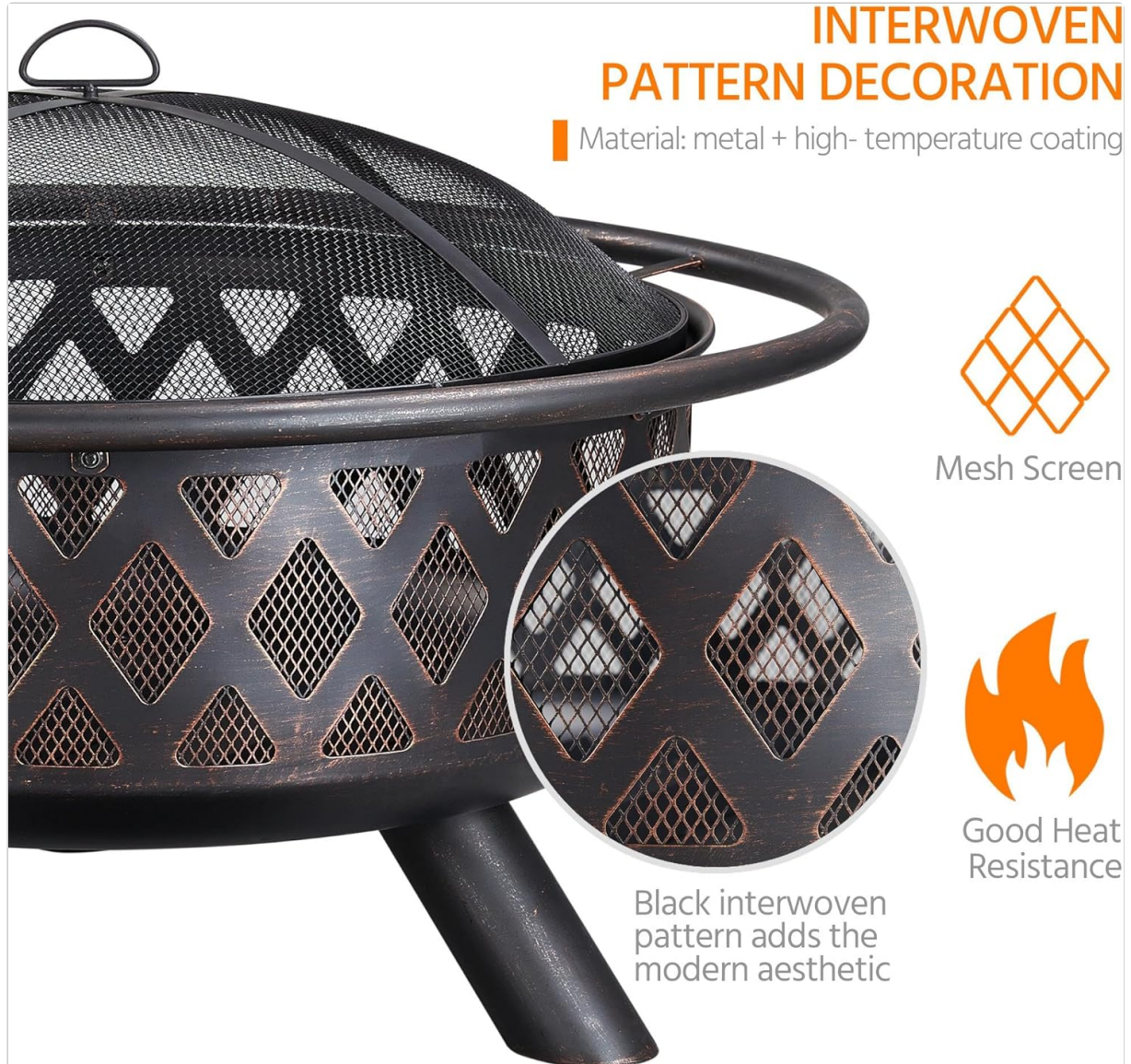
Image: A detailed view of the fire pit's interwoven pattern decoration and mesh screen, emphasizing the metal construction with high-temperature coating for durability and heat resistance.