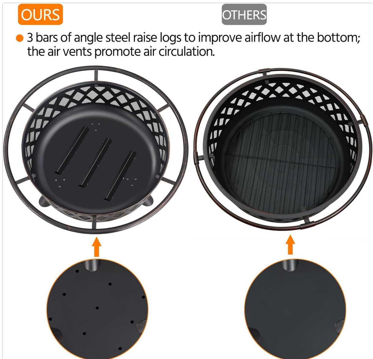
Image: A comparison showing the Yaheetech fire pit's design with three angle steel bars to raise logs and nine bottom holes for improved airflow and combustion, contrasted with a less ventilated design.