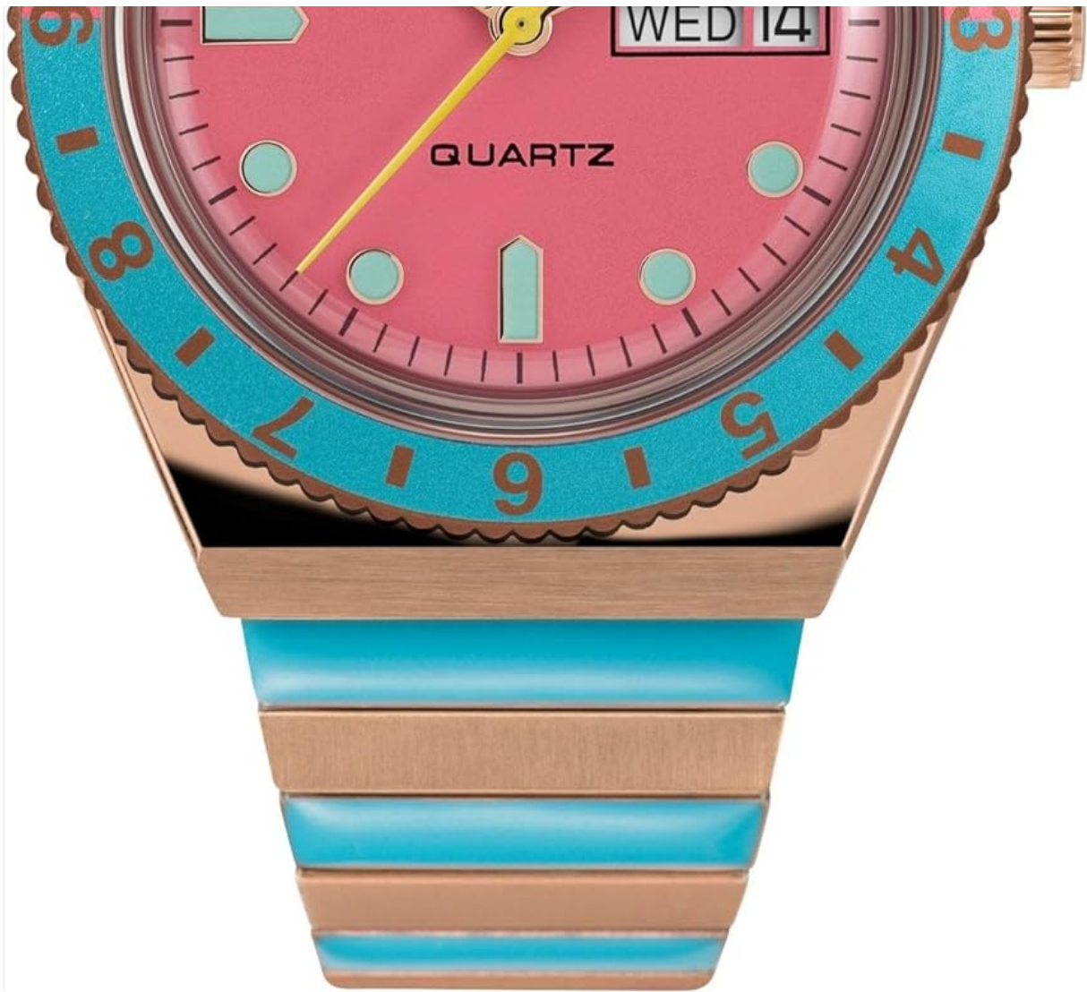
Figure 1: Front view of the Timex Q Malibu Women's 36mm Watch.