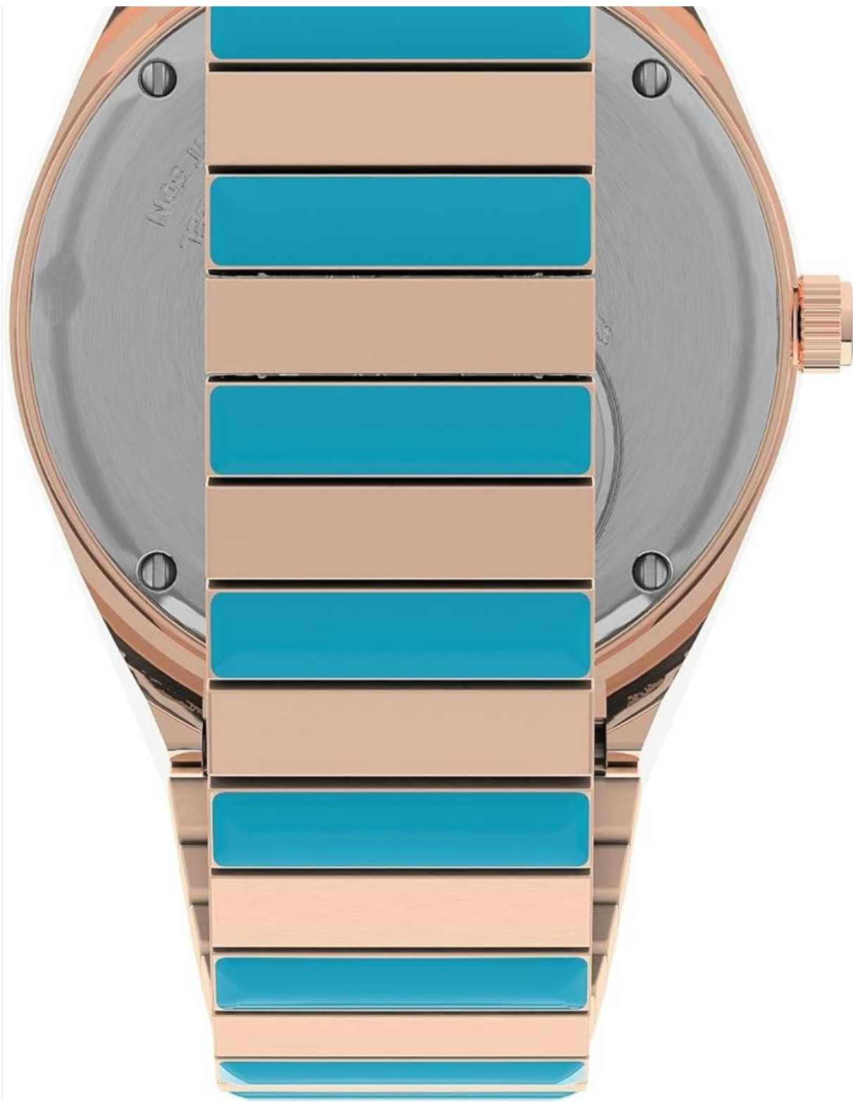
Figure 3: Detail of the watch's expansion band.