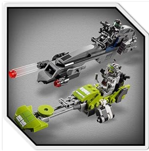
Image: The two buildable speeder bikes, ready for action with their respective minifigures.

Image: The detailed interior of the shuttle's rear cabin, showing space for minifigures and weapons storage.