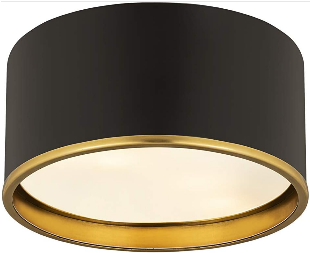
Figure 2: Underside view of the Z-Lite 2 Light Flush Mount, highlighting the matte black finish and rubbed brass accent.