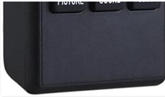
Figure 4.2: Remote control in use, demonstrating ease of operation.