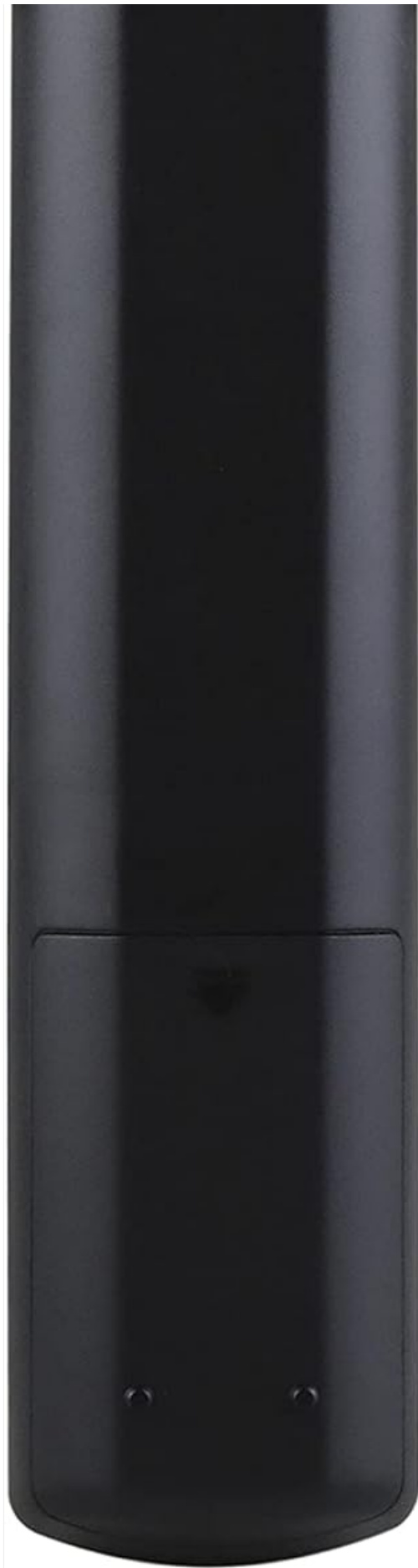
Figure 3.1: Rear view of the remote control, highlighting the battery compartment. This image clearly shows the removable cover for battery insertion.

Once batteries are installed, the remote is ready for immediate use with compatible TV models. No pairing or programming is typically required.