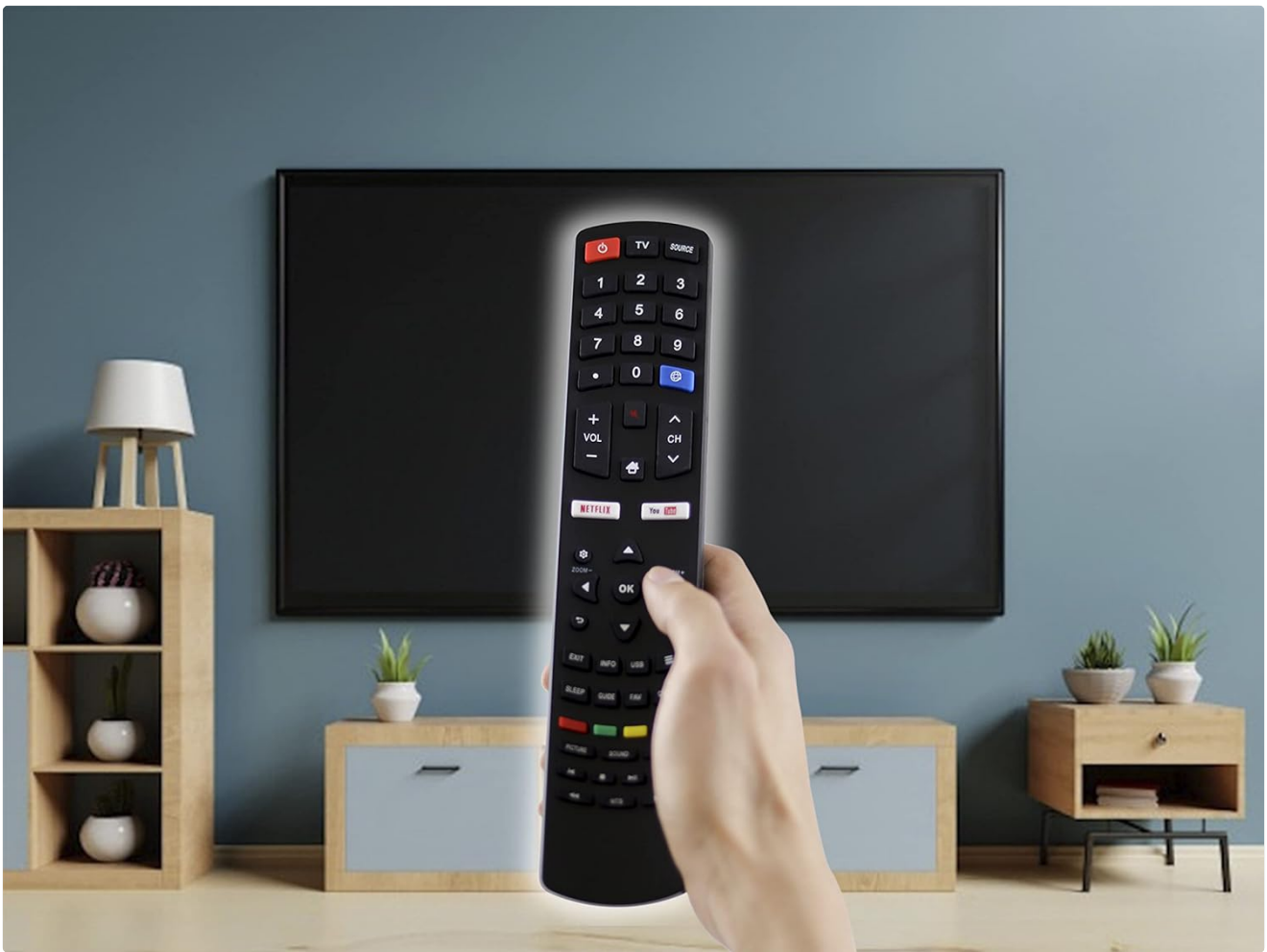
Figure 4.3: A hand holding the USARMT remote control, pointing towards a television screen. This illustrates the typical usage scenario of the remote.