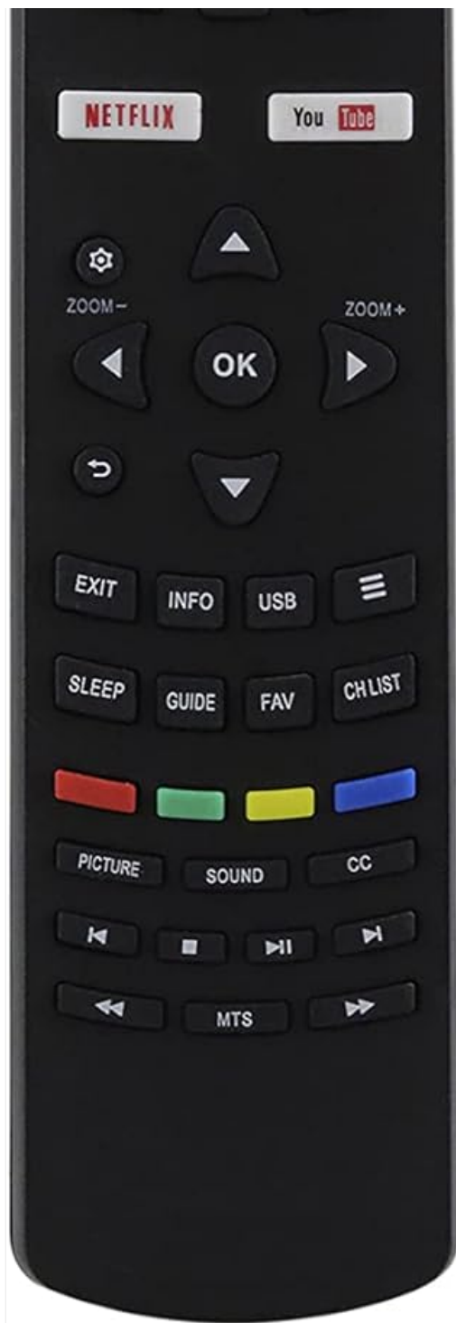
Figure 1.1: Front view of the USARMT Universal Remote Control. This image displays the full layout of the remote, including all buttons for power, channel, volume, navigation, and dedicated app buttons like Netflix and YouTube.