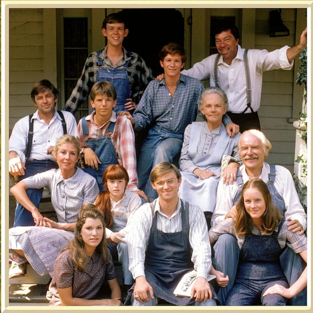
Image: Front view of The Waltons: The Complete Series DVD packaging. The image displays the main cast members of the show, including John-Boy, John, Olivia, Grandpa, Grandma, and the other Walton children, posed together on a porch. The title 'The Waltons' is prominently displayed at the top.