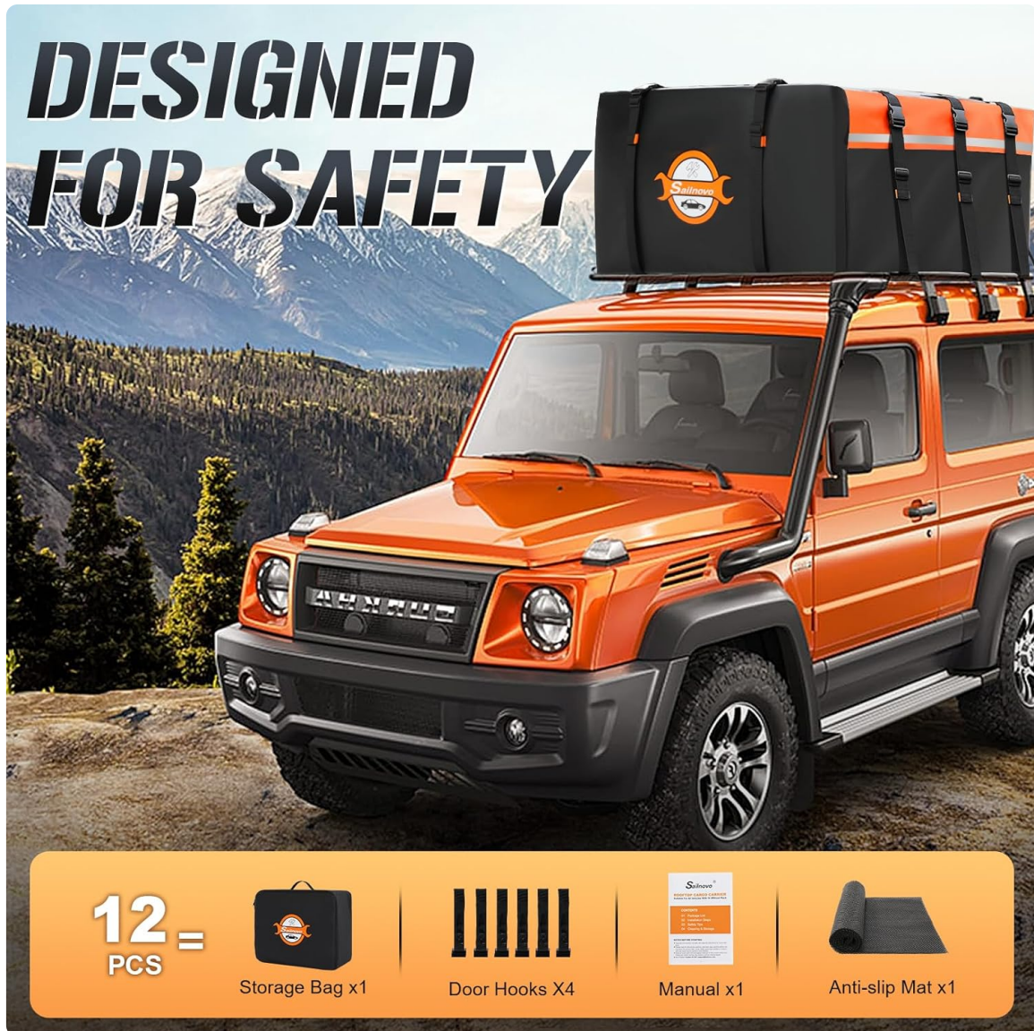
Figure 2: Visual representation of included accessories.