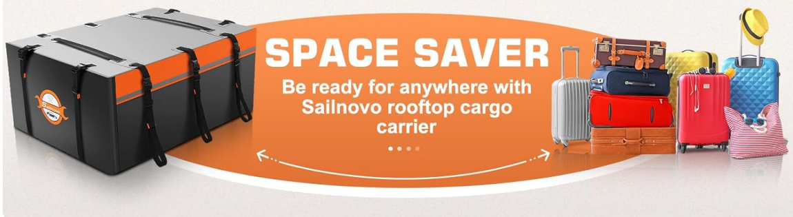
Figure 7: Demonstrating how the cargo carrier helps save space inside the vehicle.