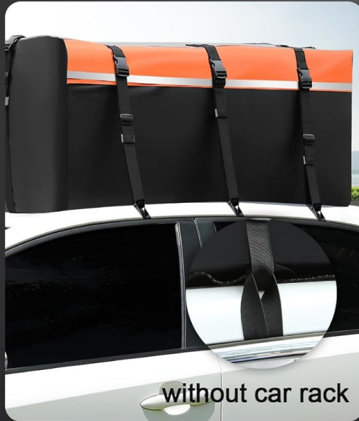
without car rack