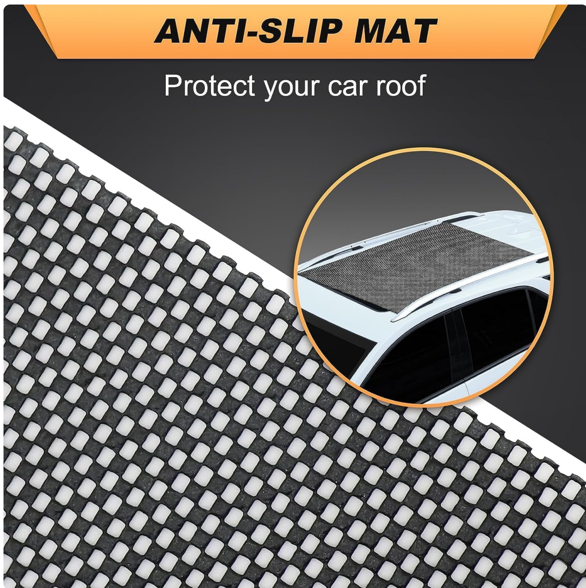
Figure 3: Anti-slip mat placement on the vehicle roof.

Place the anti-slip mat on your vehicle's roof where the cargo carrier will sit. This mat helps prevent the carrier from shifting and protects your car's paint.