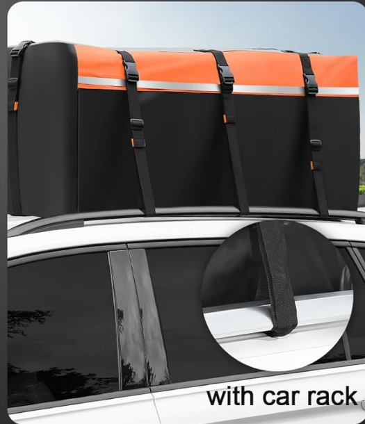
with car rack