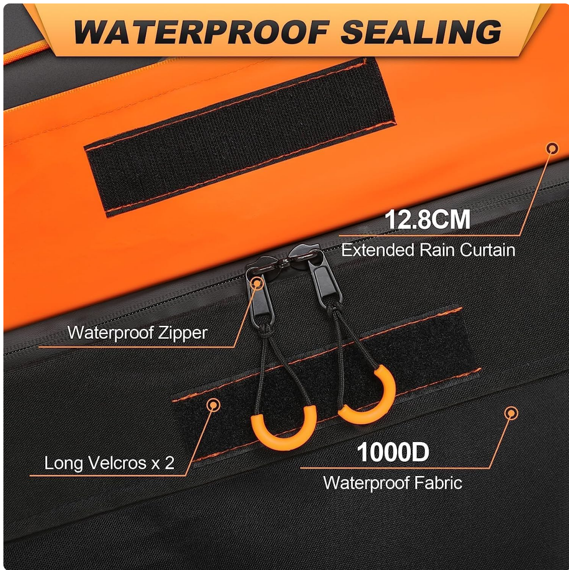
Figure 4: Detail of the waterproof zipper and protective Velcro flaps.