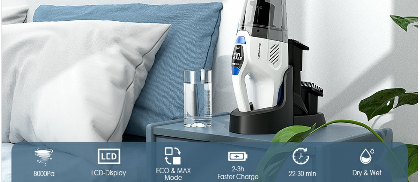
Figure 9: The versatile handheld vacuum used for cleaning in different environments.

Your browser does not support the video tag.