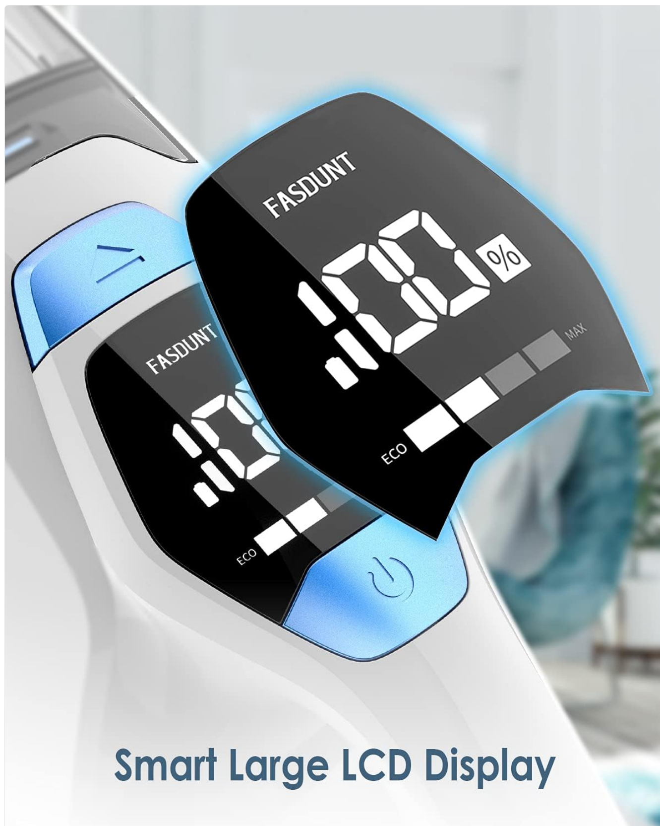
Figure 7: Place the vacuum on the charging base for initial charging.

Before first use, fully charge the vacuum. Place the handheld vacuum onto the charging base. The LCD display will show the battery percentage increasing as it charges. A full charge typically takes 2-3 hours.