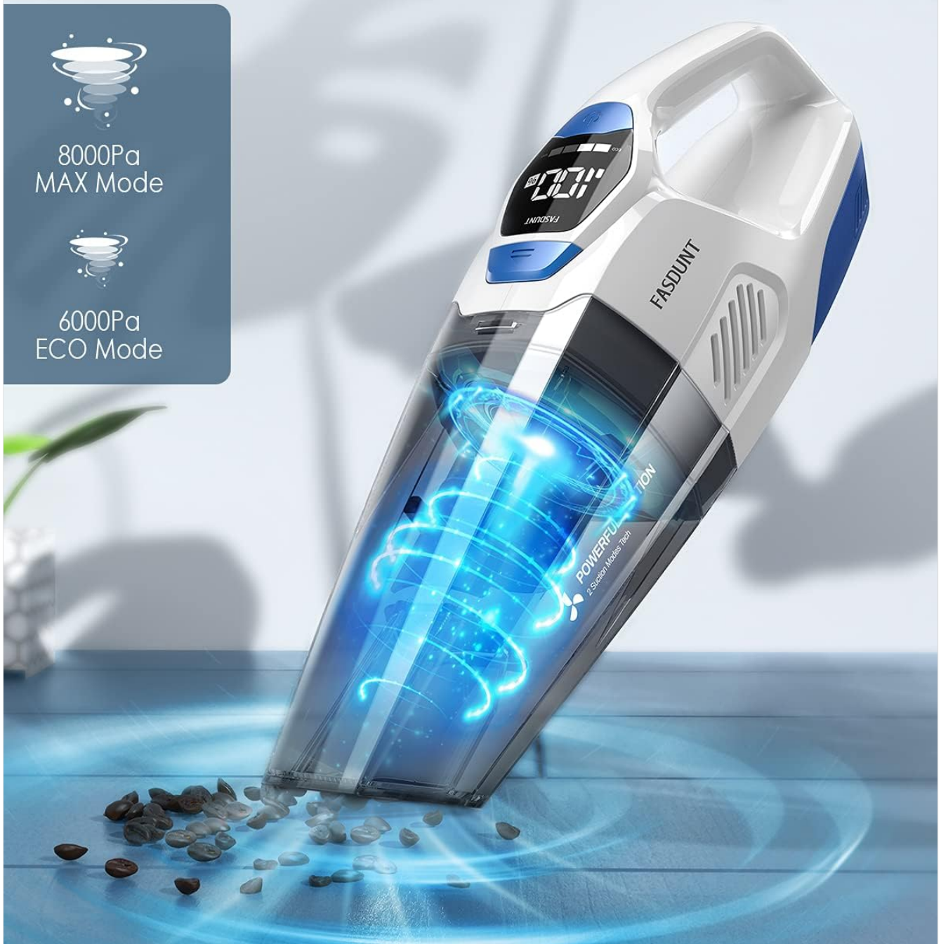
Figure 2: The vacuum in action, showcasing its powerful suction in both ECO and MAX modes.