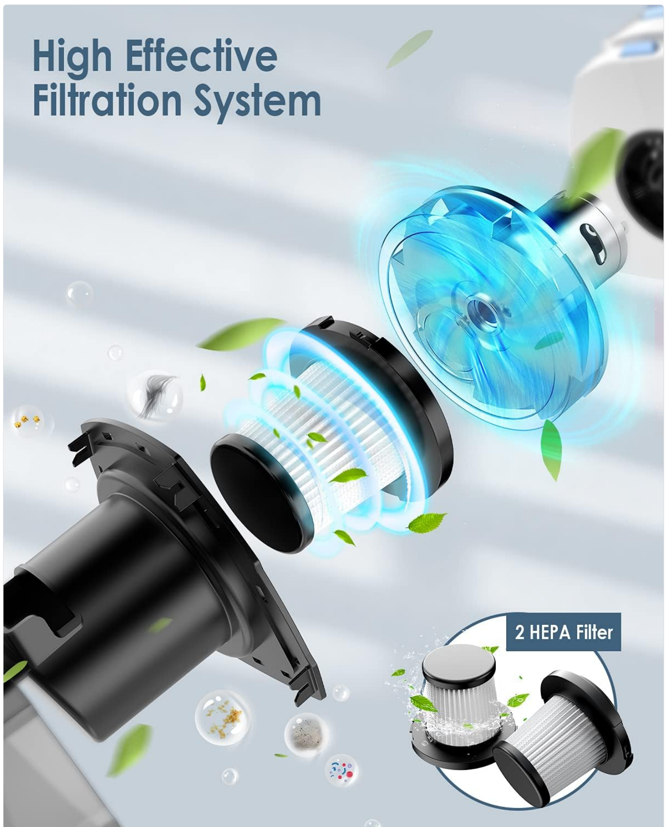
Figure 3: Exploded view of the vacuum's multi-layer filtration system, highlighting the HEPA filters.