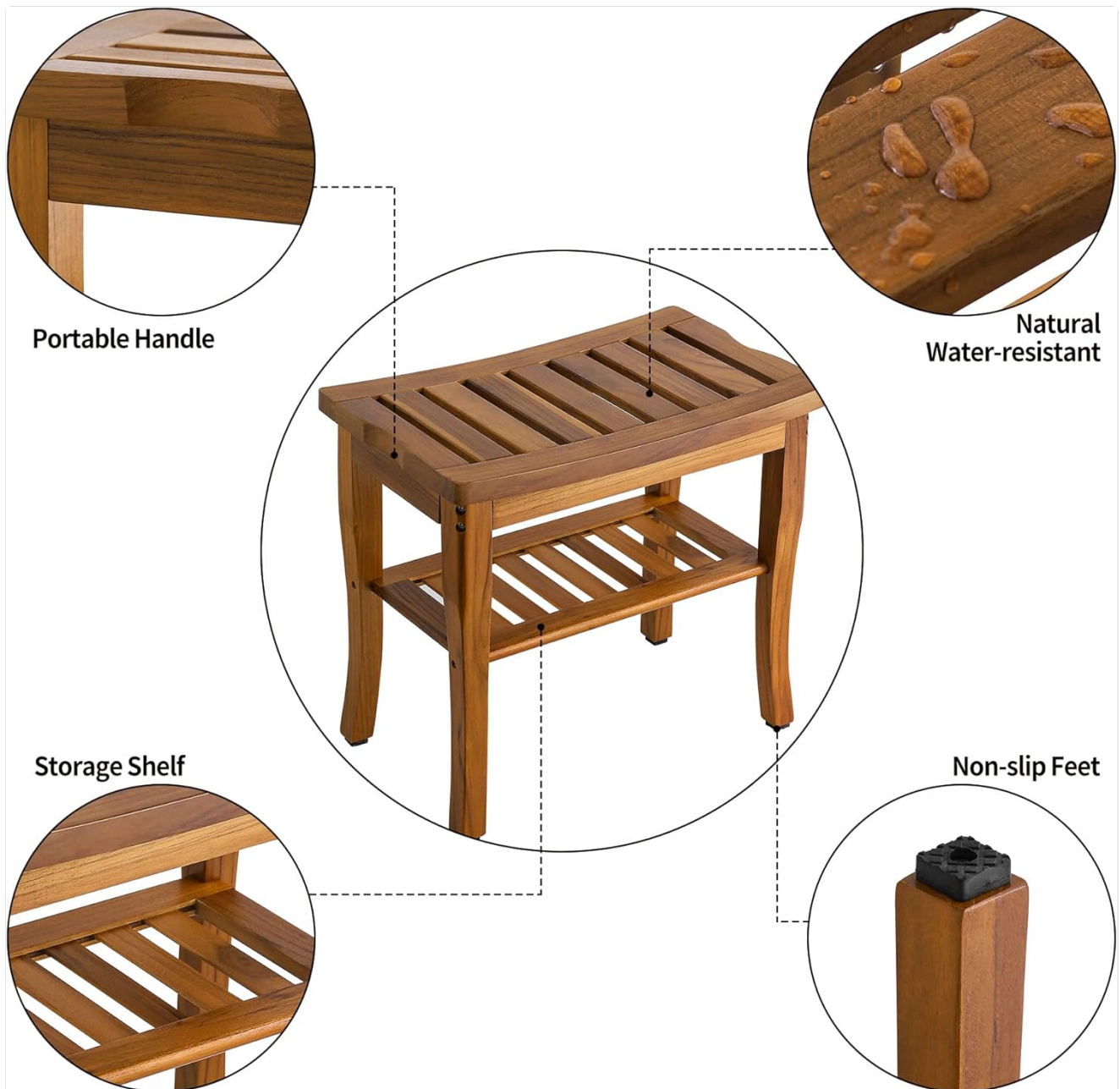
Detailed view of key features: the integrated portable handle, the natural water-resistant properties of teak wood, the convenient storage shelf, and the non-slip feet for stability.