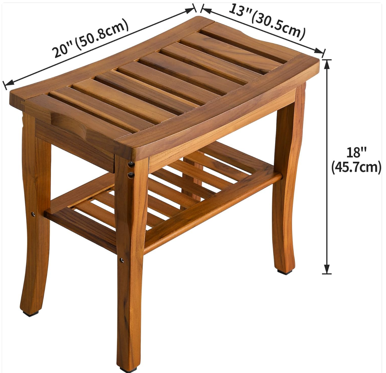
Dimensional overview of the VaeFae Teak Shower Bench.