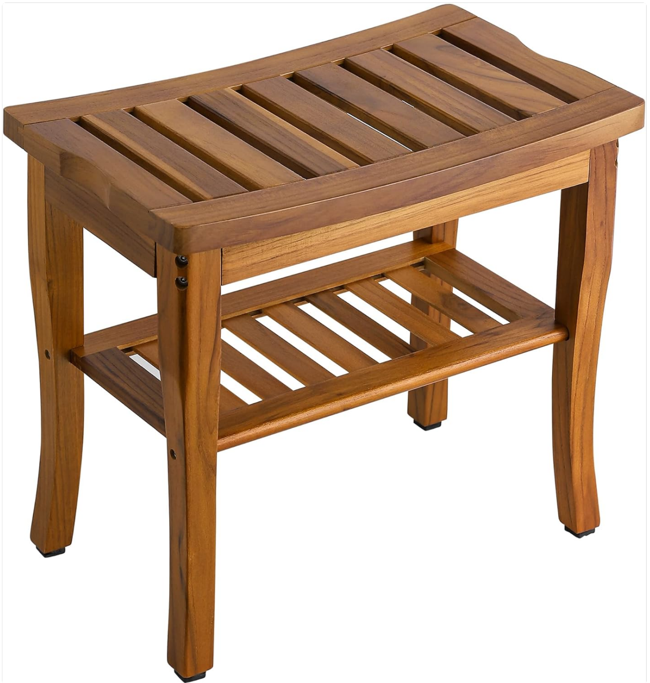
The VaeFae Teak Shower Bench, showcasing its natural teak wood finish and slatted design.