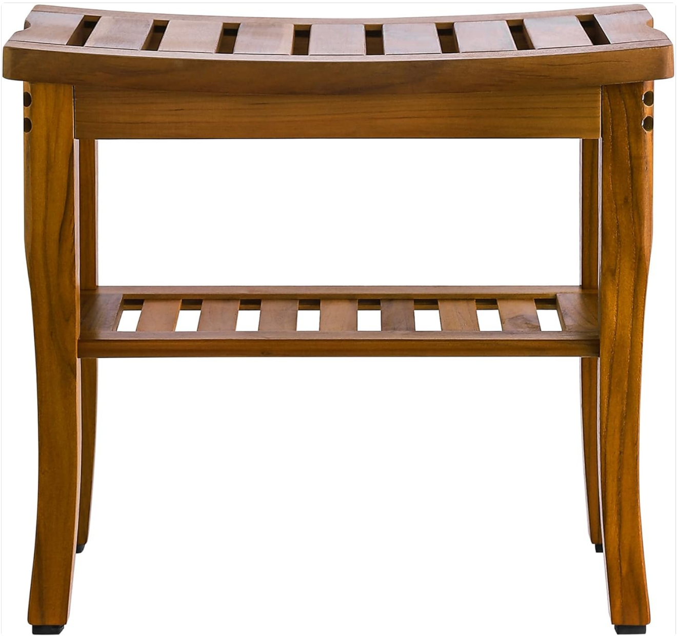
The fully assembled VaeFae Teak Shower Bench, ready for use.