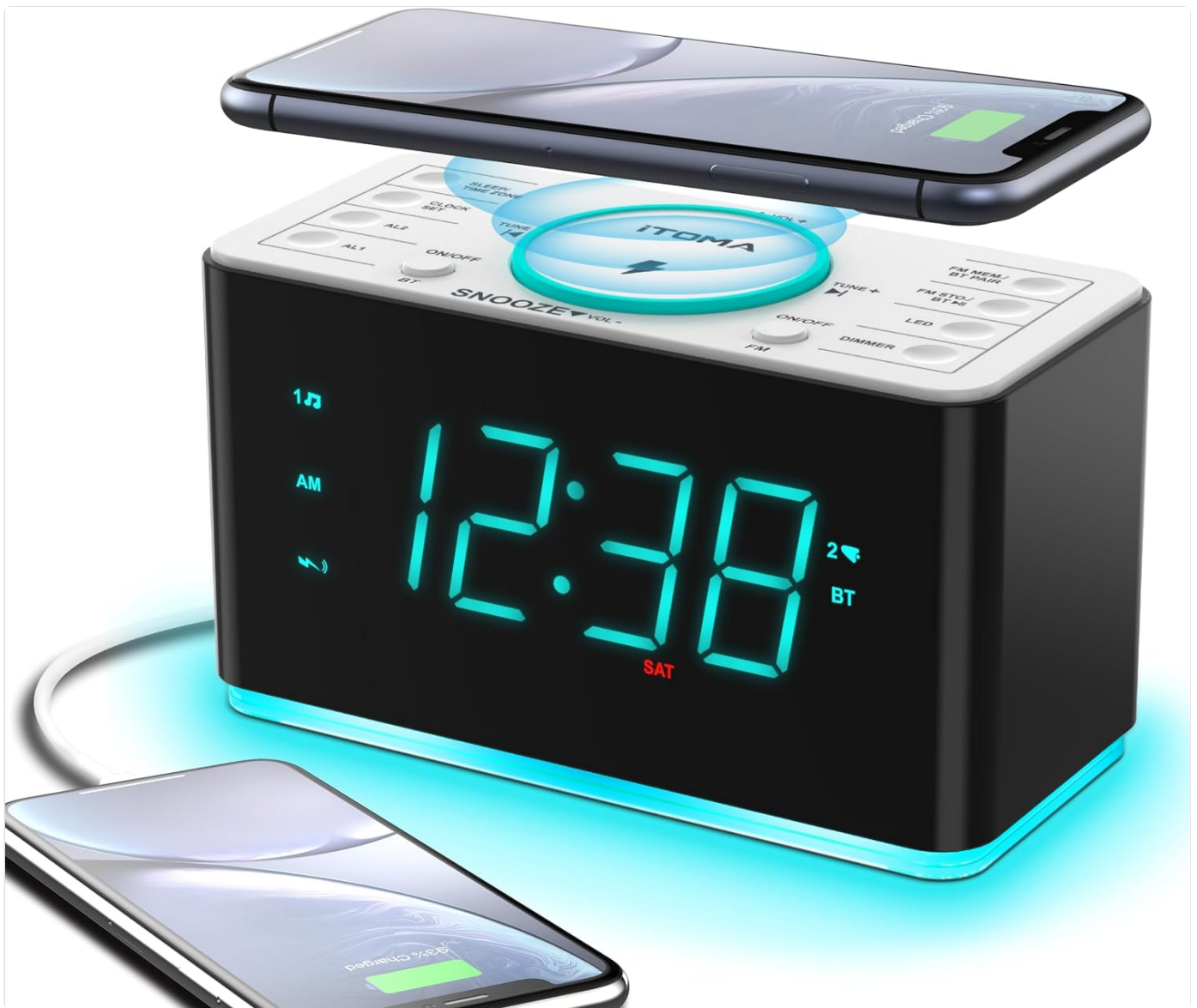
Figure 1: Front view of the iTOMA CKS207 alarm clock, showcasing its large digital display, wireless charging pad, and a smartphone charging via USB port.