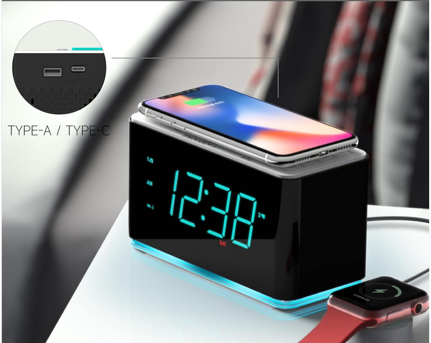
Figure 4: The alarm clock offers multiple charging options, including wireless charging on top and wired charging via USB-A and USB-C ports.