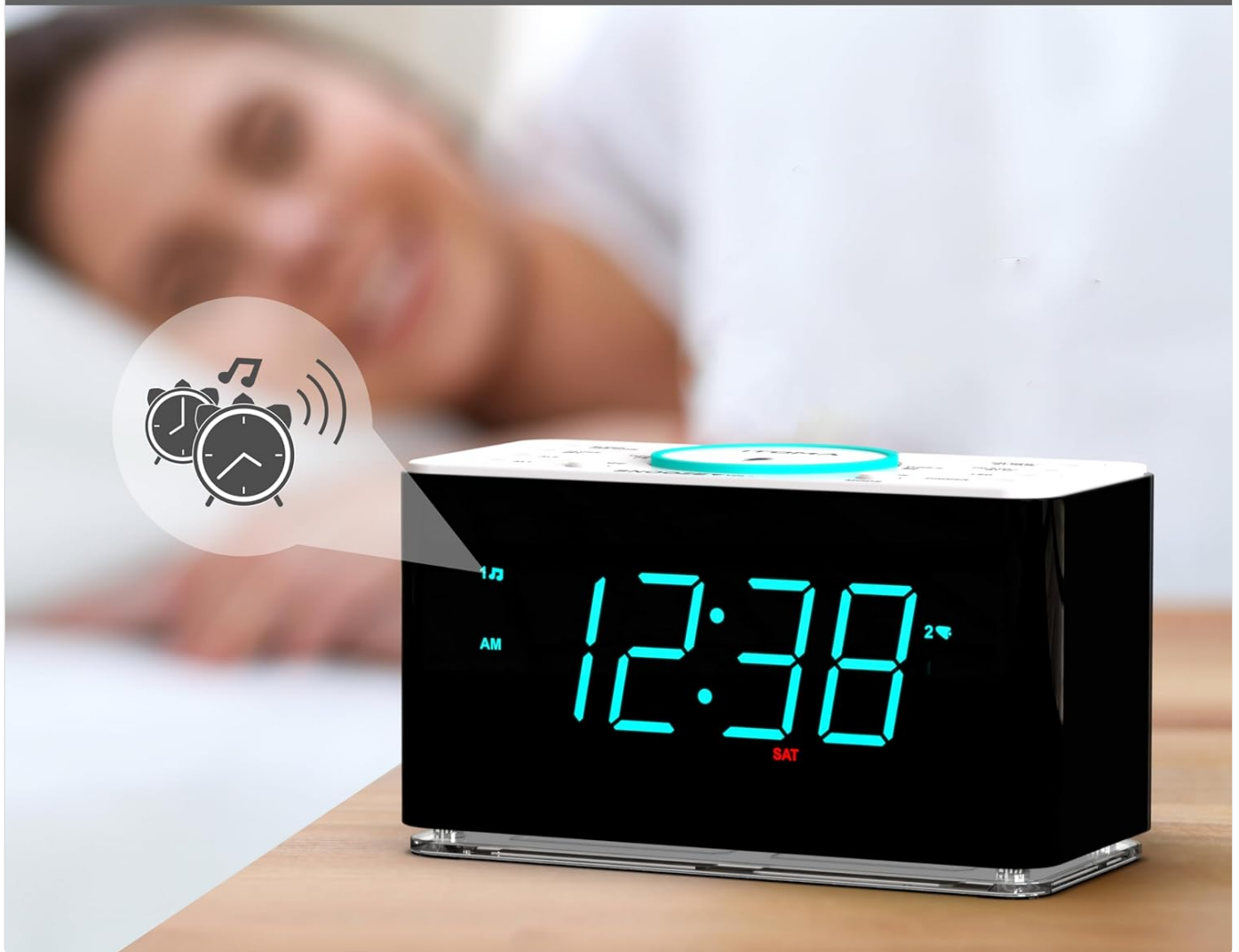
Figure 3: The alarm clock display indicating active dual alarms, ready to wake you up.