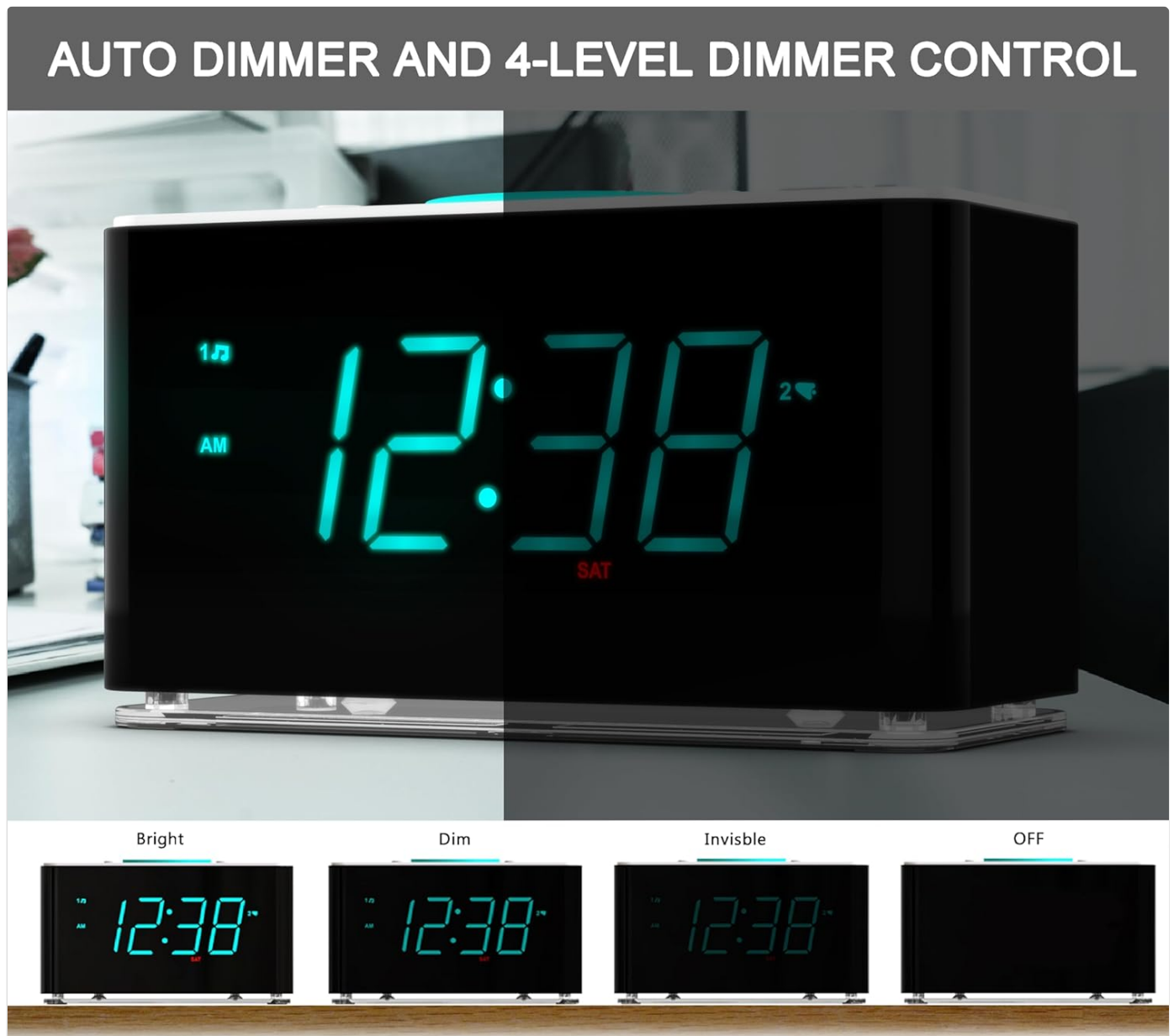
Figure 6: Visual representation of the 4-level dimmer control, from bright to completely off, allowing for comfortable viewing in any light condition.