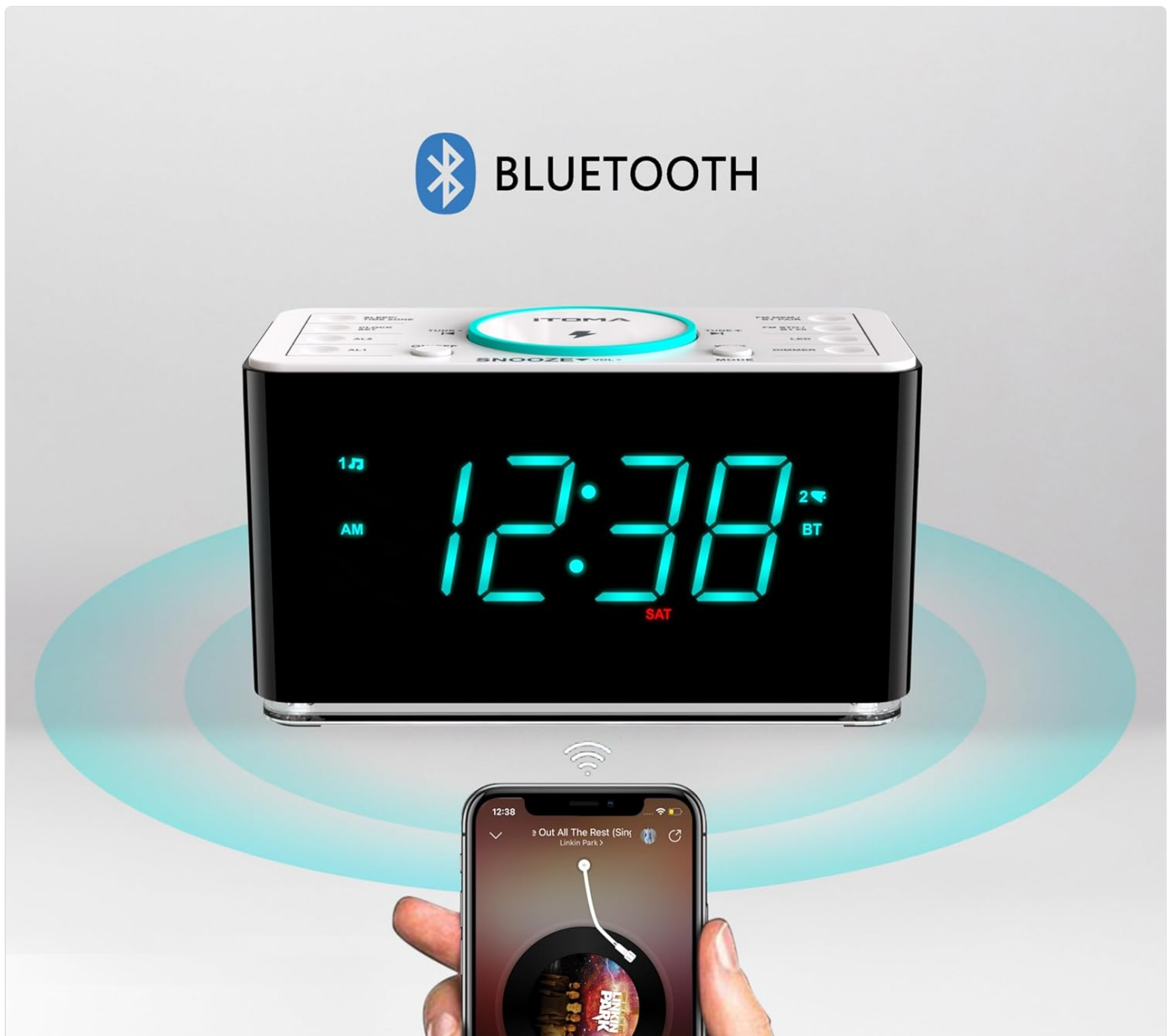
Figure 5: The alarm clock connected via Bluetooth to a smartphone, ready for audio playback.