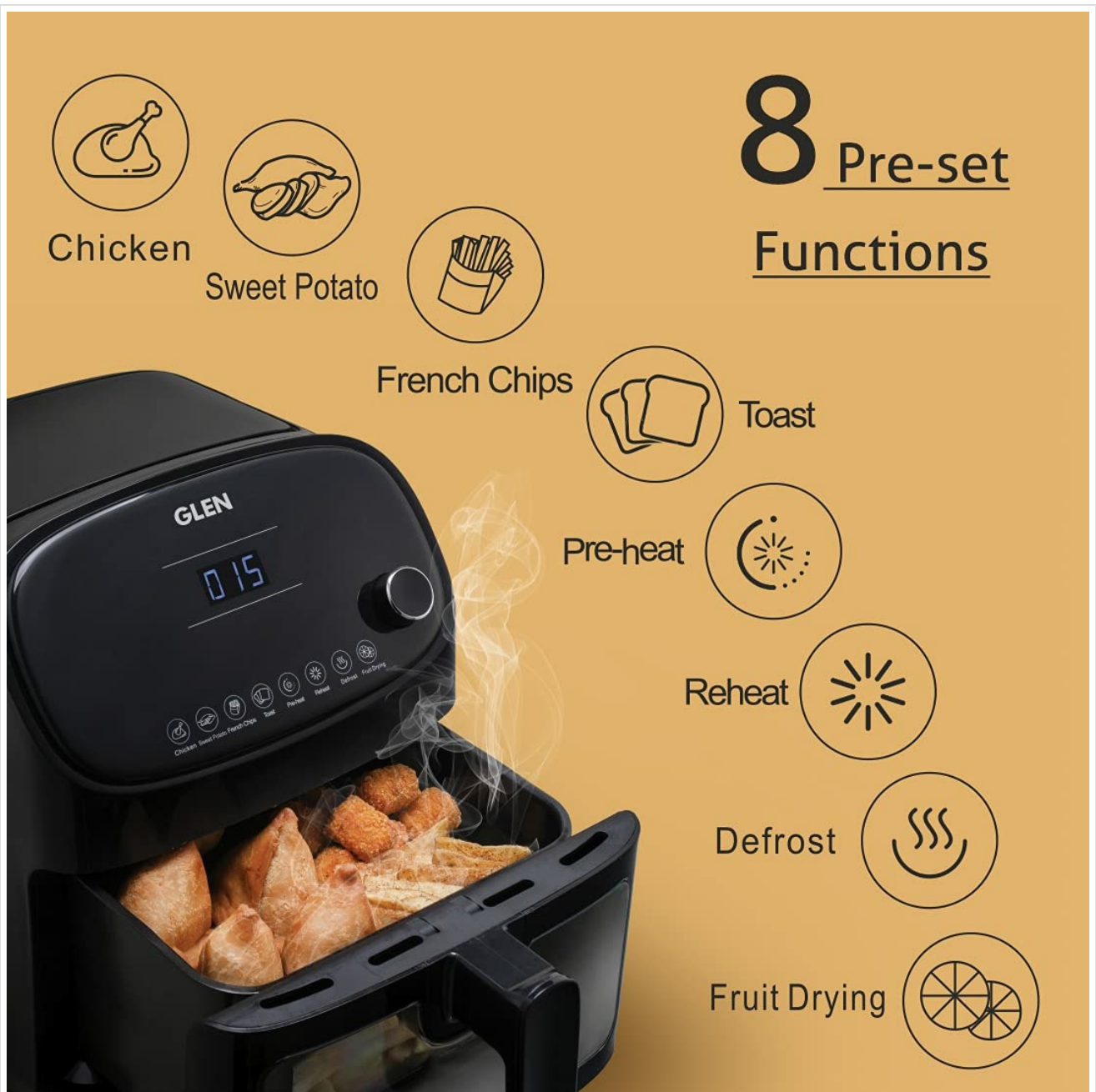
Figure 2.3: Overview of 8 Pre-set Functions. This graphic details the eight convenient pre-programmed cooking modes available on the air fryer, designed for various food types and cooking needs.