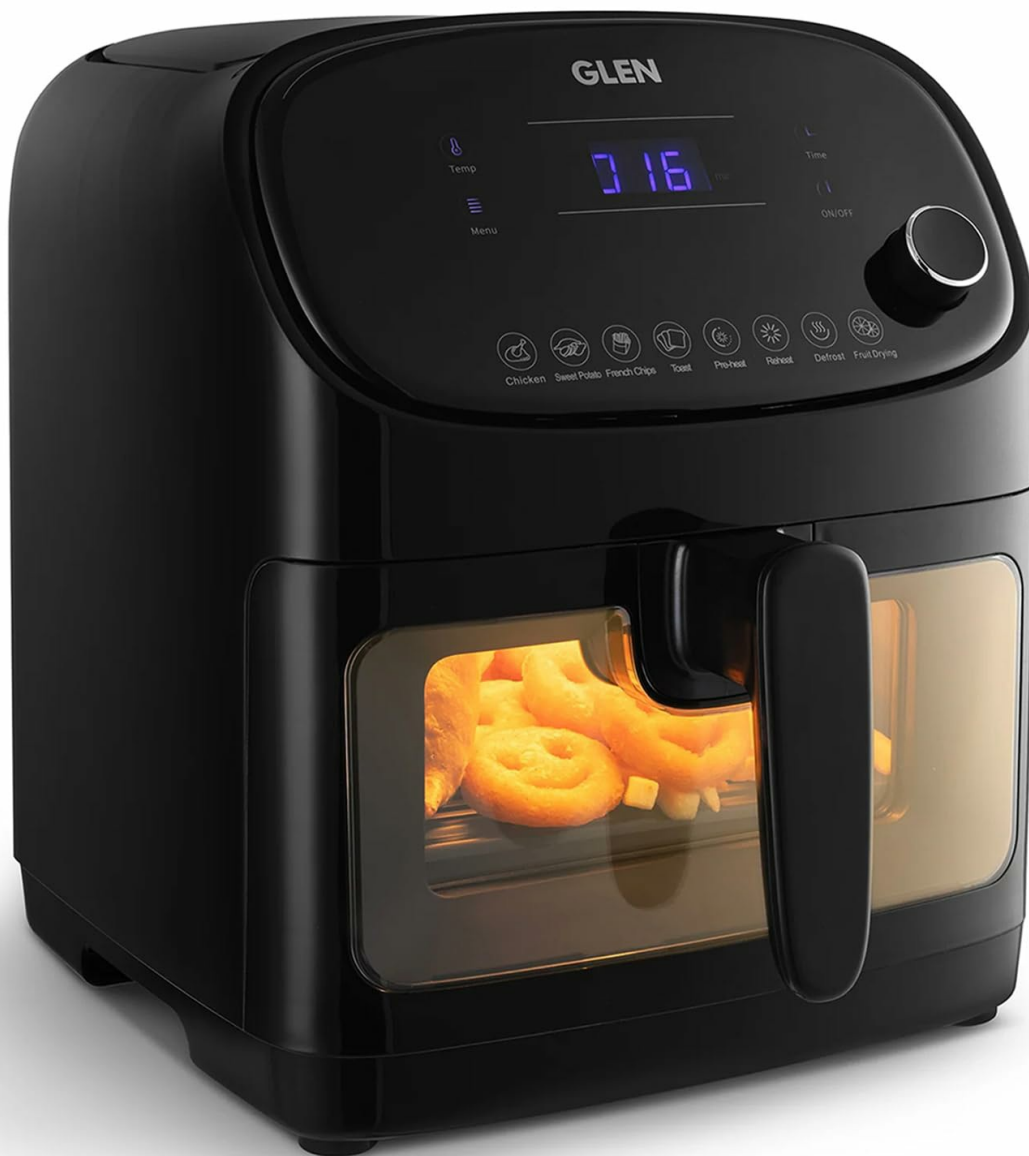
Figure 2.1: Glen Digital Air Fryer in operation. This image shows the air fryer from a front-angled perspective, highlighting its sleek black design, the digital control panel, and the transparent viewing window through which food can be observed during cooking.