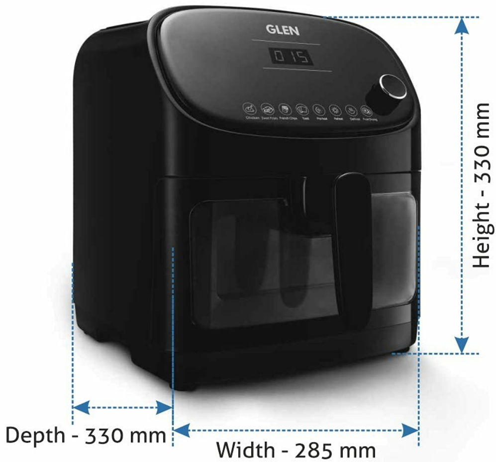
Figure 2.4: Product Dimensions. This image provides a visual representation of the air fryer's physical dimensions, indicating its width, depth, and height in millimeters.