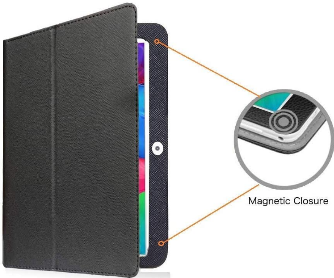
Figure 2: Magnetic closure and precise cutouts for tablet access.

Align well with your tablet's features and allow smooth operation without removing the case.