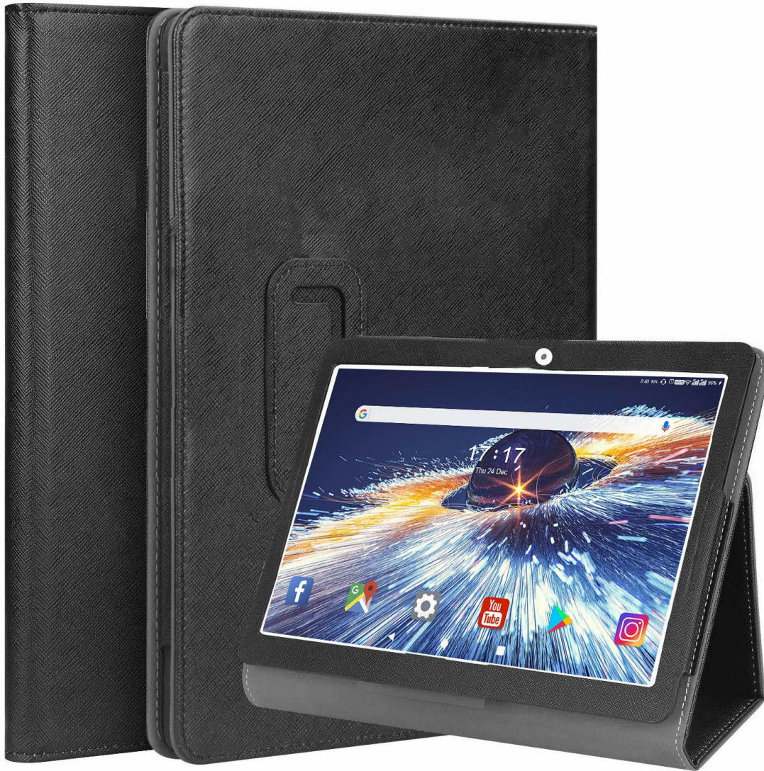
Figure 1: FEONAL 10 inch Tablet Case with tablet in stand position.