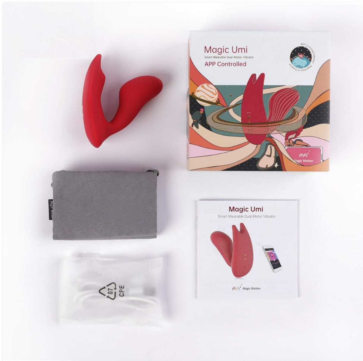
Image 2.1: The Magic Motion Umi device, its packaging, charging cable, and storage pouch.