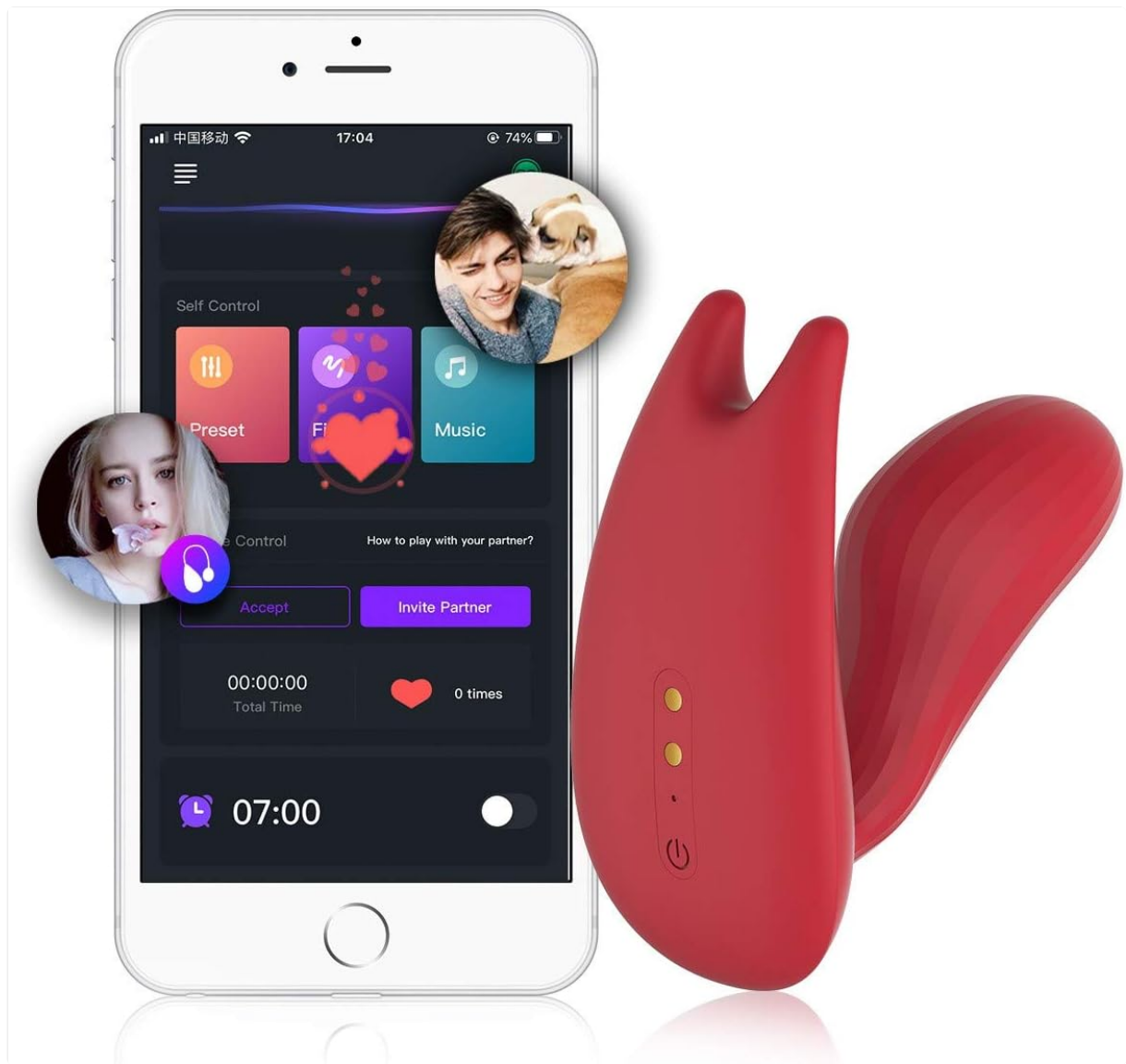
Image 1.1: The Magic Motion Umi device shown alongside a smartphone displaying its control application.