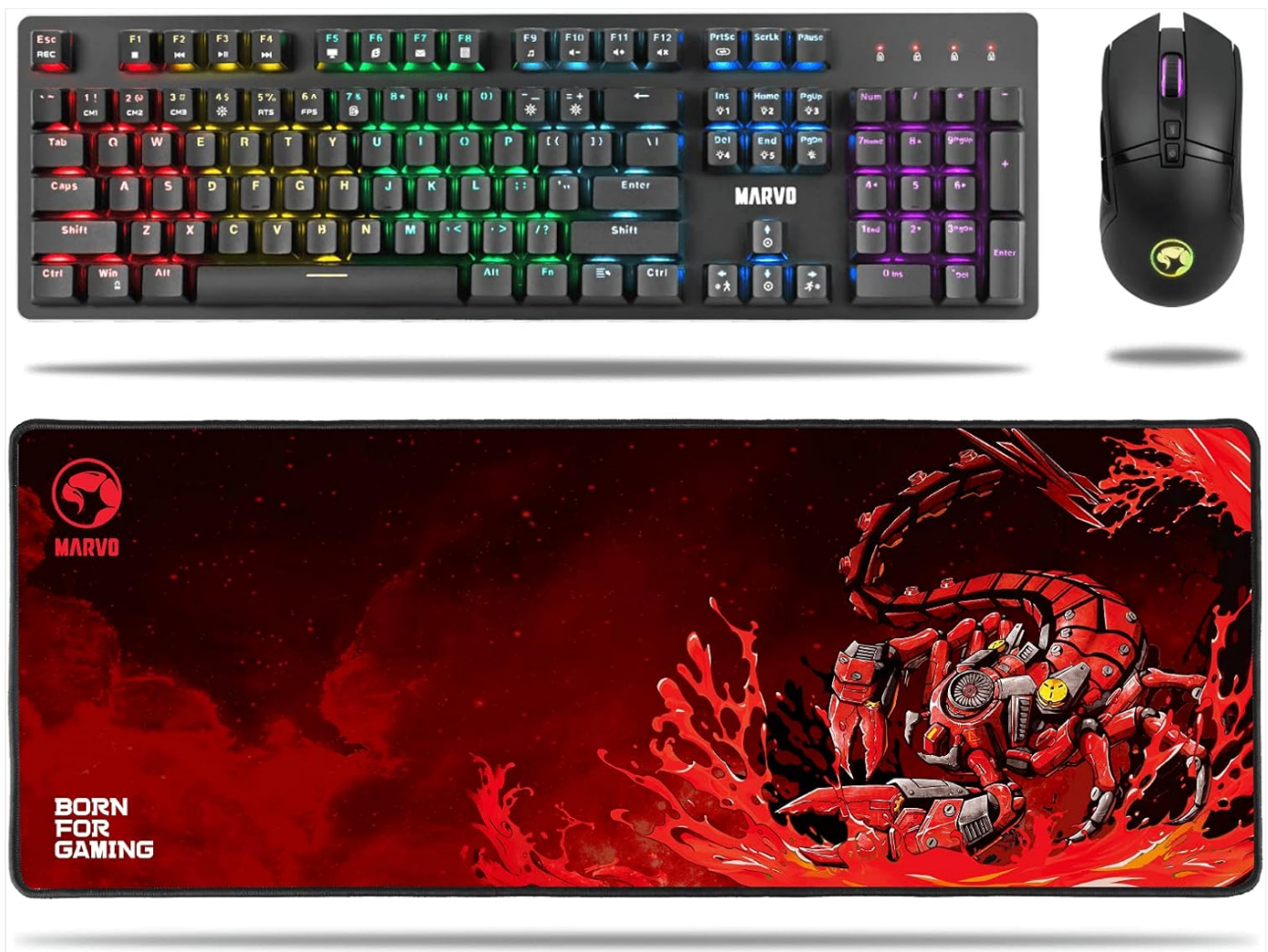
Image: The MARVO CM372 combo, featuring the mechanical keyboard, gaming mouse, and large mouse pad.