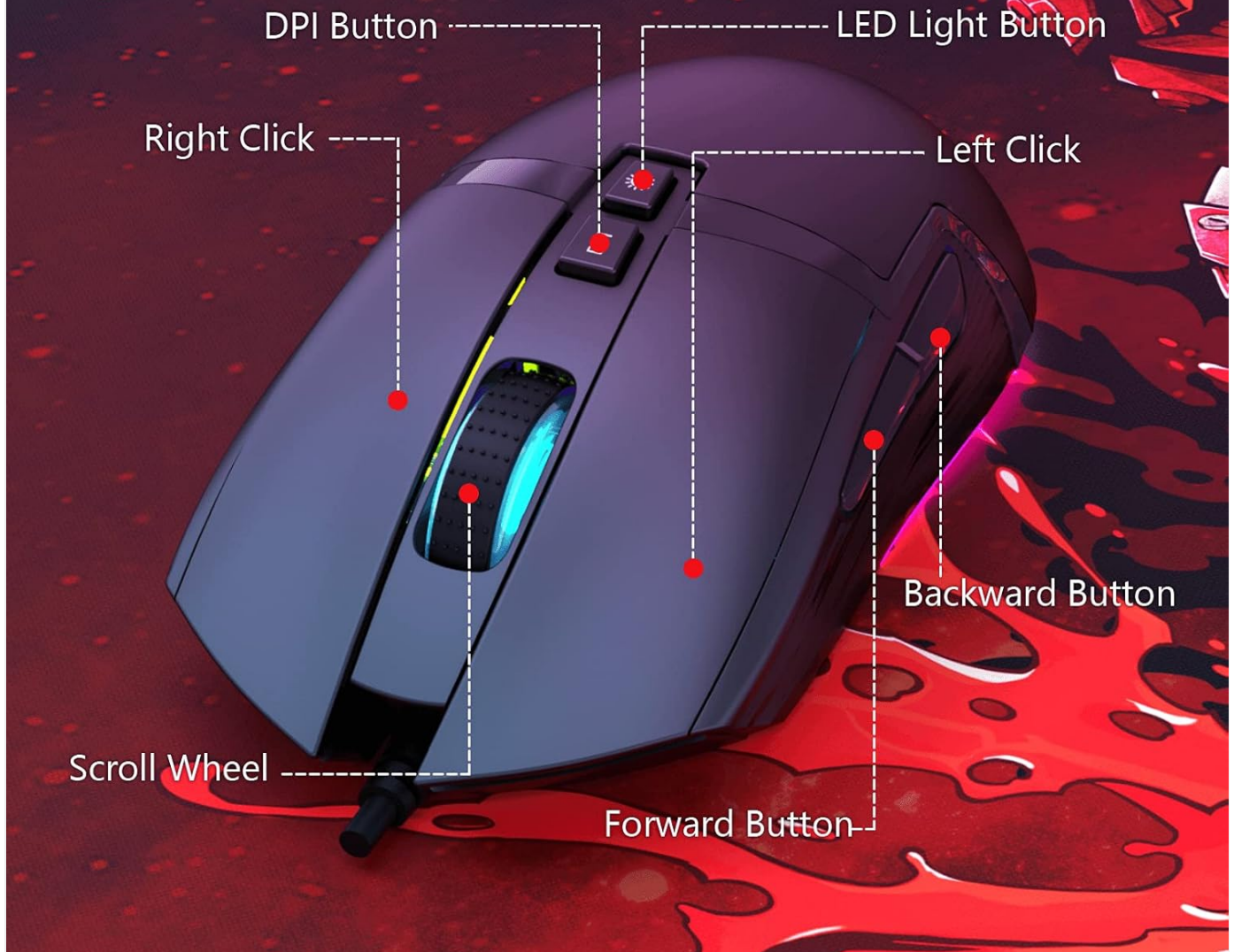
Image: Diagram illustrating the 7 programmable buttons on the MARVO CM372 gaming mouse.