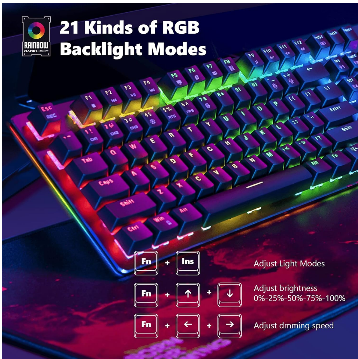
Image: Illustration of the keyboard's RGB backlight modes and key combinations for adjustment.