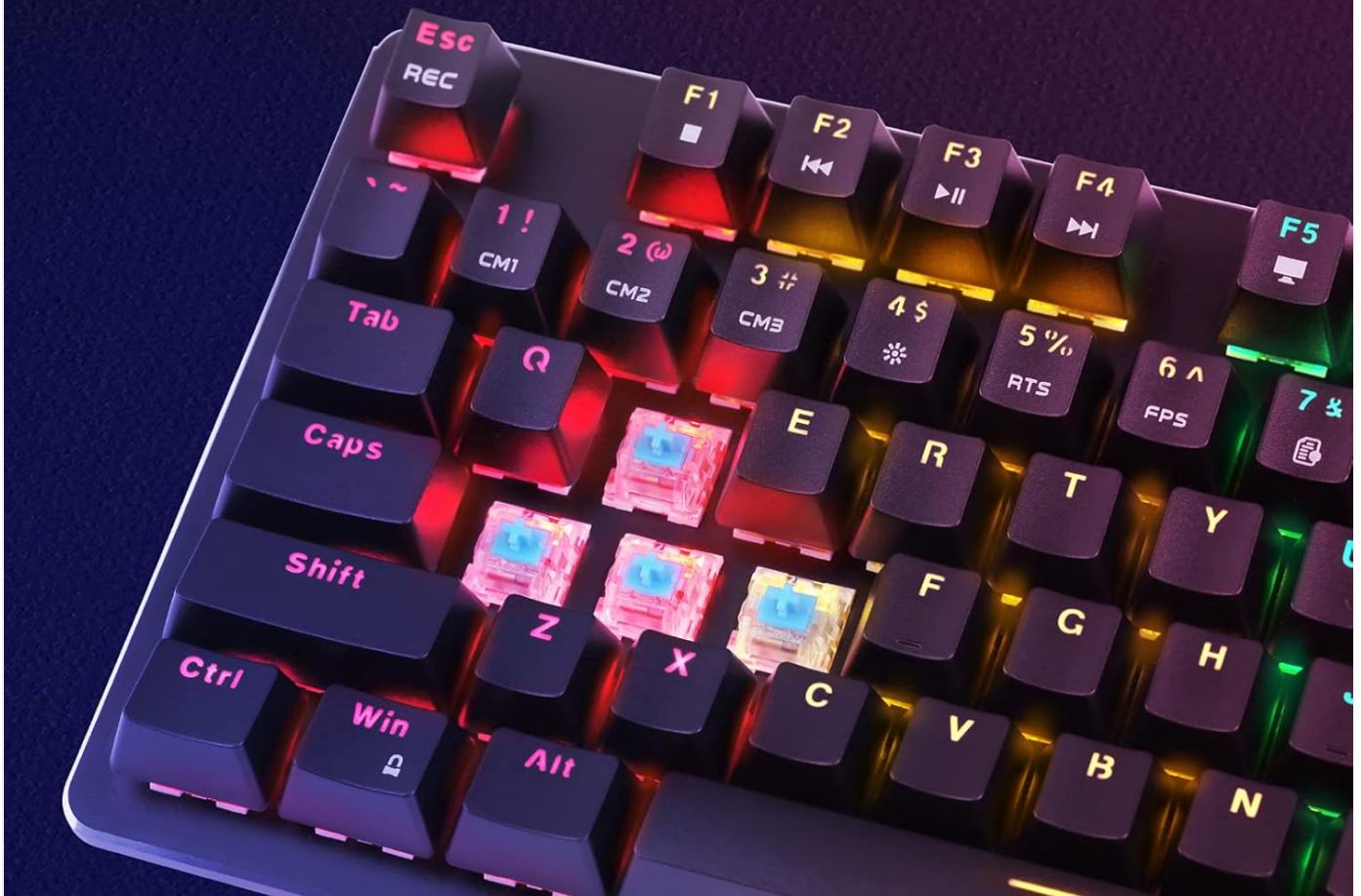
Image: Close-up view of the blue mechanical switches on the MARVO CM372 keyboard, highlighting their tactile design.

It provides a "clicky" and a tactile feedback, deliver accurate, response key commands for typing and gaming.