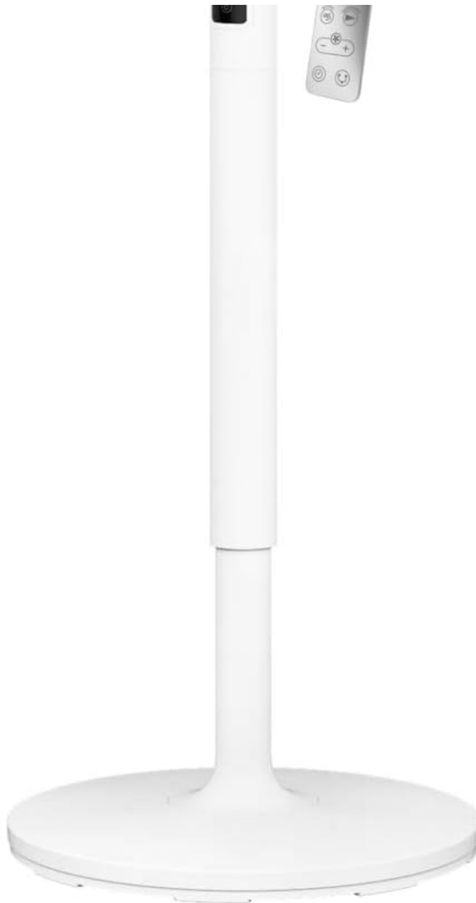
Figure 1: Rowenta Turbo Silence Extreme+ Pedestal Fan VU5870