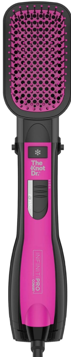
The Conair The Knot Dr. All-in-One Smoothing Dryer Brush in its complete form.