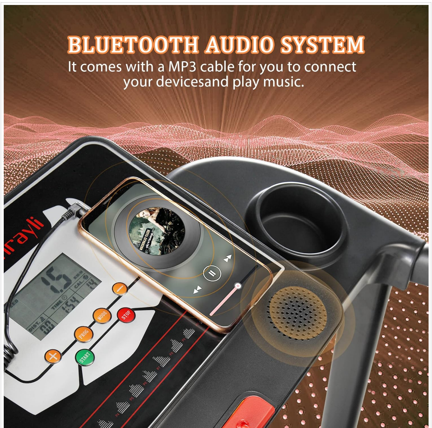
Image: The treadmill's console with a smartphone placed in the holder, demonstrating the Bluetooth audio system and MP3 connectivity.

Connect your audio device (e.g., smartphone, MP3 player) to the treadmill's audio input jack using the provided MP3 cable. Play music through the treadmill's integrated speakers.