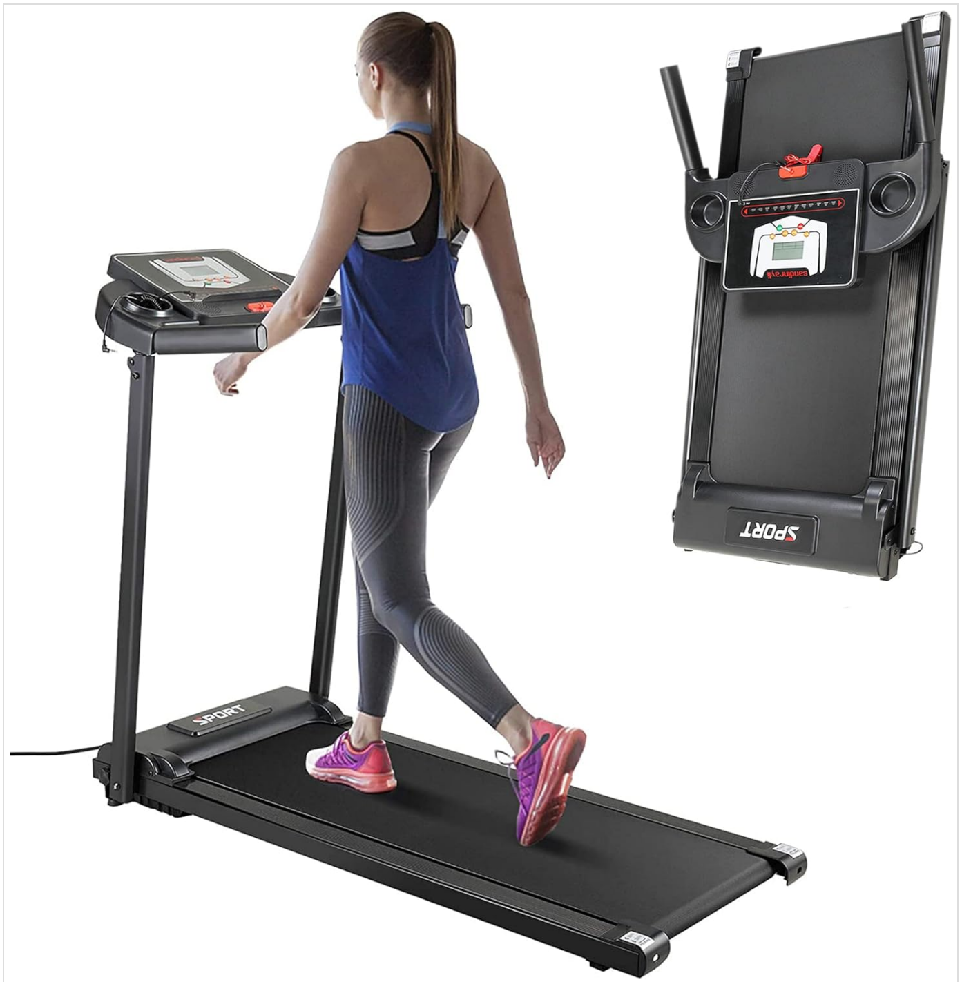
Image: The Sandinrayli Folding Electric Treadmill shown in both operational and folded states, highlighting its compact design.