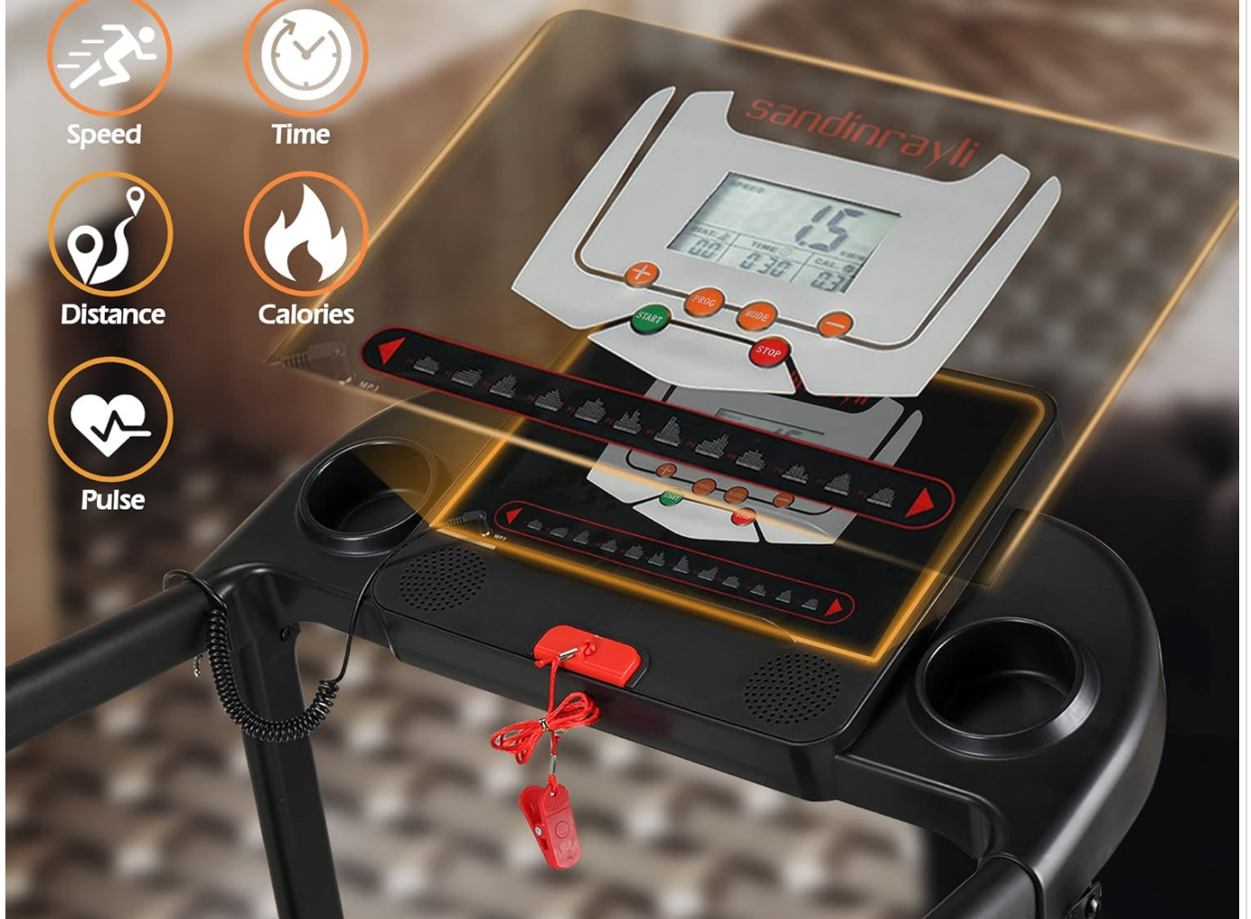
Image: Detailed view of the LCD display, indicating its ability to show speed, time, distance, calories, and pulse.