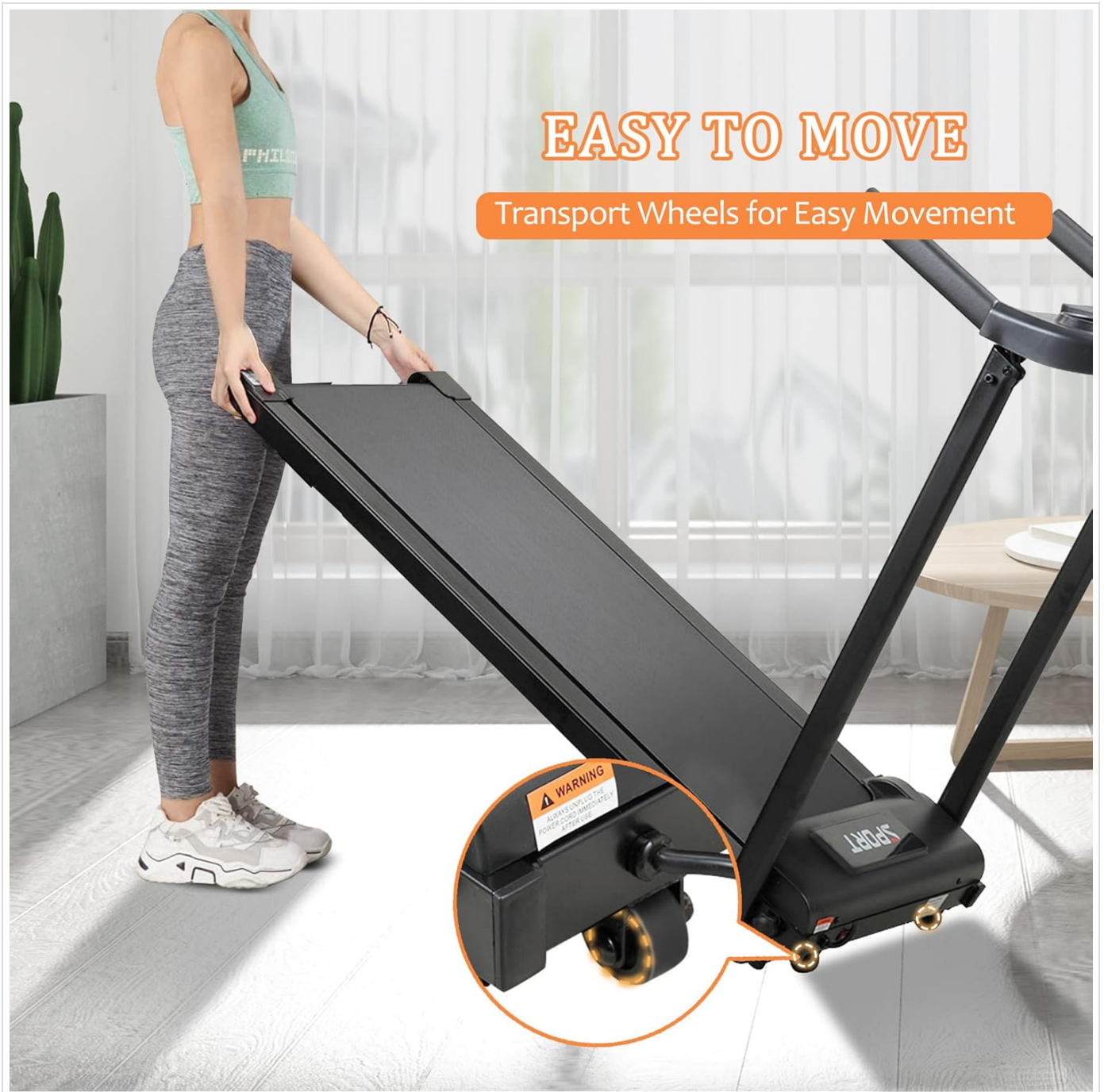
Image: The treadmill in its folded, space-saving configuration, suitable for compact living spaces.