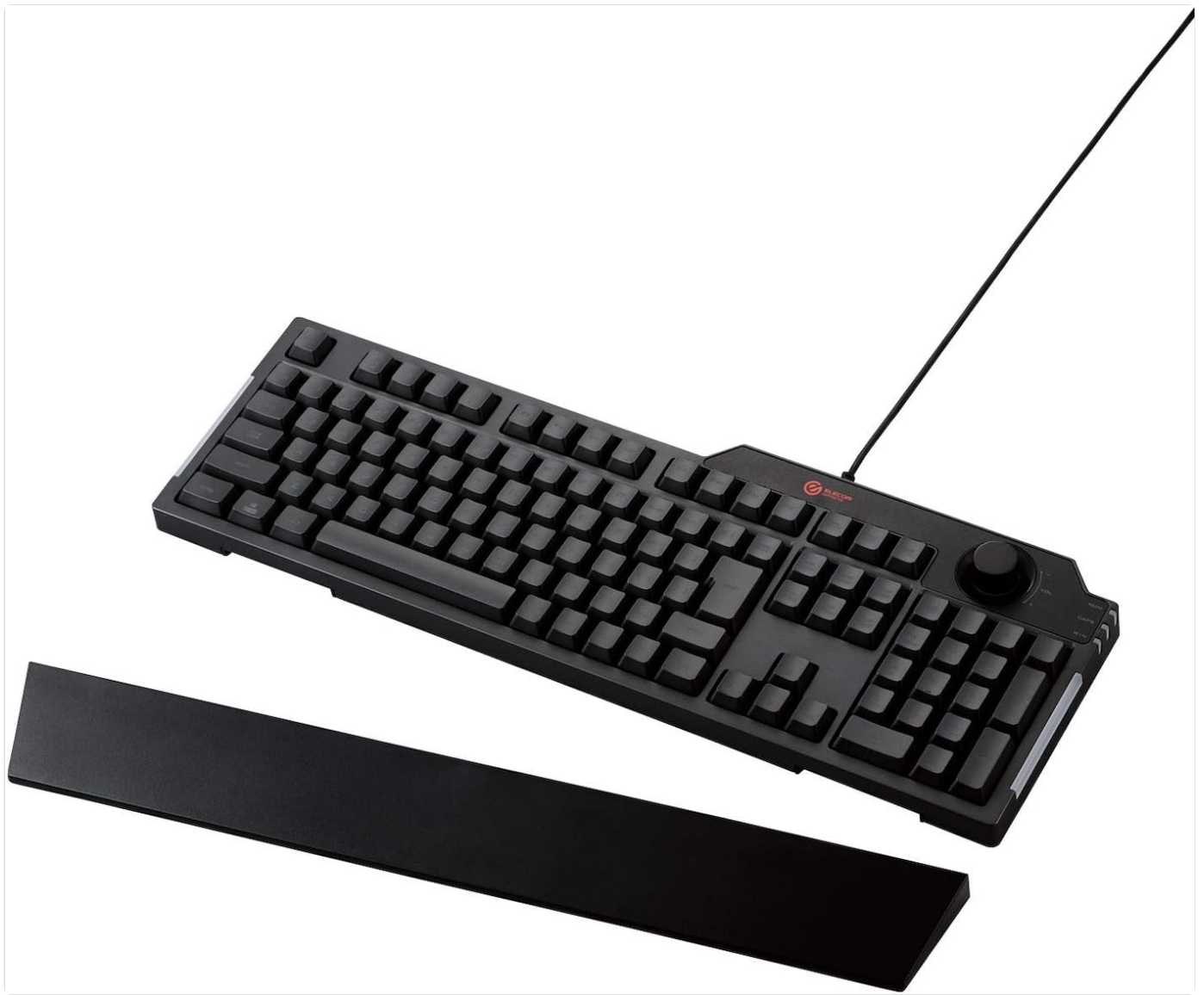
Figure 5: The keyboard shown with its detachable wrist rest separated, illustrating the modular design for user comfort and space optimization.