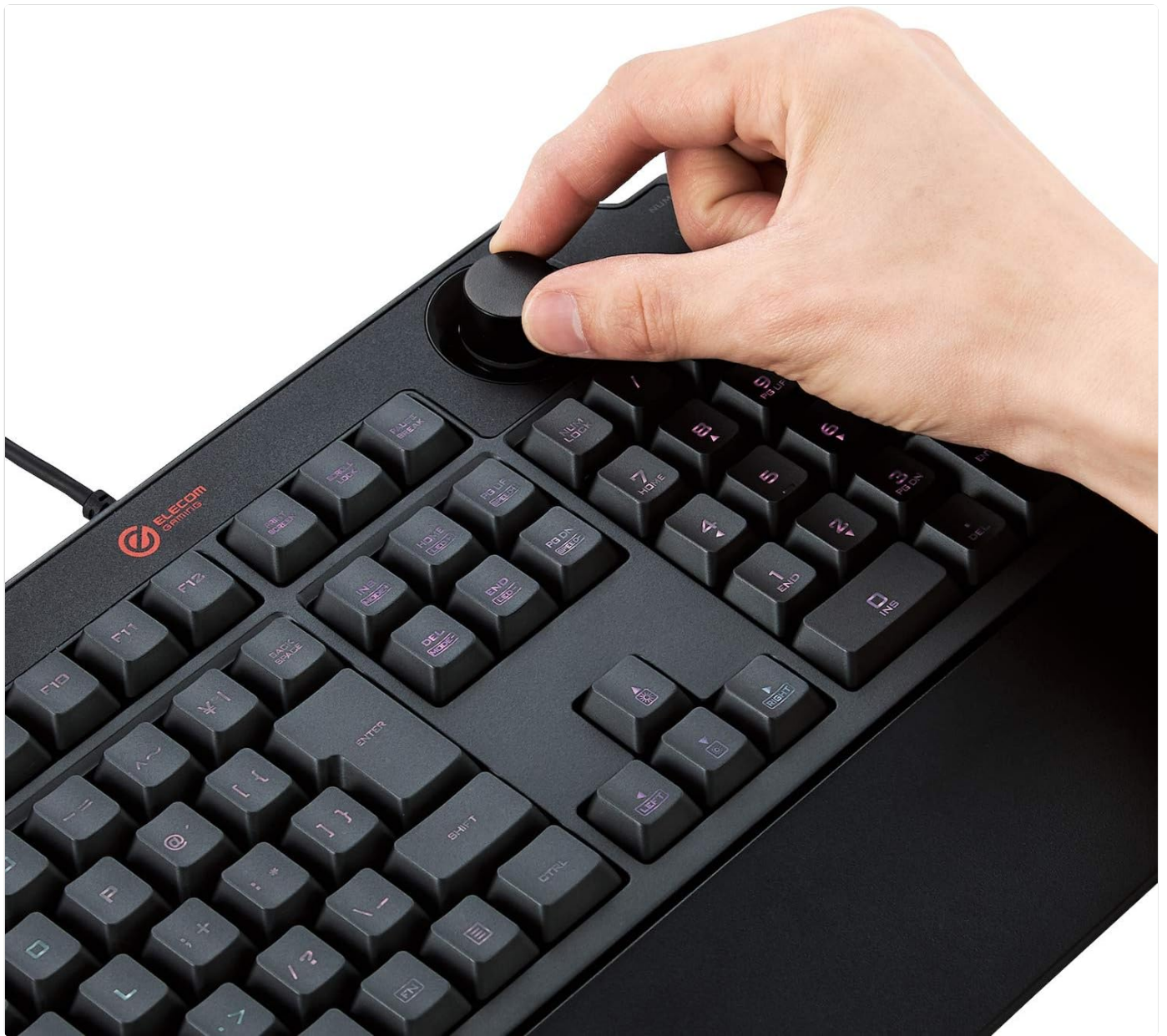
Figure 3: Detailed view of the rotary volume knob, located on the upper right side of the keyboard, designed for intuitive audio control.