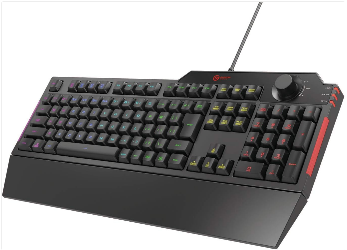
Figure 1: Overall view of the Elecom TK-G02UMBK Wired Gaming Keyboard, showcasing its full layout and RGB backlighting.