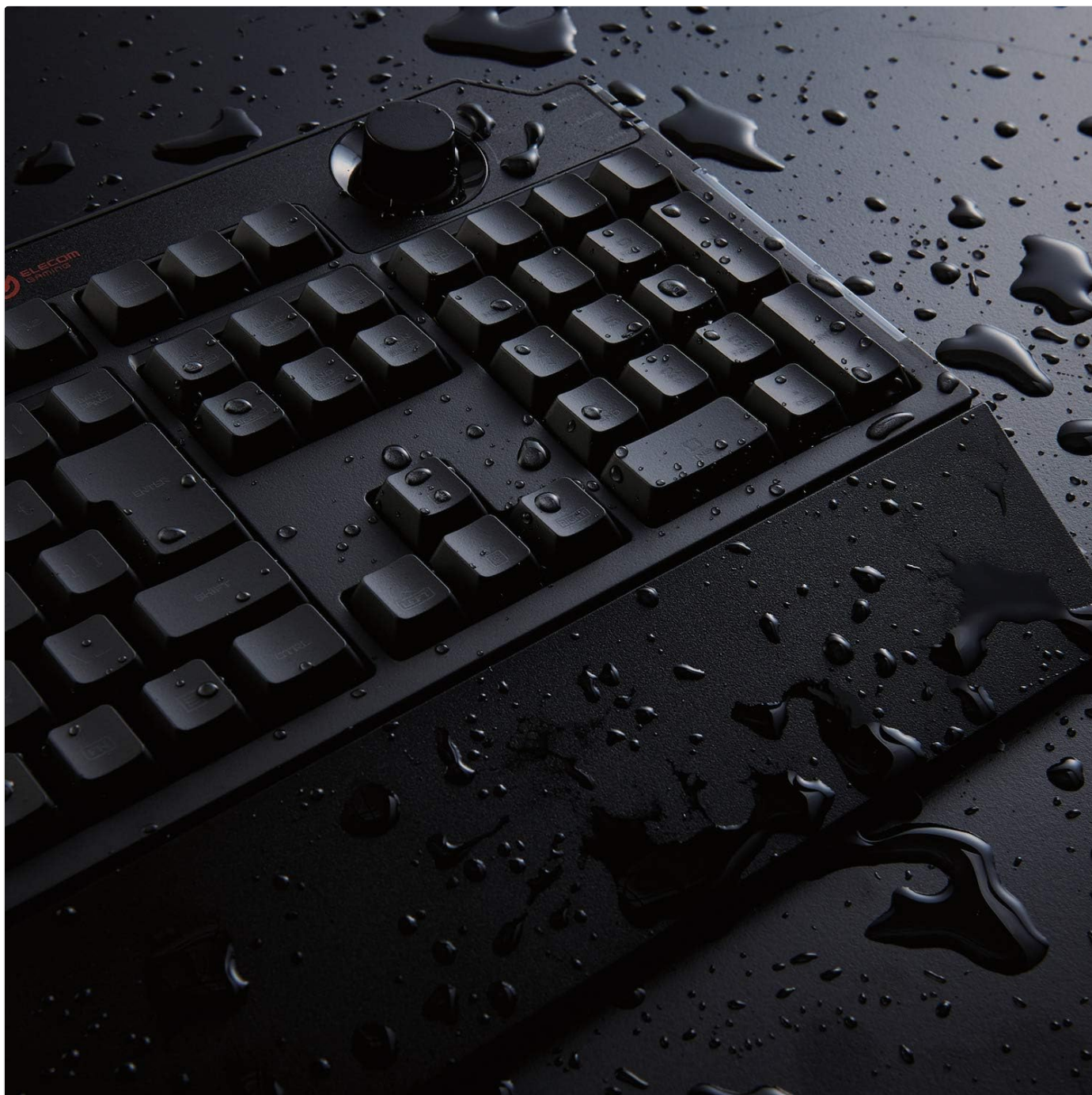
Figure 6: The keyboard surface with water droplets, visually representing its drainage function designed to protect against accidental liquid spills.