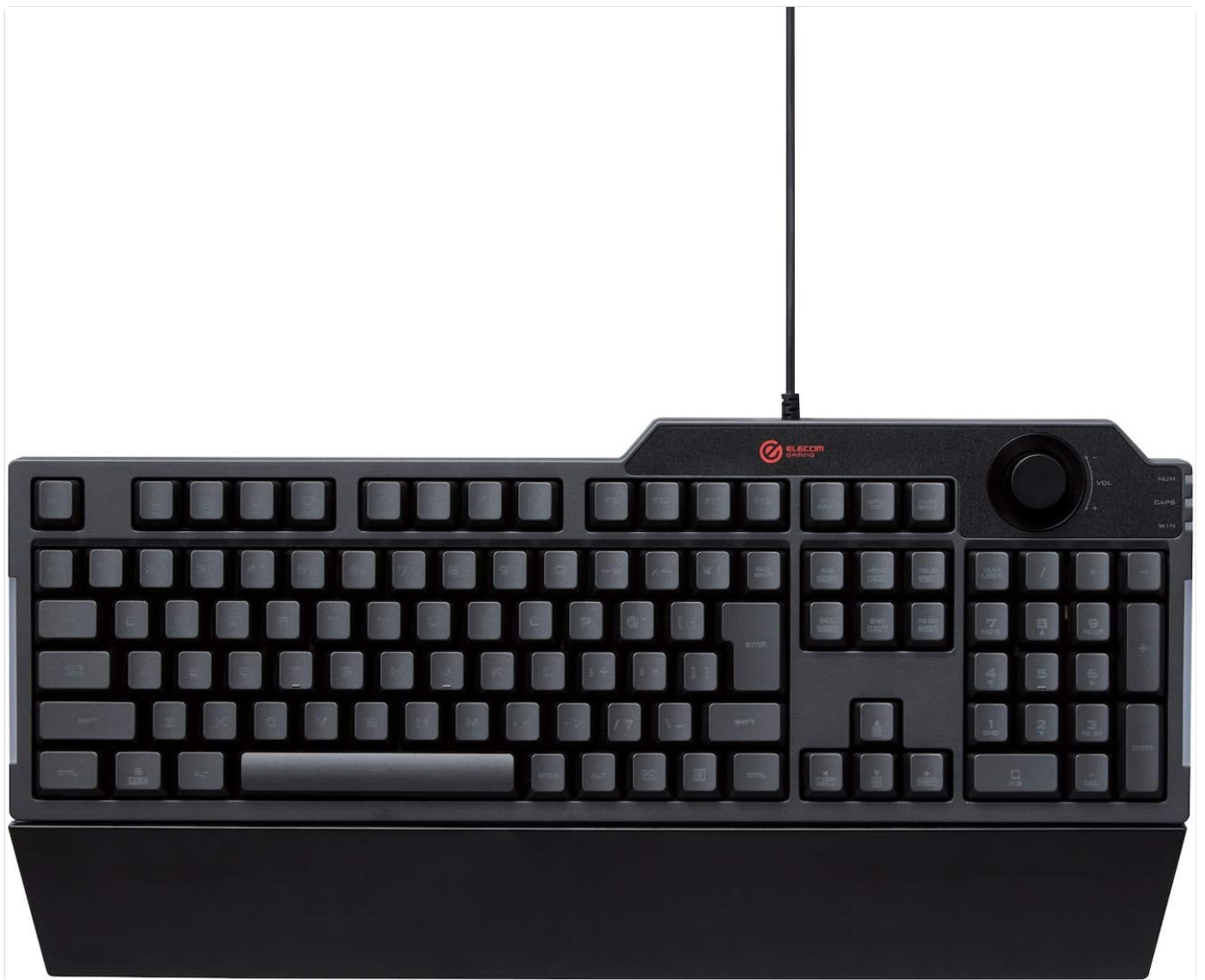
Figure 2: Top-down perspective of the keyboard, highlighting the key arrangement and the integrated volume dial.