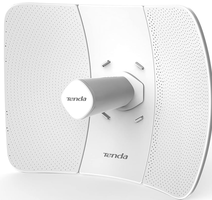
Image: The Tenda O9 Outdoor CPE unit, showing its white, rectangular design with integrated antenna.