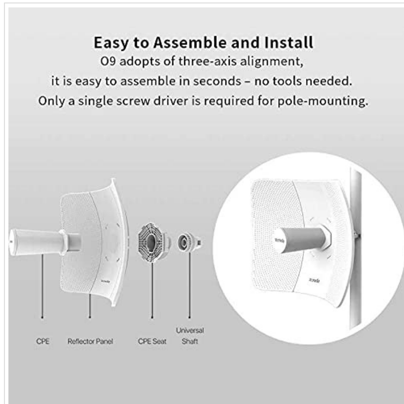
Image: An exploded diagram showing the main components of the Tenda O9 (CPE, Reflector Panel, CPE Seat, Universal Shaft) and how they fit together for assembly.

The O9 utilizes a three-axis alignment design, allowing for quick assembly without the need for specialized tools. For pole-mounting, only a single screwdriver is typically required.