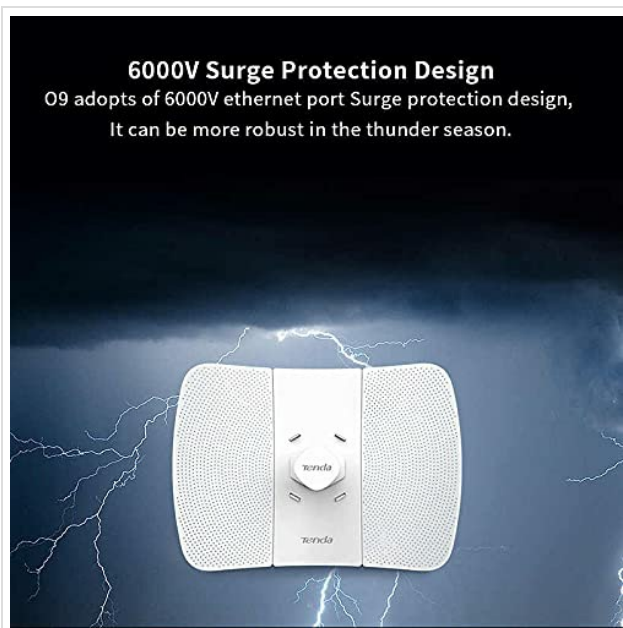
Image: The Tenda O9 unit with graphic elements depicting lightning, highlighting its 6000V Ethernet port surge protection design.

Designed for outdoor deployment, the O9 operates on the 5GHz band, utilizing 802.11ac wireless standards for high-speed data transmission. Its robust construction ensures reliable operation in various environmental conditions.