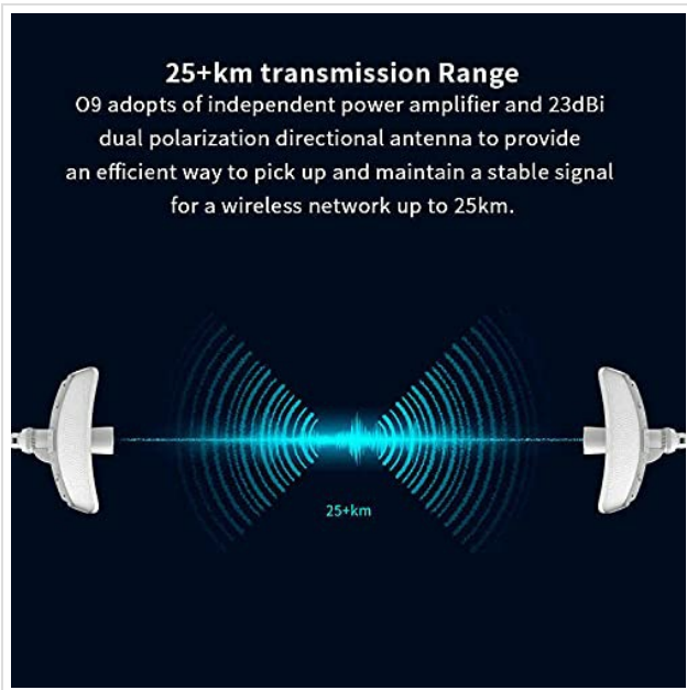
Image: A diagram illustrating two Tenda O9 units communicating wirelessly over a distance of 25+ kilometers, emphasizing its long-range capability.