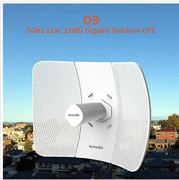
Image: The Tenda O9 CPE unit positioned against a backdrop of a city skyline, illustrating its outdoor application.