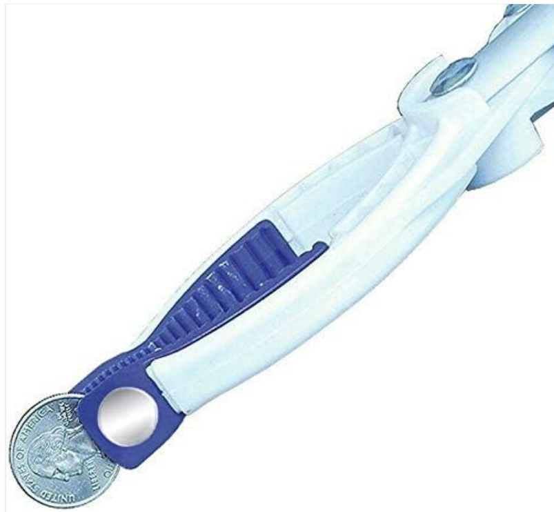
Image: The precision grip picking up a coin.