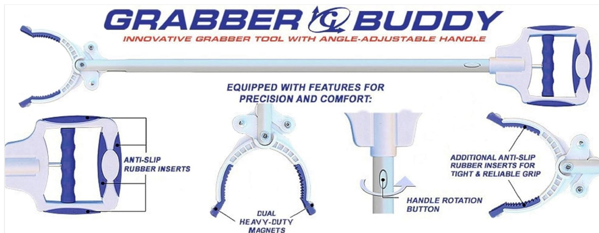
Image: Key features of the GRABBER BUDDY Reacher Tool.