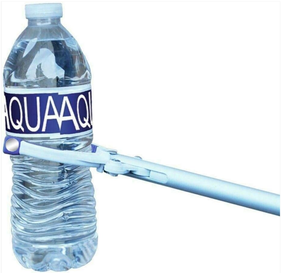
Image: Using the reacher tool to pick up a water bottle.