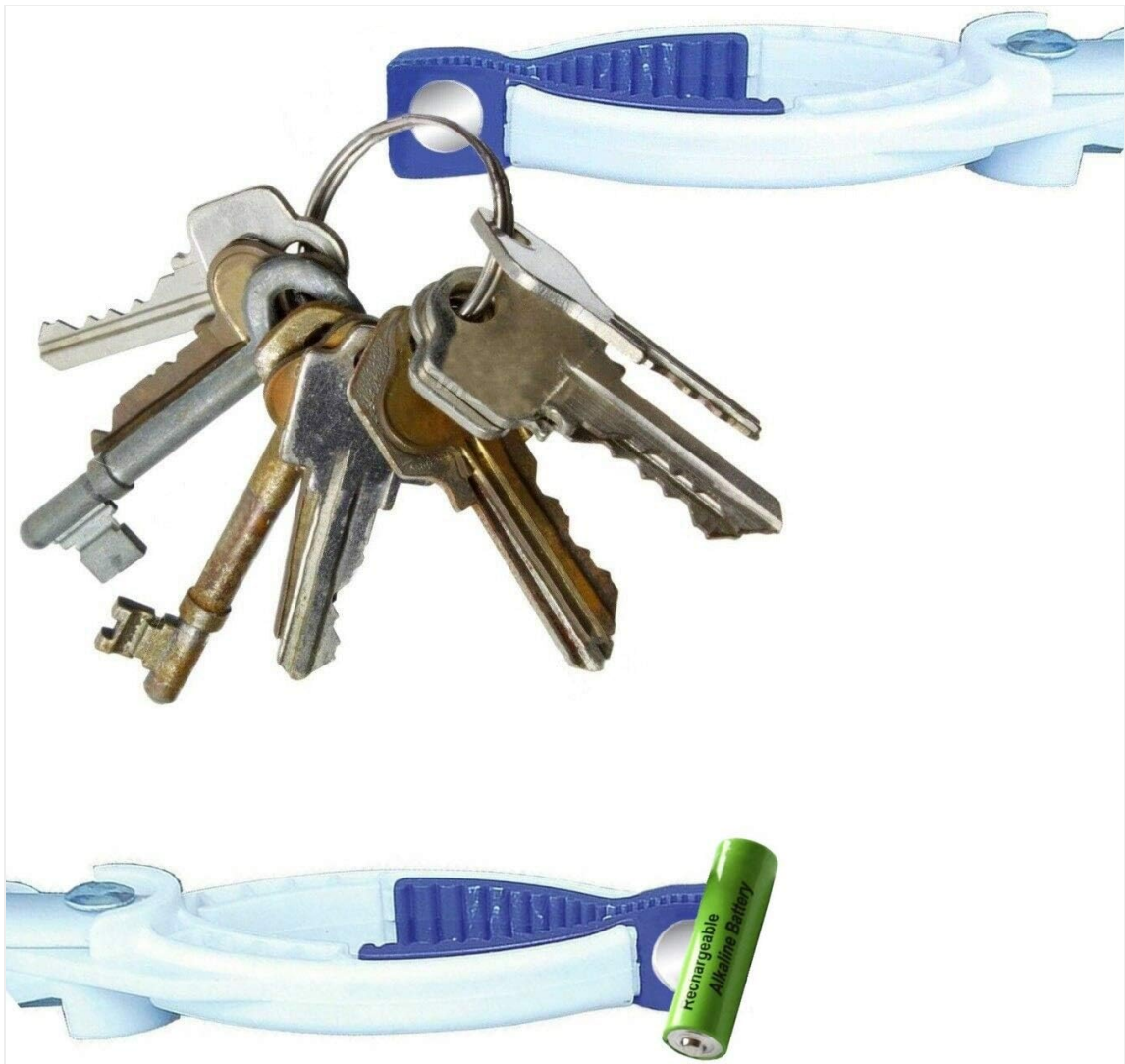
Image: The magnetic tip securely holding a set of keys.