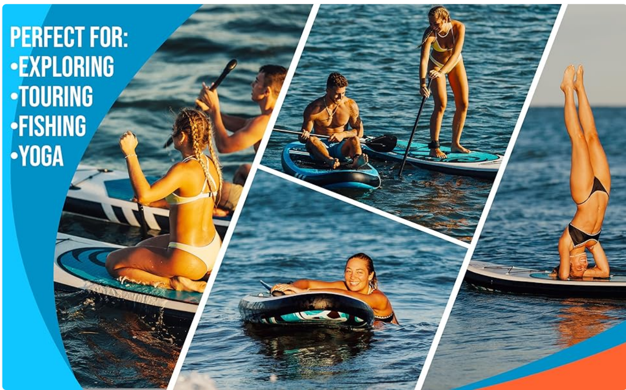
Figure 4.2: The FITWAVE SUP is suitable for various water activities.