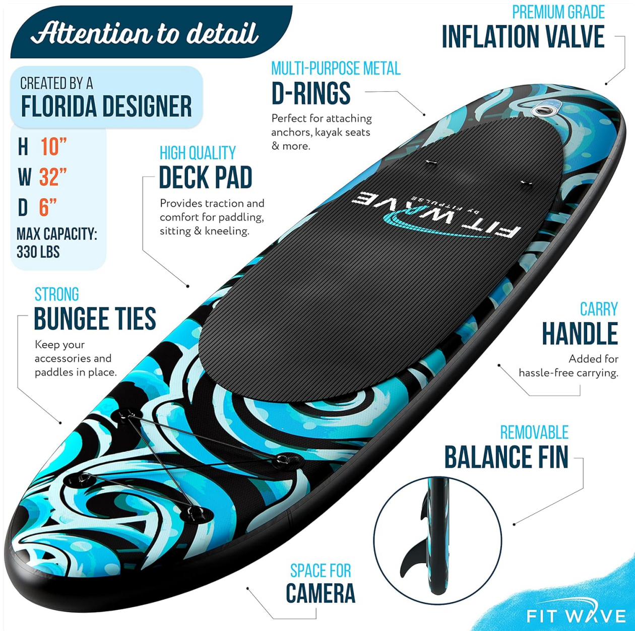
Figure 3.1: Key features and components of the FITWAVE Inflatable SUP.

Your browser does not support the video tag.