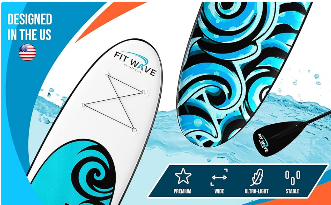
Figure 7.1: FITWAVE Paddle Board specifications and dimensions.