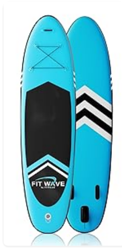
Figure 2.1: All accessories included with your FITWAVE Inflatable SUP.