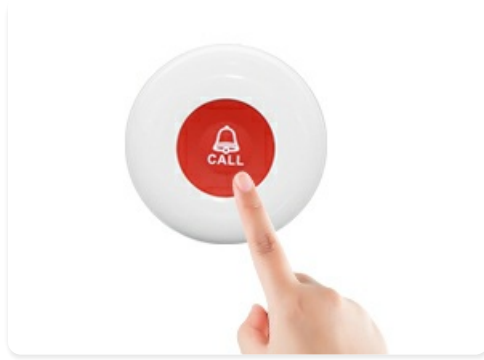
Figure 4: Pressing the call button to send an alert.