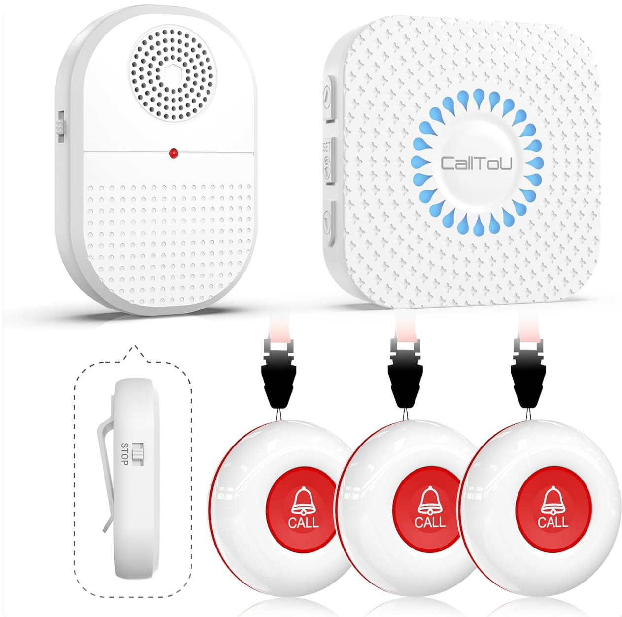
Figure 1: CallToU Wireless Caregiver Pager System components.