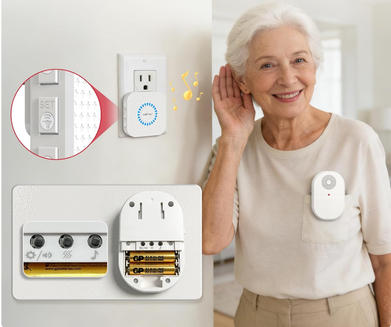
Figure 2: All included components of the CallToU Caregiver Pager System.

5-level volume control (0-100dB) & Vibration