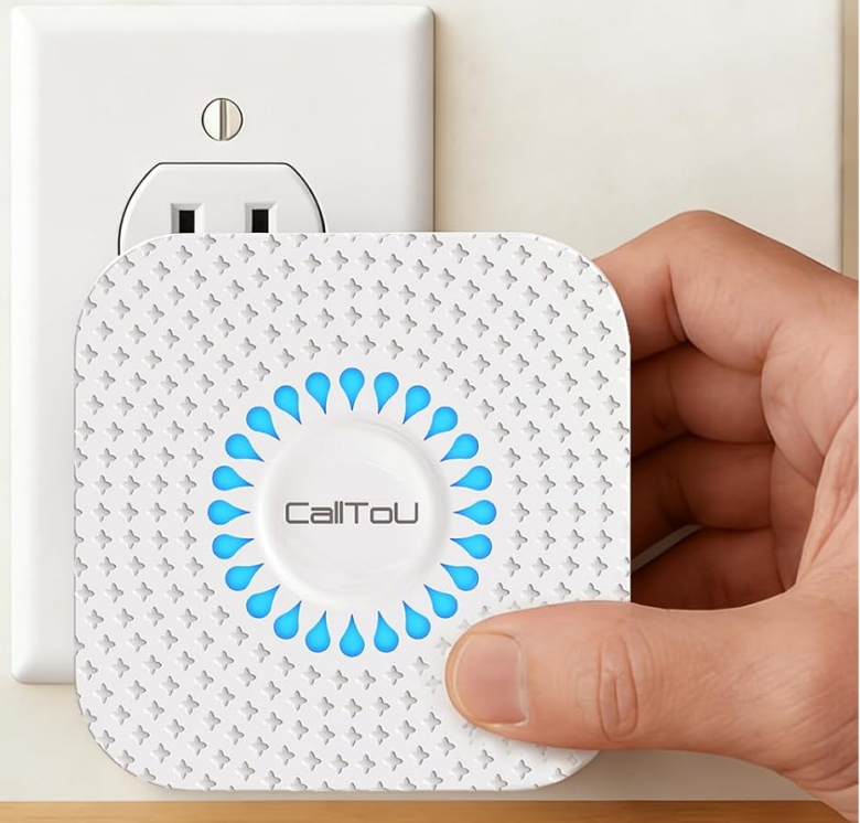
Figure 6: The system offers a 500ft long-range signal for comprehensive coverage.