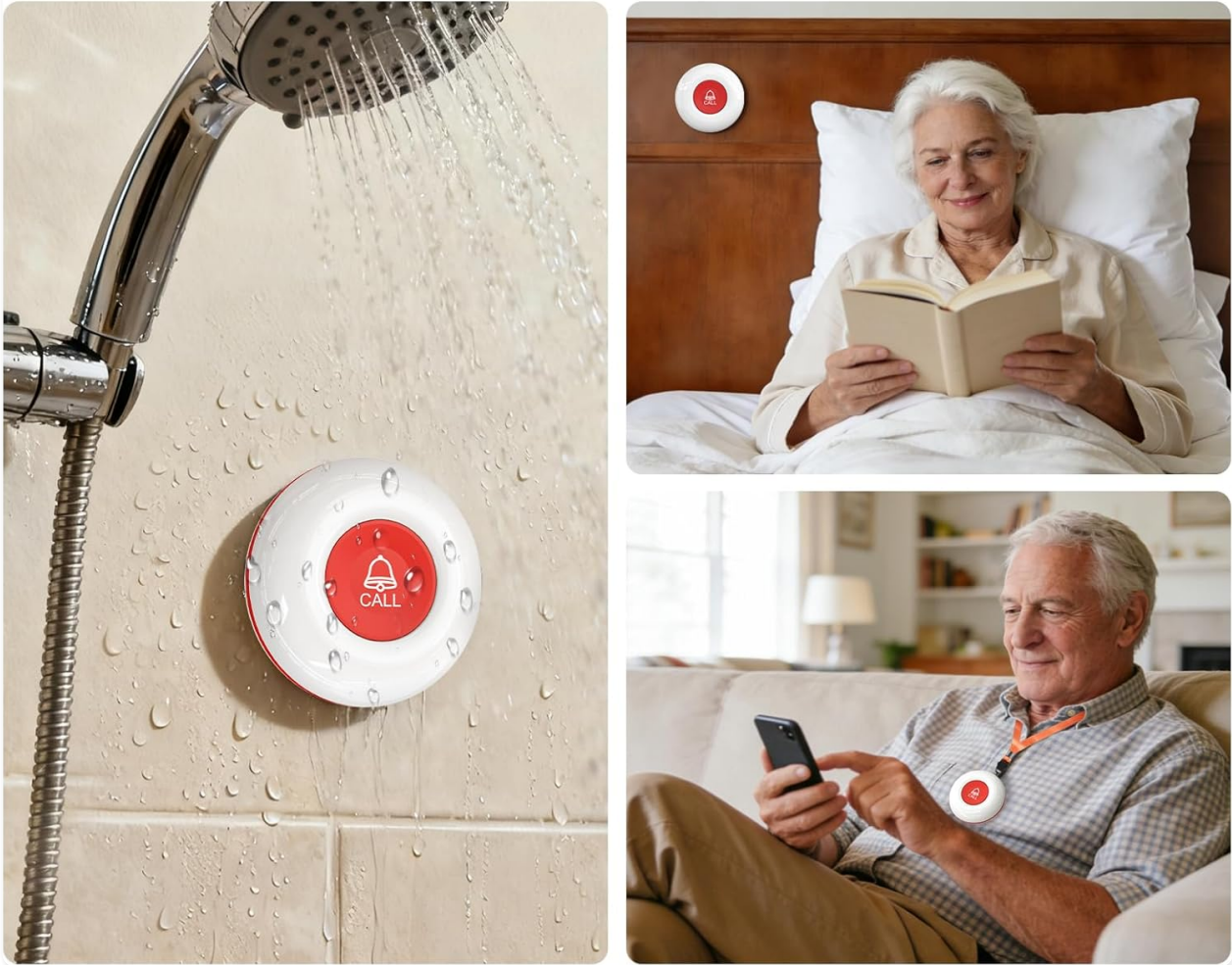
Figure 7: Call buttons can be worn or placed in various locations, including wet environments.

Take it off easily in the bedroom, wear it in the shower, or hang it conveniently from your neck.