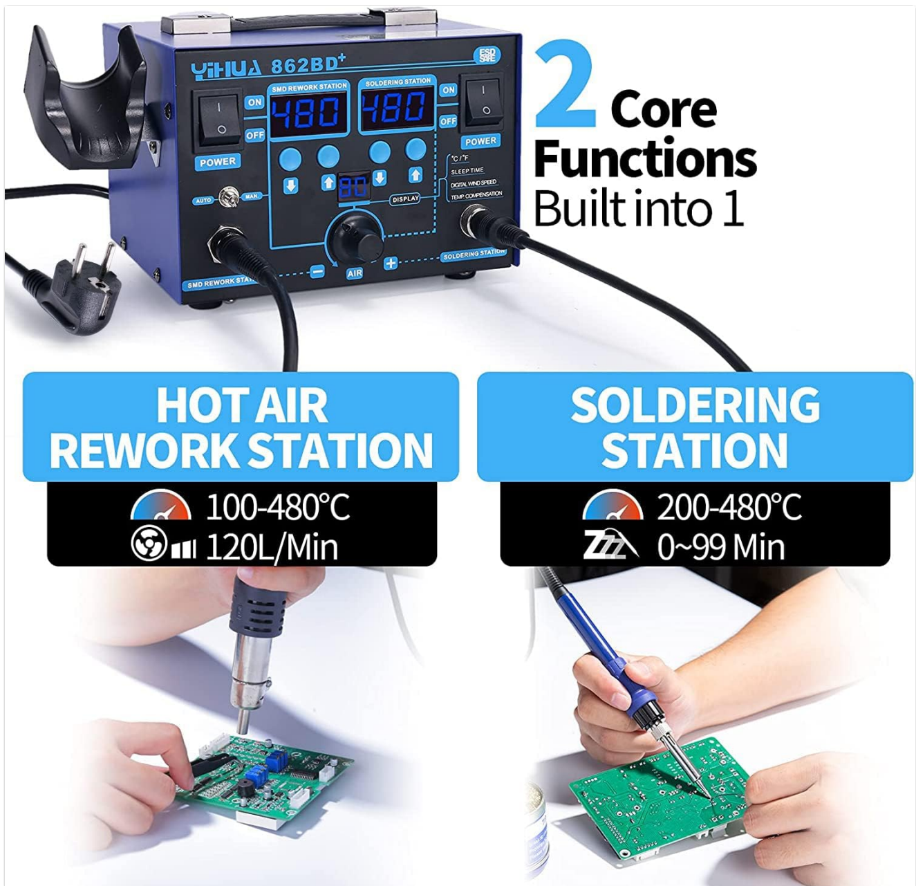
Figure 2: Overview of the 2-in-1 functionality: Hot Air Rework Station and Soldering Station.