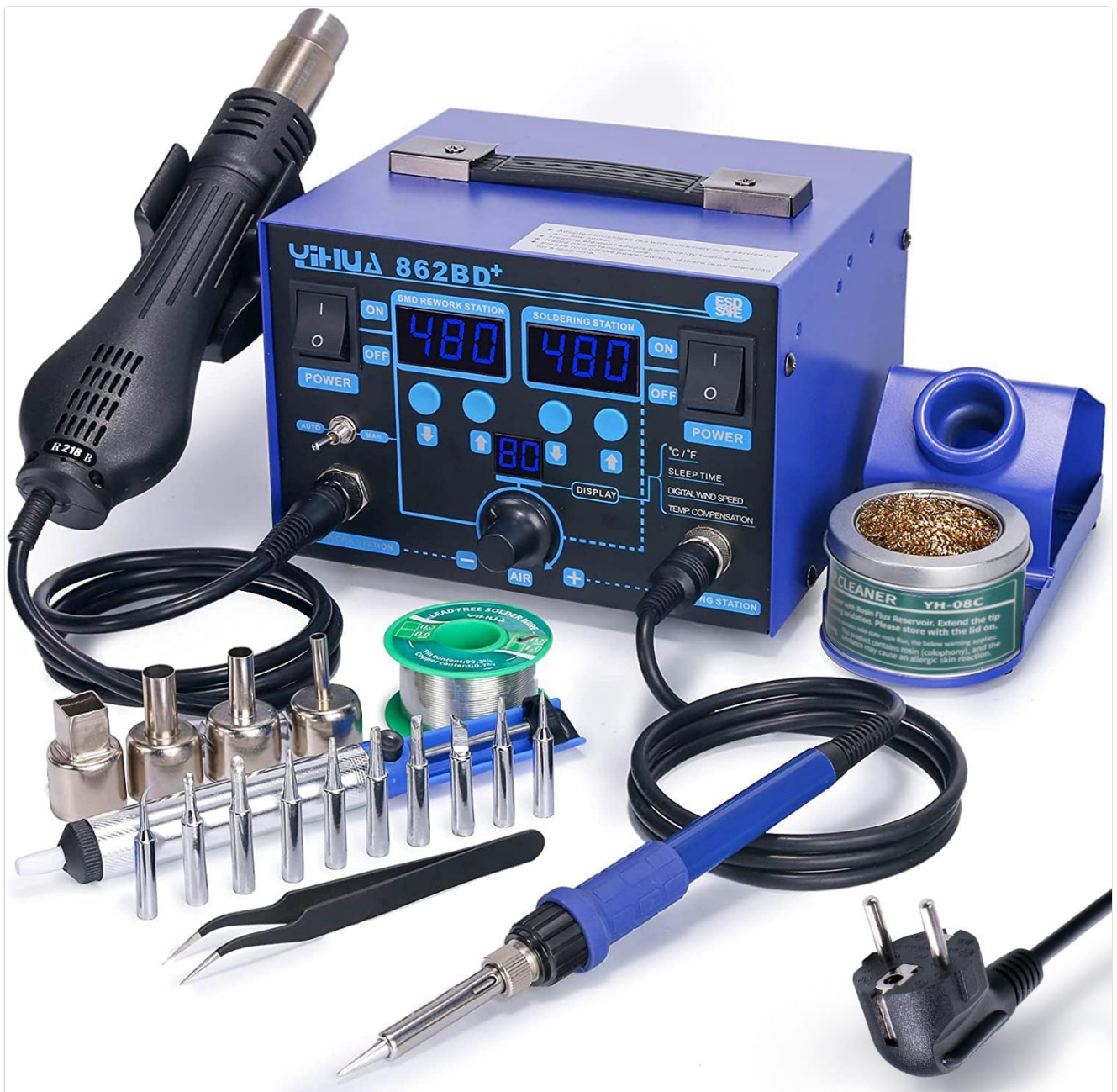
Figure 1: YIHUA 862BD+ Soldering and Hot Air Rework Station with included accessories.