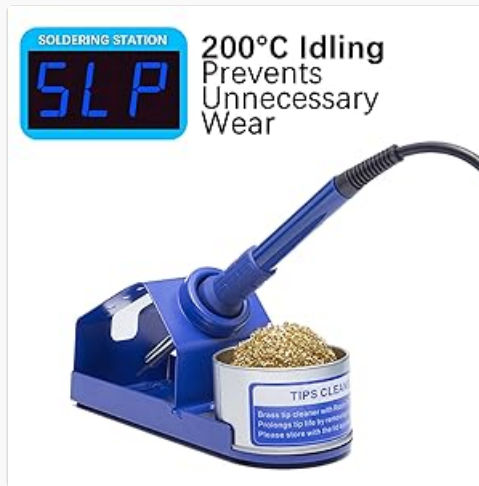
Figure 10: Soldering station display indicating sleep mode (SLP).