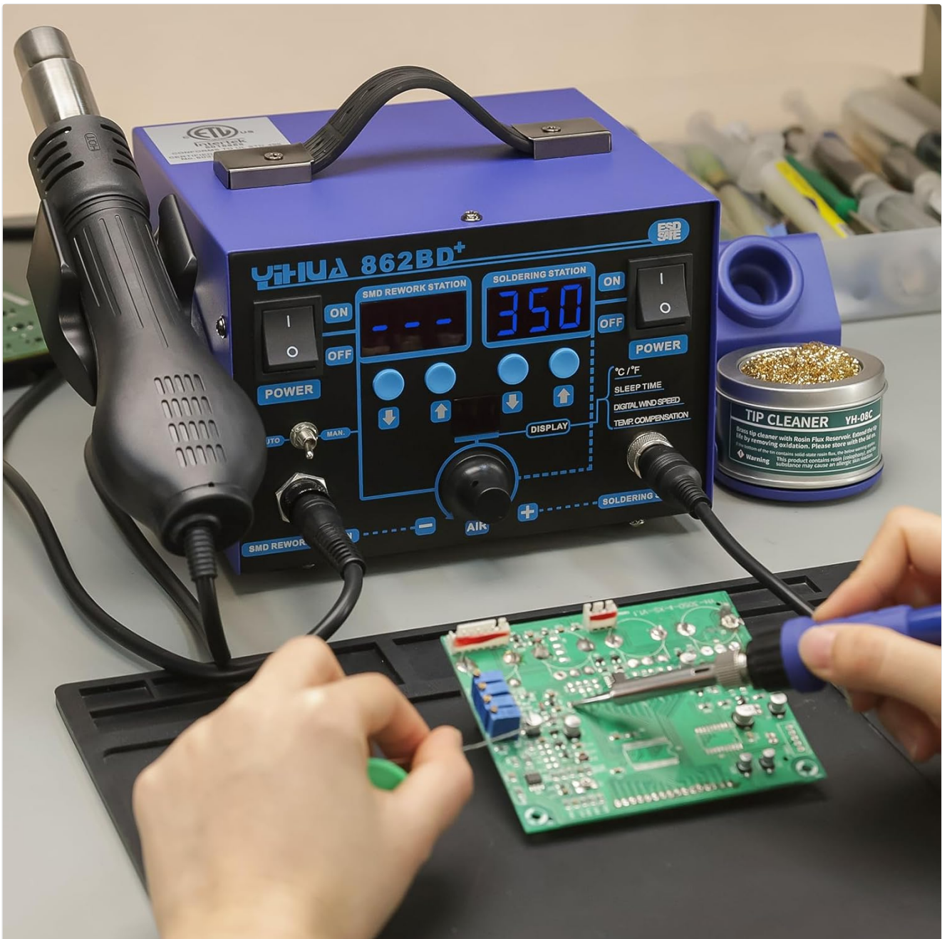
Figure 12: User operating the YIHUA 862BD+ station for soldering.