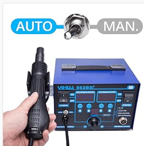
Figure 7: Hot air gun in Automatic (AUTO) mode.