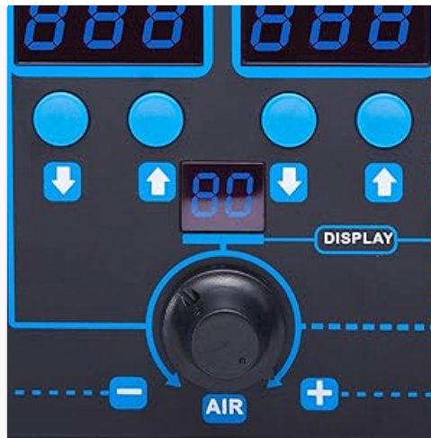
Figure 5: Air volume adjustment knob.