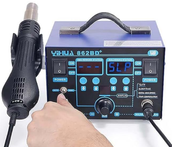
Figure 6: Hot air gun in use and explanation of Auto/Manual modes.

MANUAL - Continue operating when in the holder