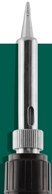
Figure 11: Recommended temperature calculation for soldering.

2. The set temperature for a soldering iron/station should be an additional approximately 100°C / 180°F higher to provide a heat reserve for the quick thermal recovery of the tip after the solder connection is made.