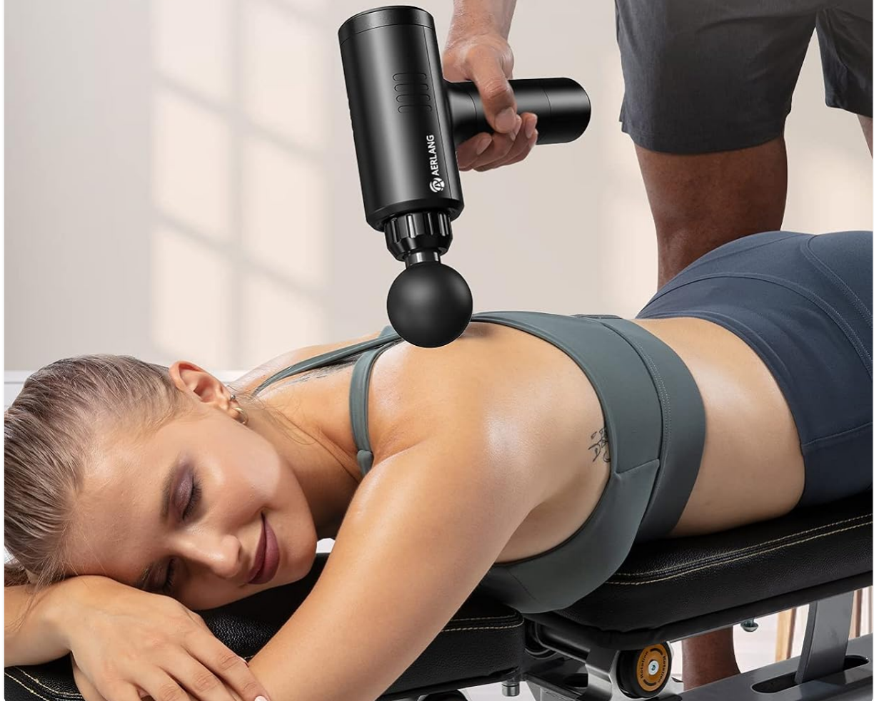
Image: A user demonstrating accurate percussive massage on their back with the AERLANG Massager Gun.