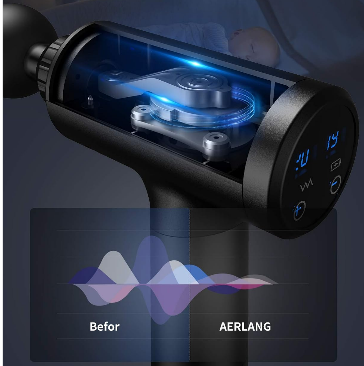
Image: Graphic illustrating the low noise level (35dB-55dB) of the AERLANG Percussive Massager.