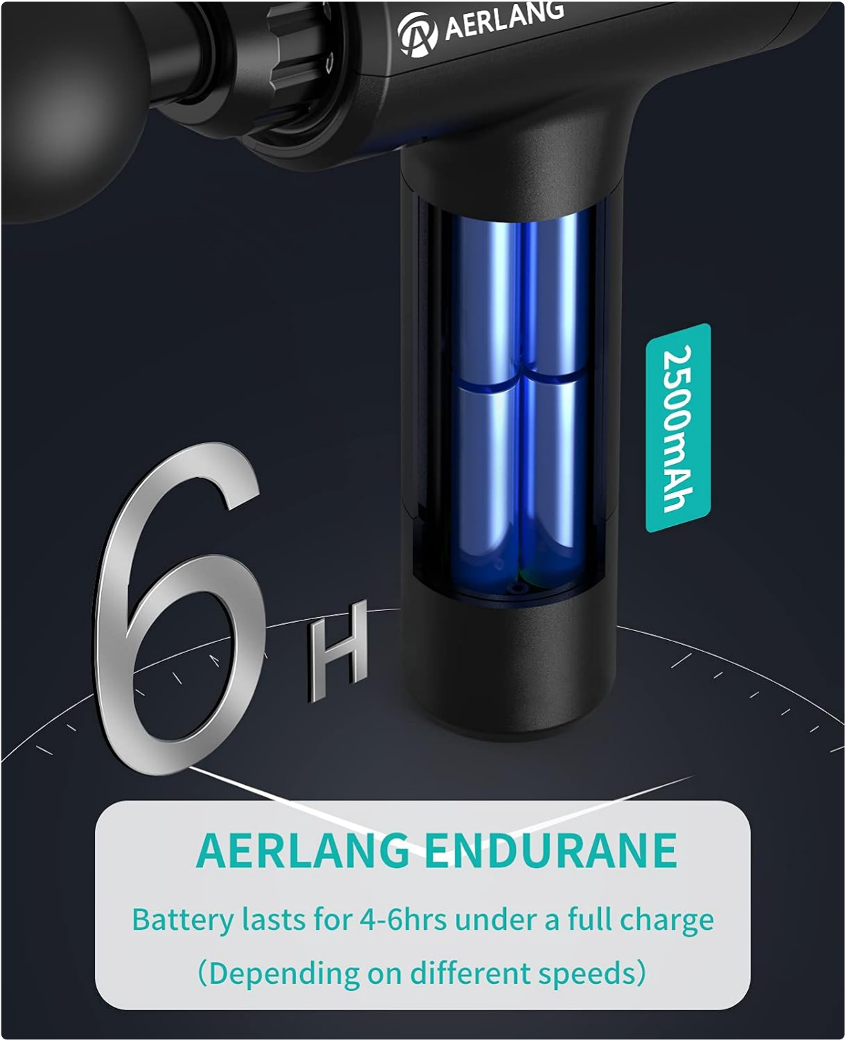
Image: Illustration of the AERLANG Massager Gun's 2500mAh battery, indicating 4-6 hours of endurance per charge.