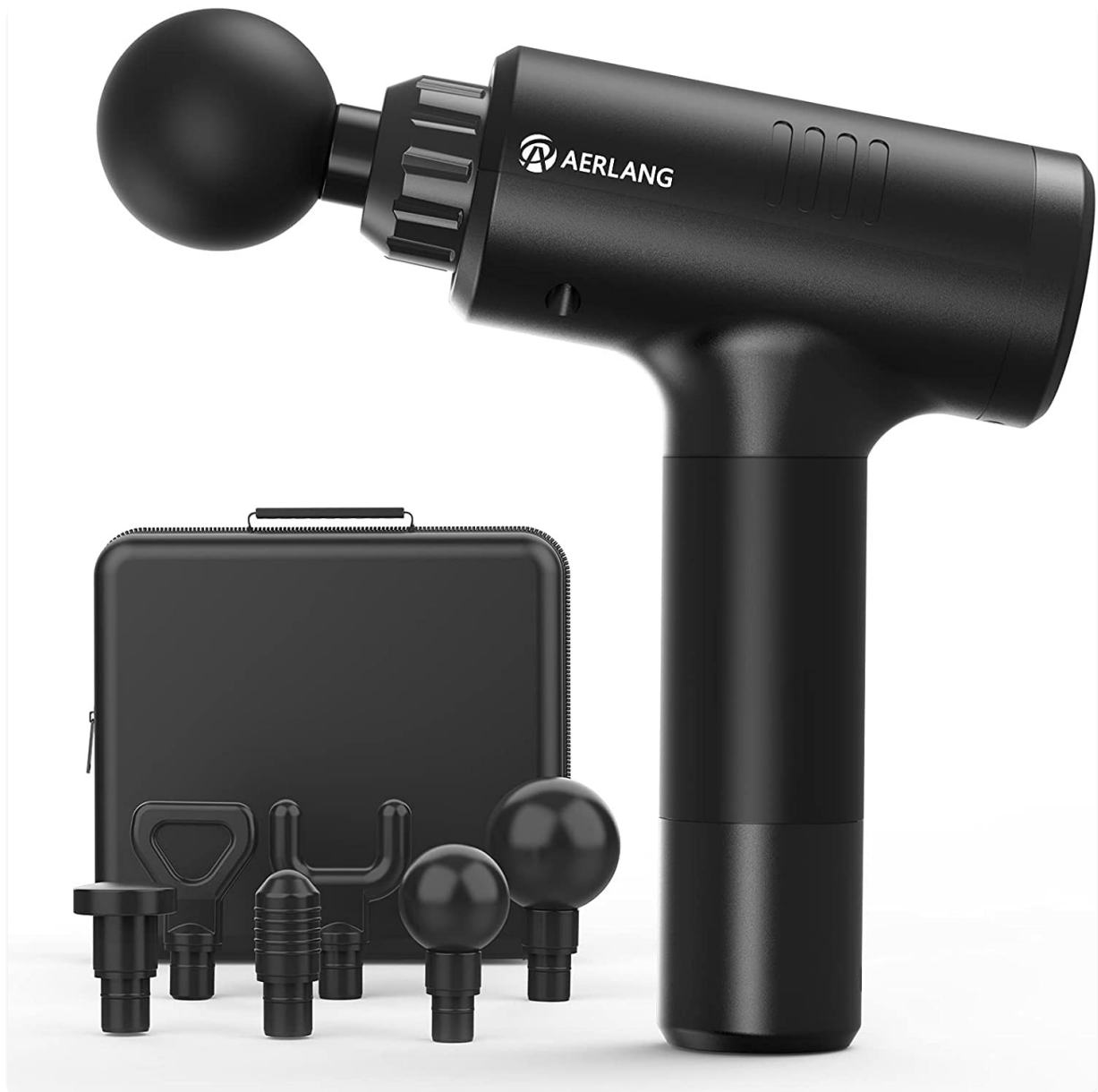
Image: The AERLANG Massager Gun being used for professional deep tissue massage, highlighting its 16mm amplitude.