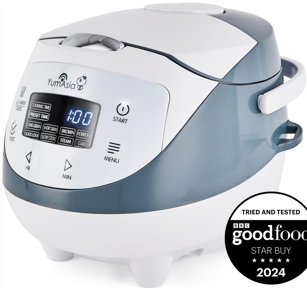
Image: The compact and stylish Yum Asia Panda Mini Rice Cooker in white and grey.