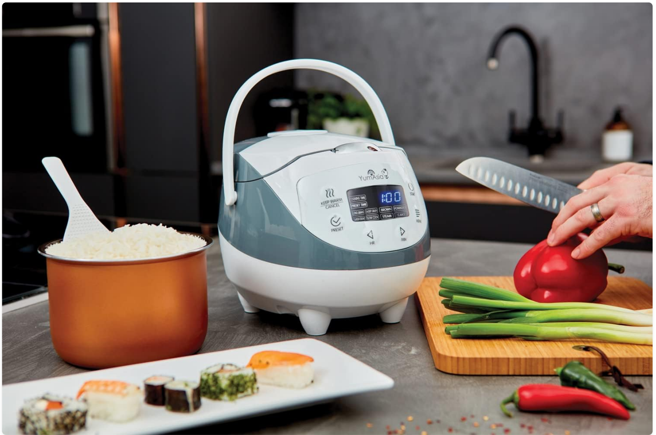
Image: Close-up of the digital LED display and smart button control panel, showing various cooking functions.