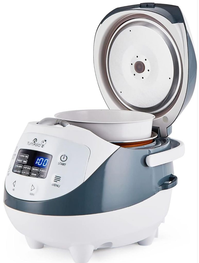
Image: Close-up view of the inner bowl and lid, showing the measurement lines for different rice types.