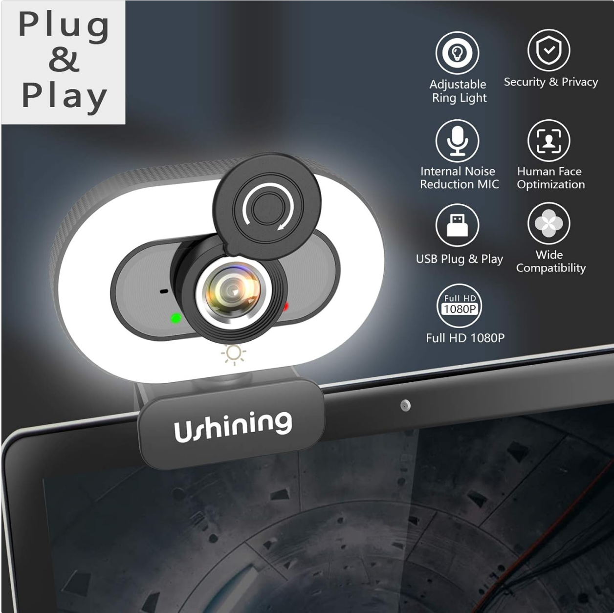
Image 2: Overview of key features including adjustable ring light, security & privacy, internal noise reduction mic, USB plug & play, human face optimization, wide compatibility, and Full HD 1080P resolution.