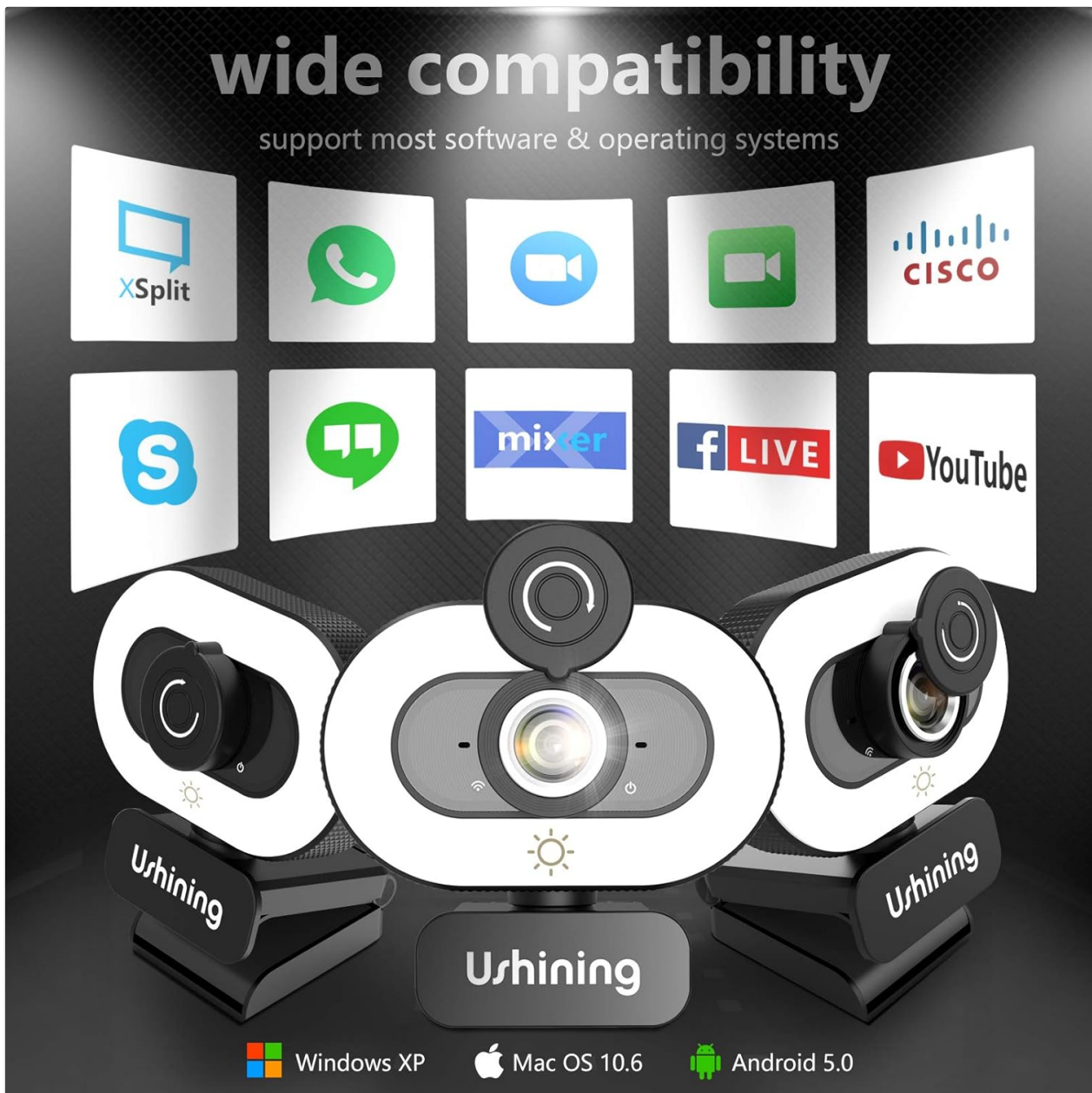
Image 8: Displays the wide compatibility of the webcam with various software and operating systems, including Windows XP, Mac OS 10.6, and Android 5.0.