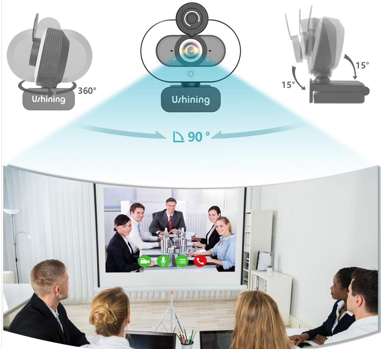
Image 6: Demonstrates the 90-degree wide-angle view and flexible mounting options, including 360-degree rotation and 15-degree tilt.