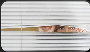
Refusing to peek