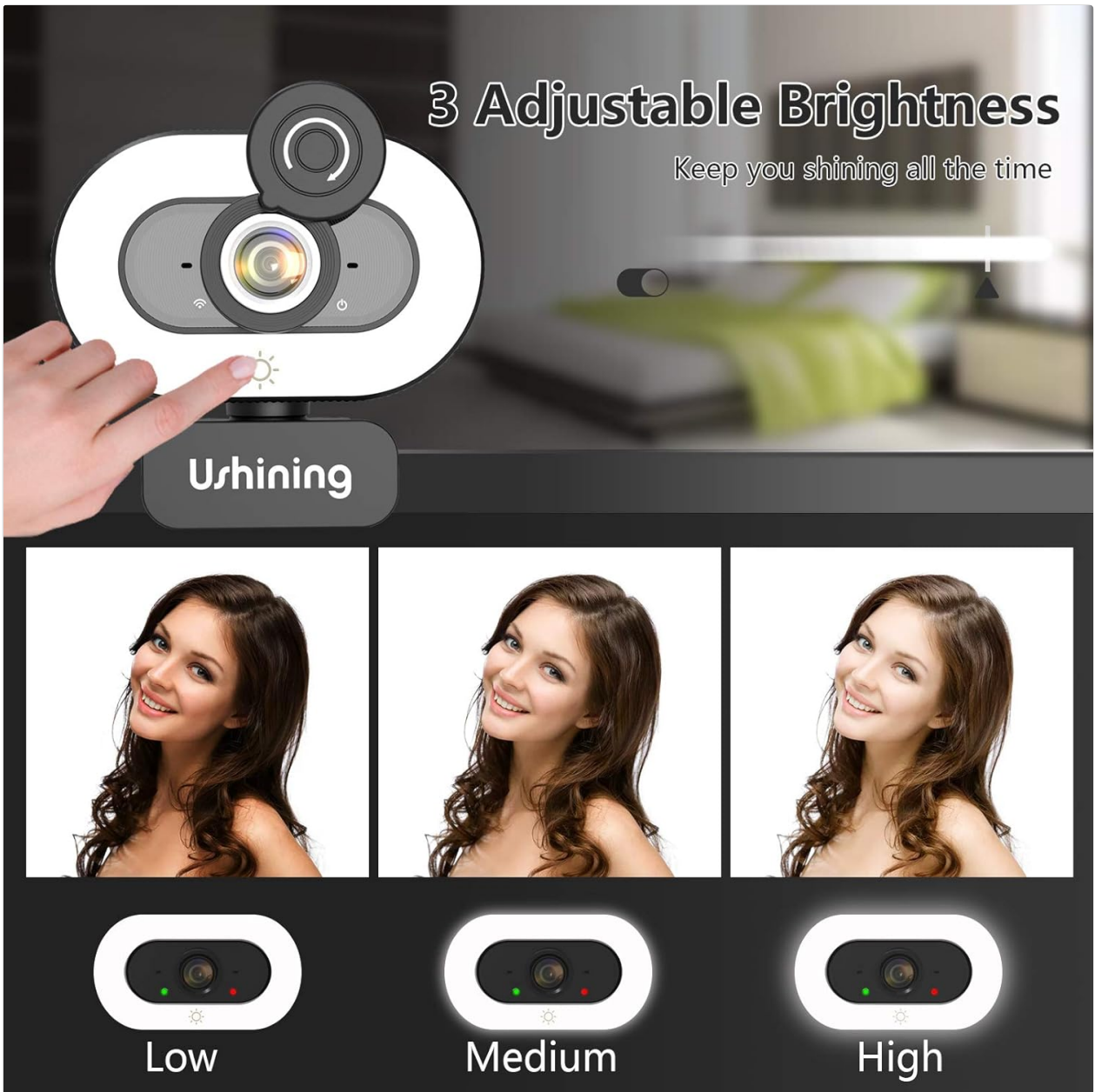
Image 3: Demonstrates the three adjustable brightness levels (Low, Medium, High) of the integrated ring light, controlled by a touch sensor.