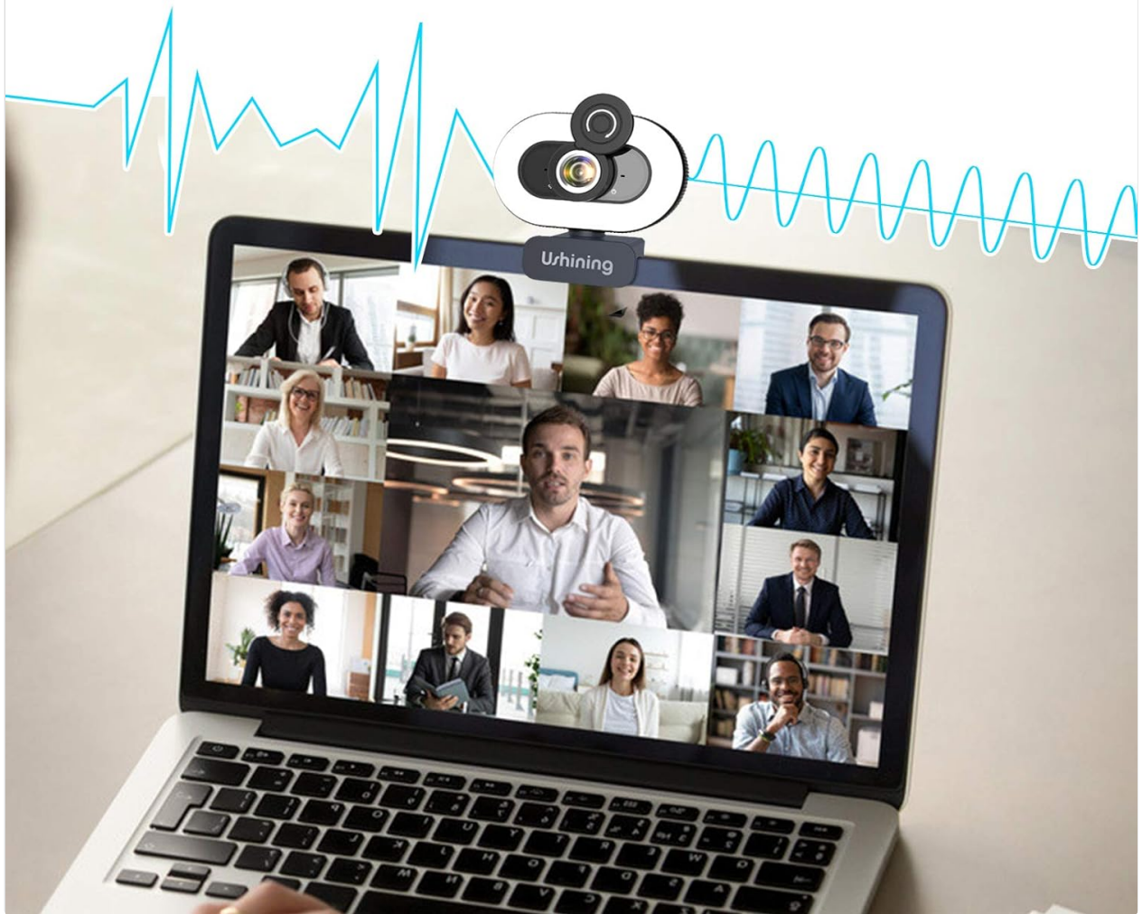
Image 4: Illustrates the difference between 720P and 1080P video clarity, highlighting the Full HD capability of the webcam.

Make sure your every words is loud and clear