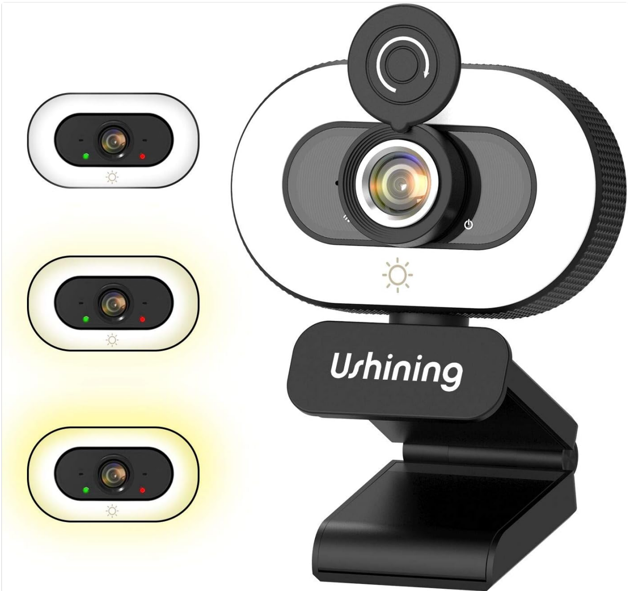
Image 1: USHINING BF-N11 HD Webcam with its integrated ring light and privacy cover.