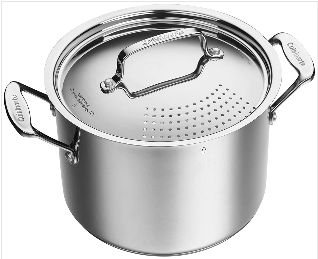
Image: The Cuisinart 6.3-Quart Stainless Steel Pasta Pot with its straining cover.

The Cuisinart pasta pot is designed for boiling, simmering, and preparing various dishes. Its stainless steel construction ensures durability and even heat distribution.