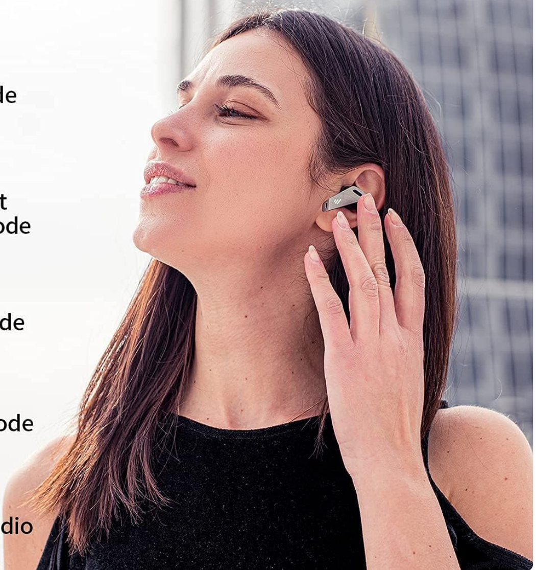
Image: Visual representation of the six custom sound modes available, including ANC, Ambient Sound, Game Mode, Normal Mode, and Spatial Audio.

Video: A demonstration of the TWS NB2 Pro's mode switching capabilities, showcasing the difference between Normal, Ambient Sound, and Noise Reduction modes in a train environment.