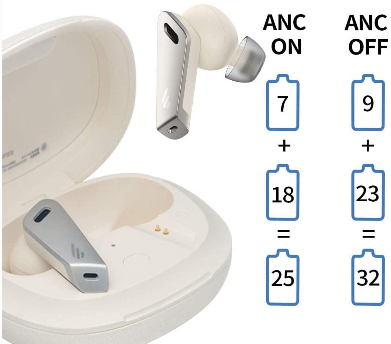
Image: Battery life breakdown for ANC on and off, showing up to 32 hours total play time.

Video: A short demonstration of the Edifier NB2 Pro earbuds, showcasing their design and features. This video provides a quick visual overview of the product.