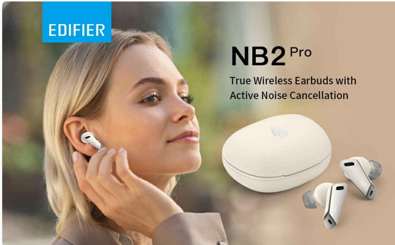
Image: Edifier NB2 Pro True Wireless Earbuds and charging case.

Thank you for choosing the Edifier NB2 Pro True Wireless Earbuds. These earbuds are designed to provide a superior audio experience with advanced features such as Hybrid Active Noise Cancelling, Bluetooth 5.0 connectivity, and app control. This manual will guide you through the setup, operation, and maintenance of your new earbuds to ensure optimal performance and longevity.