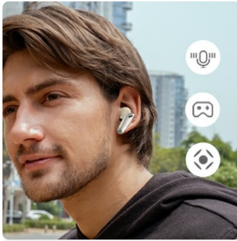
Image: Close-up of an earbud highlighting the in-ear sensor for smart pause functionality.