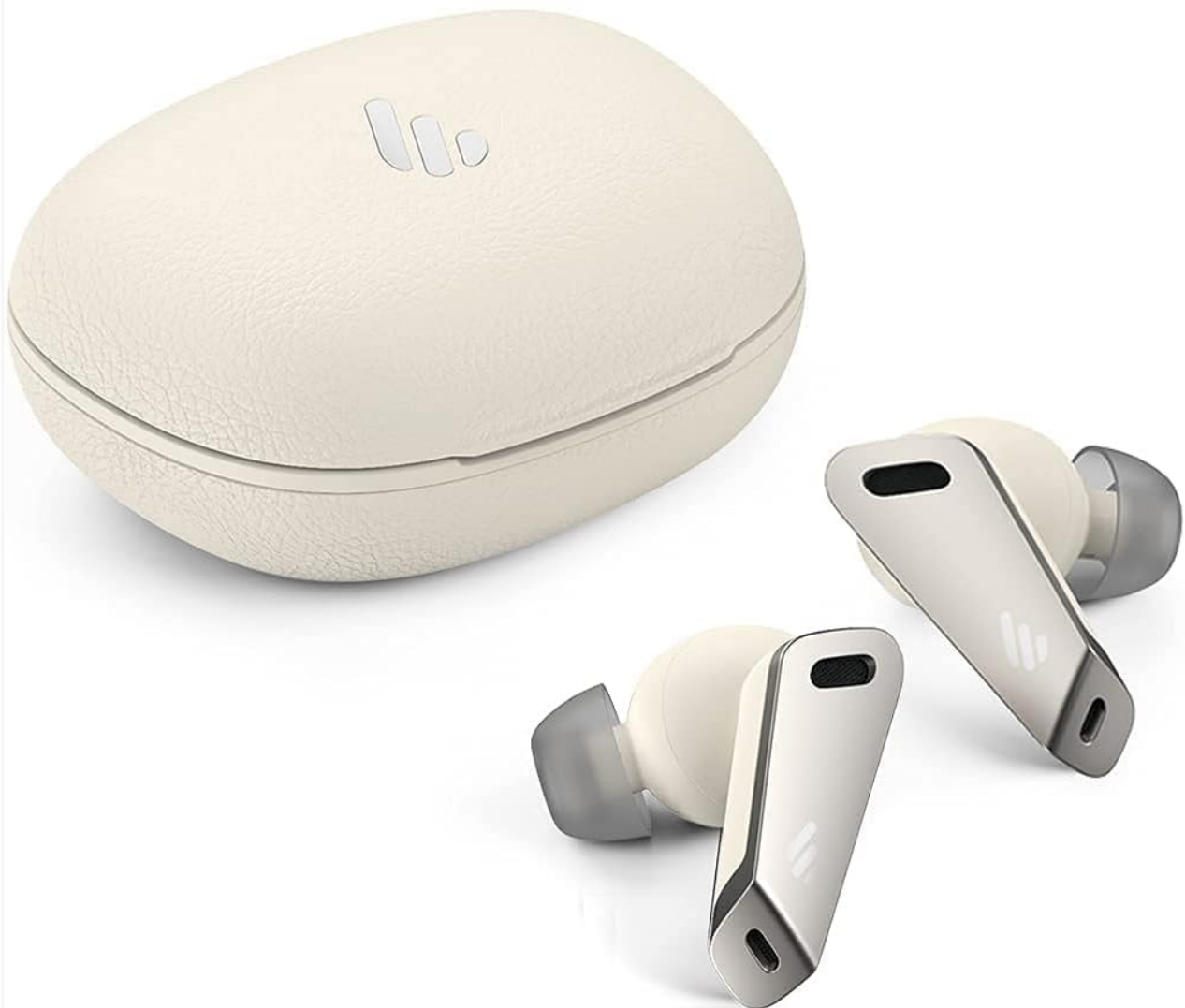
Image: Earbuds, charging case, and various ear tip sizes.