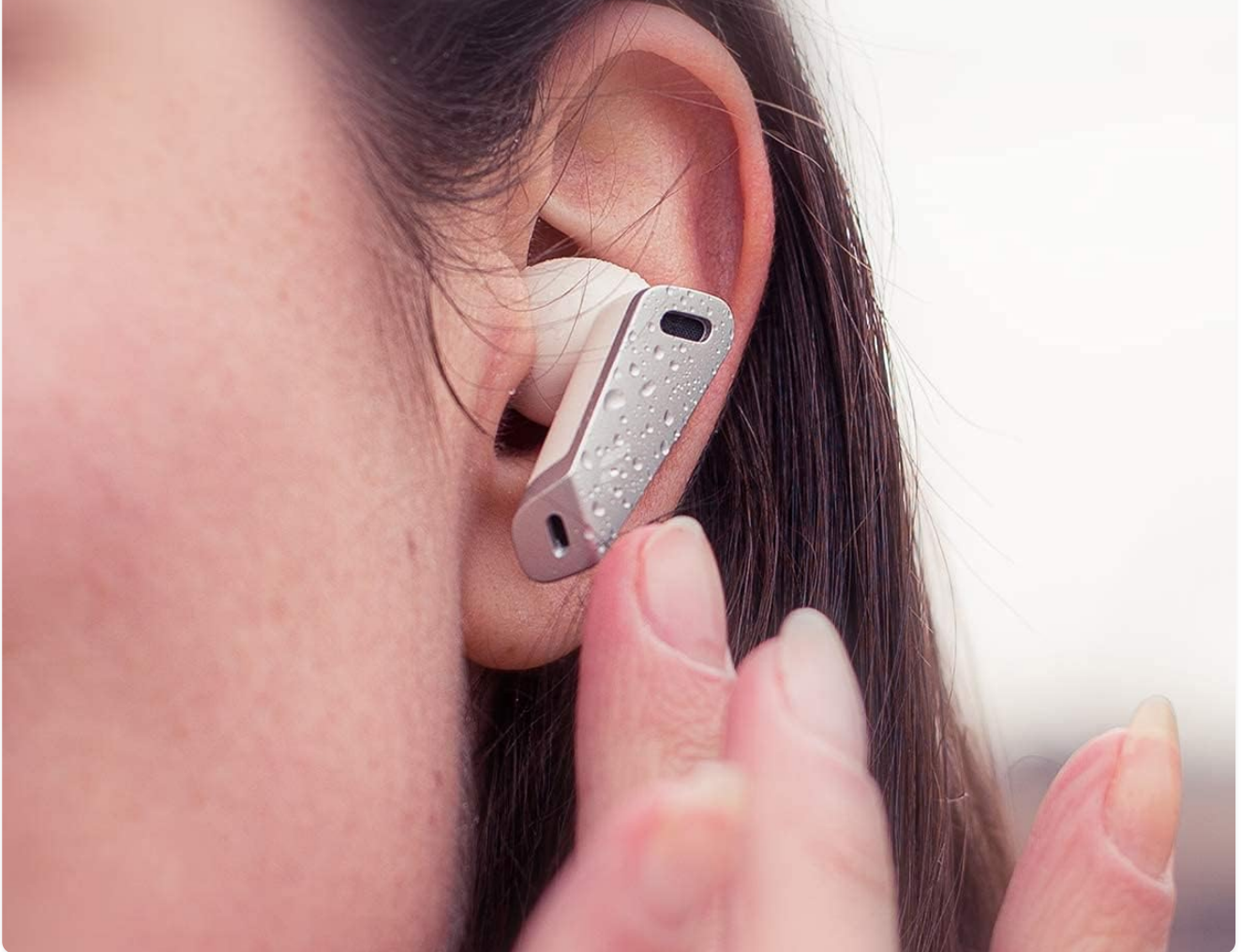
Image: Earbuds with water droplets, illustrating their IP54 sweat, water, and dust resistance.